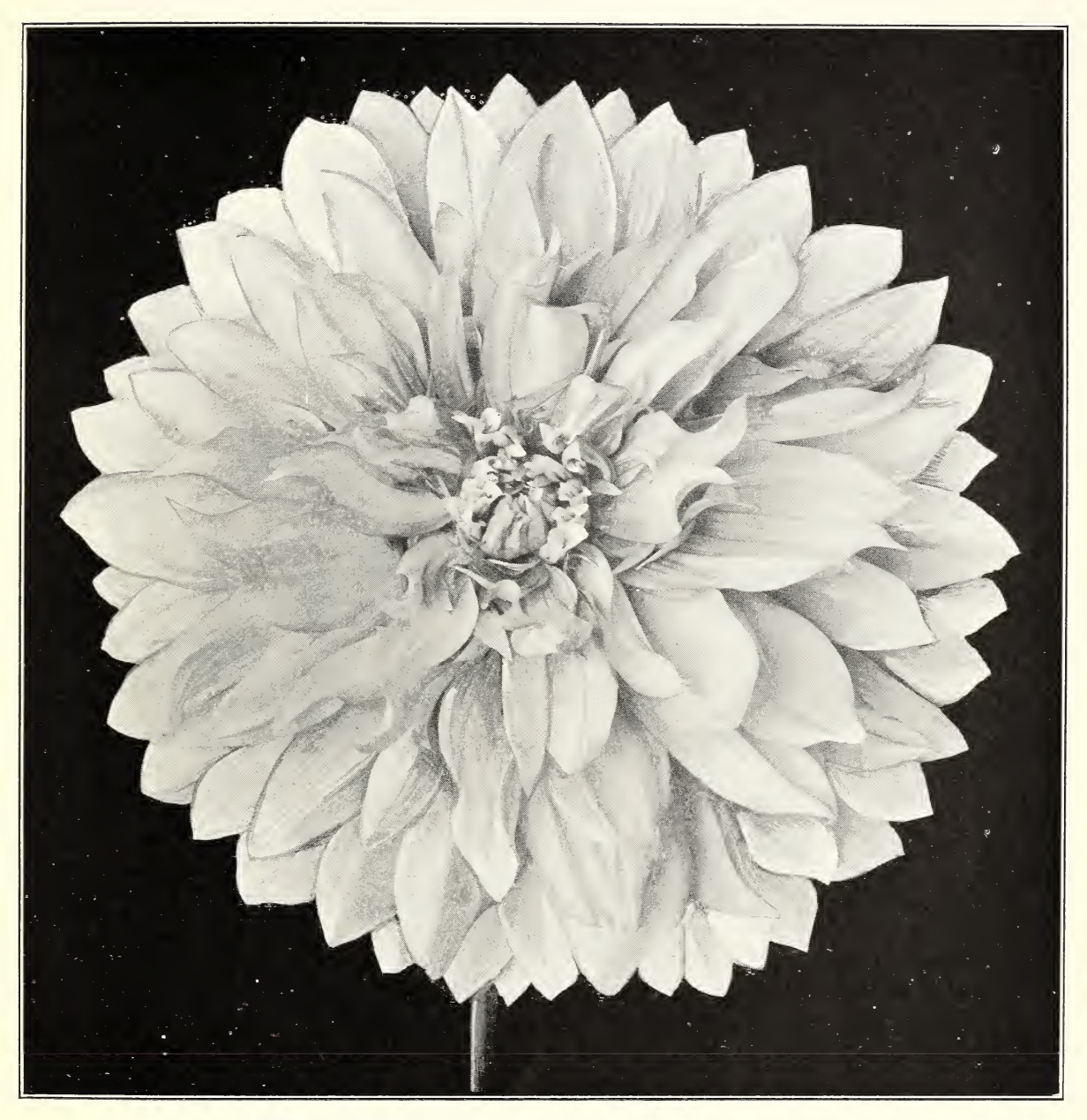
NEW DECORATIVE DAHLIA, "GOLDEN GLOW" For description see page 1