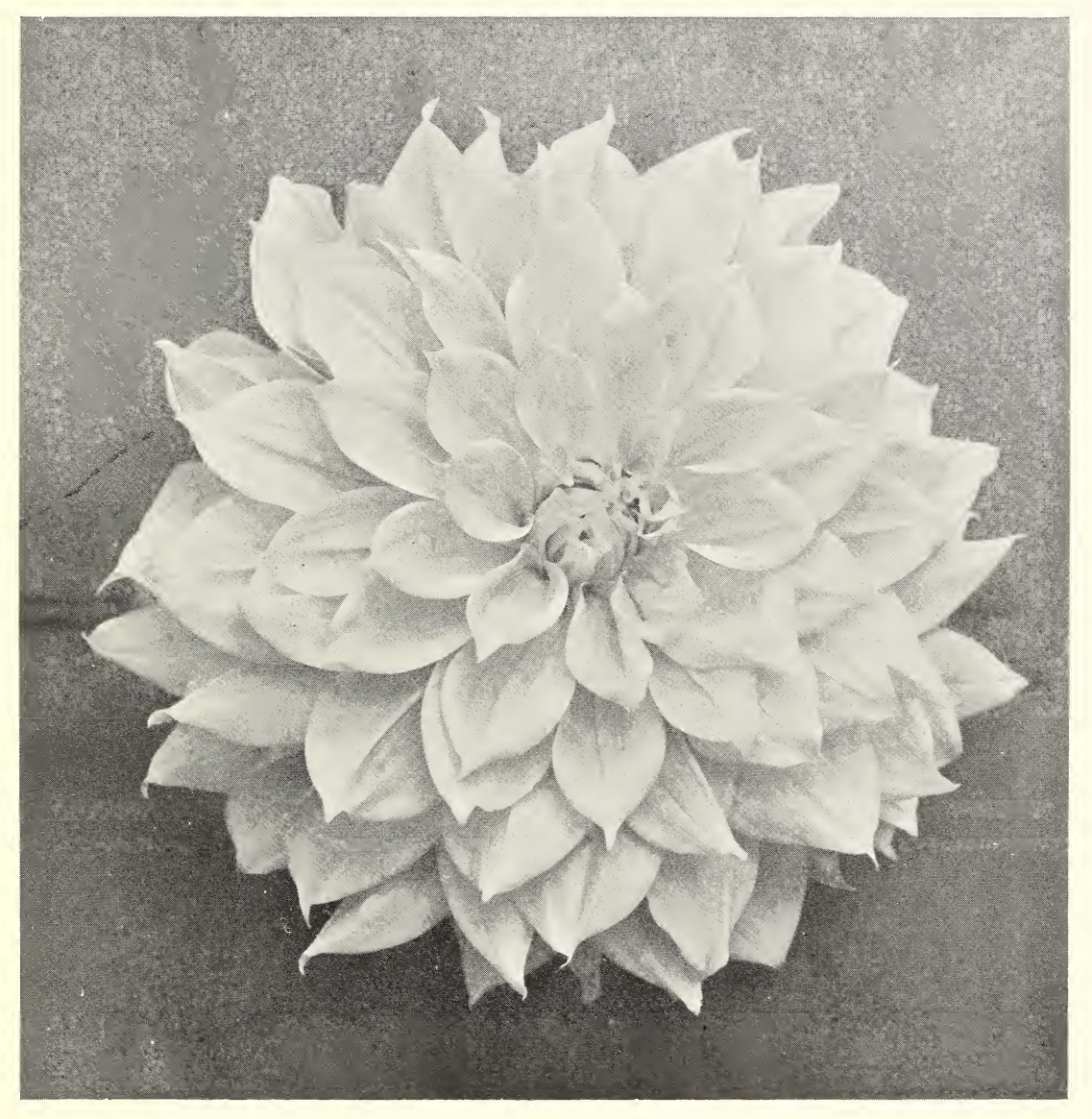
DECORATIVE DAHLIA, "CAROLYN WINTJEN" For description see page 1