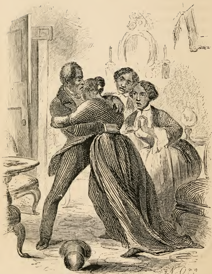
RIVAL HOME, AND FIRST MEETING WITH HIS WIFE AND CHILDREN