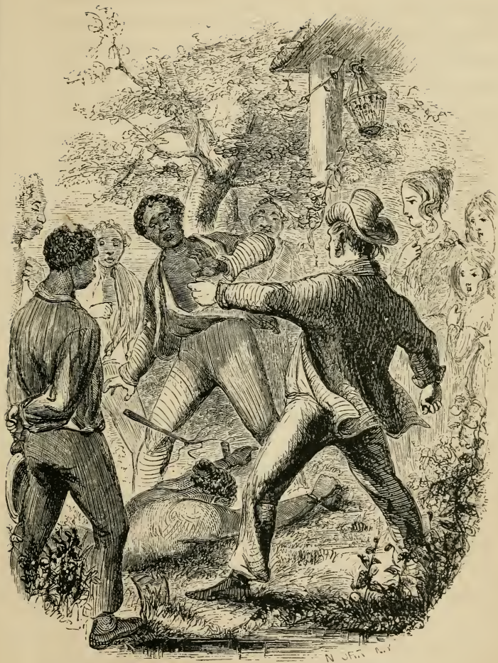
THE STAKING OUT AND FLOGGING OF THE GIRL PATSEY.