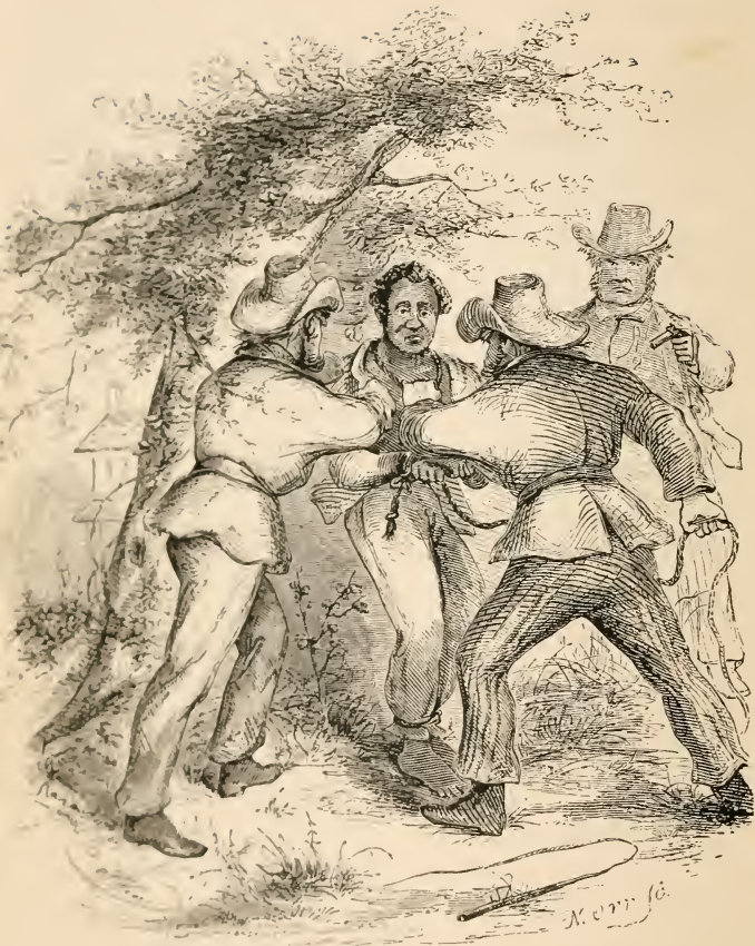
CHAPIN RESCUES SOLOMON FROM HANGING.