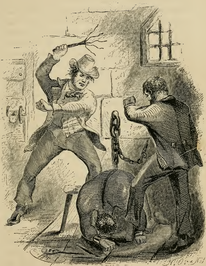
SCENE IN THE SLAVE PEN AT WASHINGTON.