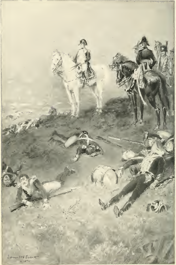
NAPOLEON ON THE BATTLEFIELD OF BORODINO.