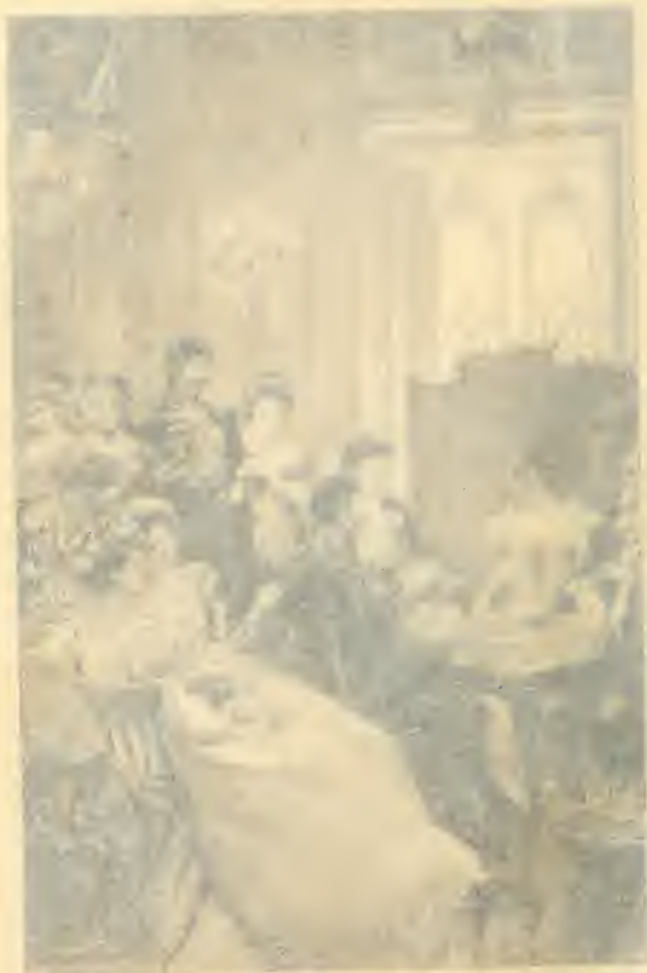
THE RECEPTION AT BERG'S