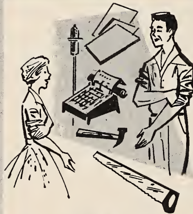
TAKE ON RESPONSIBILITIES