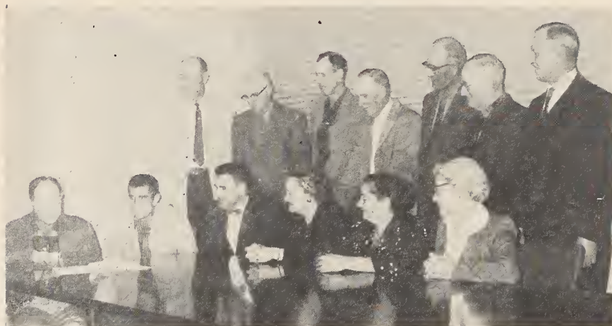
Kaufman County program building committee membership represents subject and activity area subcommittees along with leaders from significant groups and geographical areas of the county.