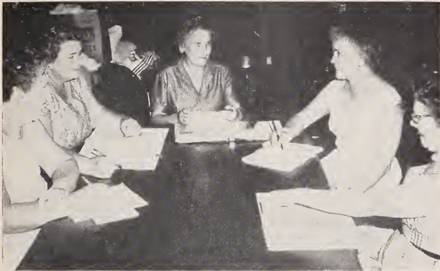
Berkeley County Farm Women Council in action on program planning. President of the county council, home agent, and Farm Women's Club representatives participate.