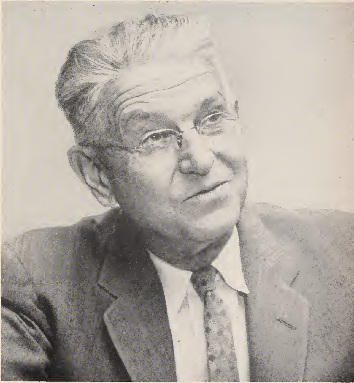
Meet the New Administrator, page 187 Special Program Planning Section, page 189

LIBRARY NEWFORD ★ NOV 3 - 1960 ★ U. S. DEPARTMENT OF AGRICULTURE