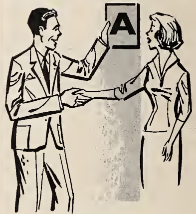
AGREE ON SOLUTIONS