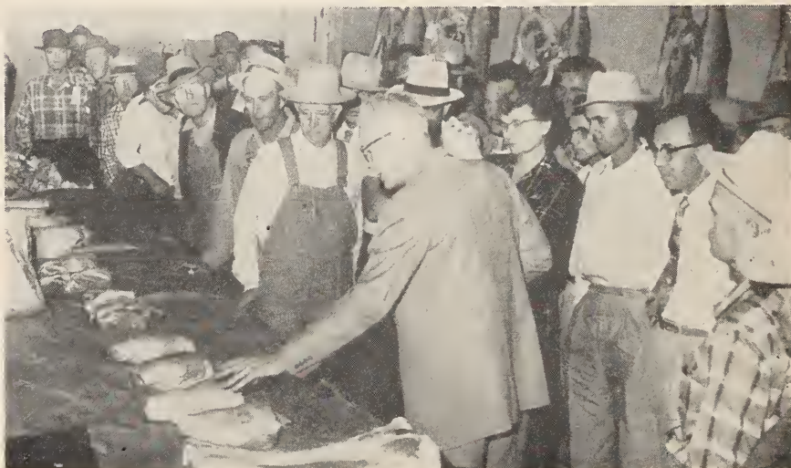
Special teaching events like this Mississippi tour increase the value of county program planning.

The program planning process must be continuous if the desired action is to take place.