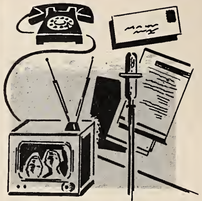
INFORM PUBLIC AT EACH STEP