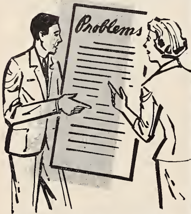
LIST PROBLEMS AND RESOURCES