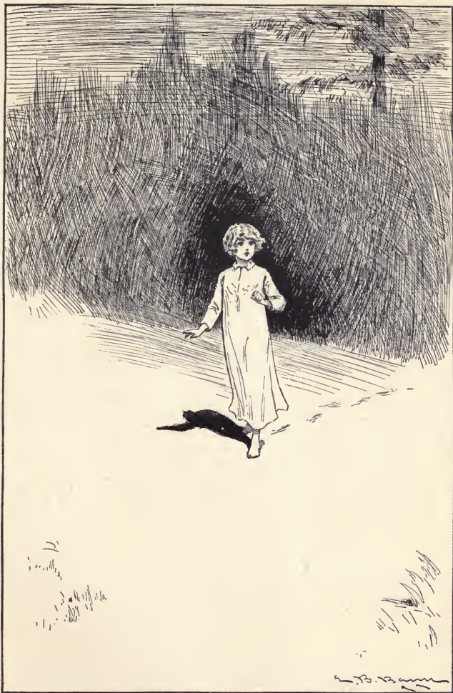
"A LITTLE FIGURE . . . STOOD OUT CLEAR AGAINST THE DARK FIRS."