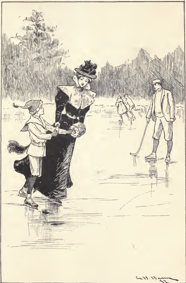
ON JIMMY'S POND.