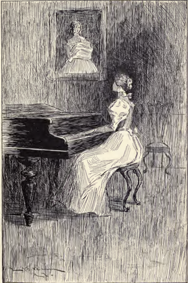
DIE EDLE MUSICA.