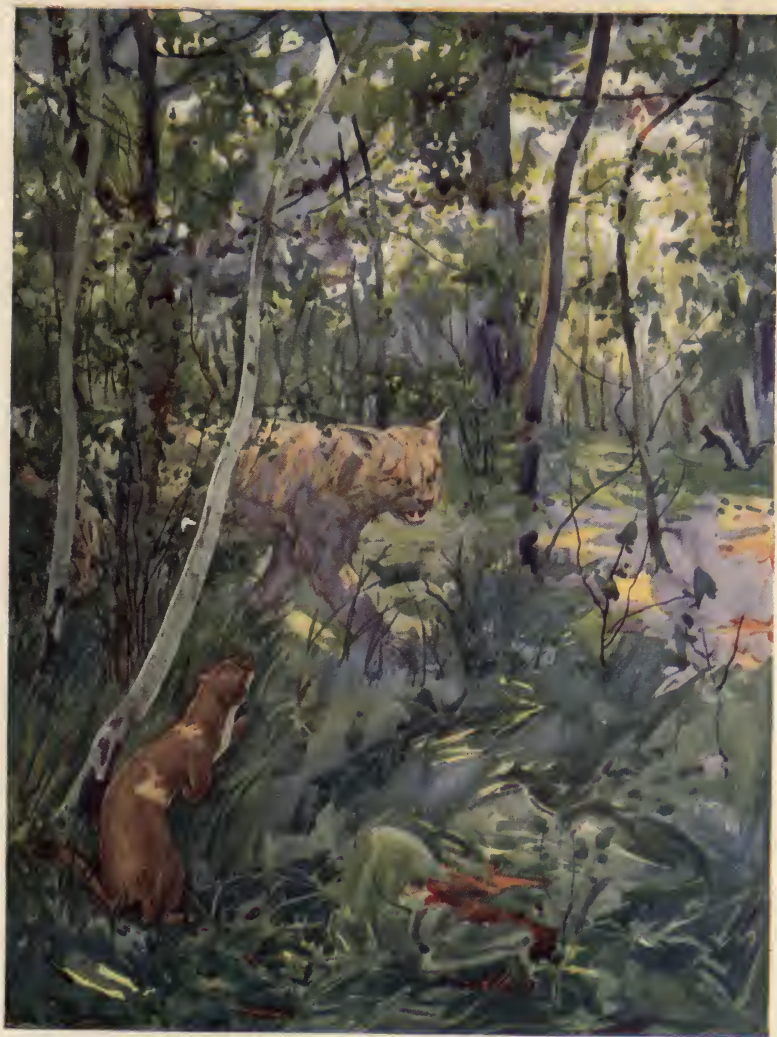
And the Weasel saw the Lynx go by