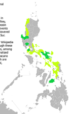
Map of the Philippines showing the activity of PH-WC. Location of members (green) and location of past outreach activities (blue green).

In less than five years since its foundation, PH-WC has grown from strength to strength as evidenced by the numerous activities it has organized and participated in all over the Philippines to further its aim of promoting the nation's many languages and cultures, as well as the growth of the various Philippine Wikias. As part of its inclusive and pluralistic focus, the organization is currently preiding over various outreach programs aimed at reaching out to marginalized groups in the Philippines. It always welcomes volunteers and participants who share our broad vision and encourage everyone with an interest to take part.