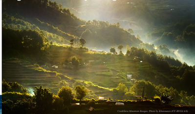
Cordillera Mountain Range.

R ice Terraces of the Philippine Cordilleras and Abra River, the seventh largest river system in the country in terms of watershed size, are the winning photographs in the second edition of Wiki Loves Earth in the Philippines.