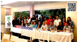
Wiki Loves Earth PH 2019 winners and PH-WC members at the awarding event.