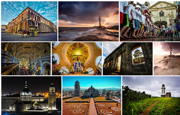
Wiki Loves Monuments in the Philippines 2019 top 10 photographs (CC-BY-SA 4.0)