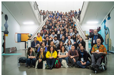
Group photo of Wikimedia + Education Conference participants.

From April 5 to 7, 2019 the first conference on Education and Wikimedia was held in San Sebastian, Basque Country in Spain. About 130 people discussed the relationship between Wikimedia and education, how Wikimedia projects can be used in the educational process and how it can improve with this participation.