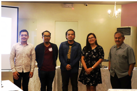
PH-WC Board of Trustees 2019-2020, and incorporators of Philippine Wikimedia Community, during the awarding ceremony of Wiki Loves Earth Philippines on August 1, 2019.

Inako kan konstitusyon an bago kaining konstitusyon asin by-laws kan Mayo 21 asin natataman nin pagpangunod bilang non-stock, non-profit company pikan sa Securities and Exchange Commission (SEC) kan Republika nin Pilipinas kan Hunyo 18, 2019.