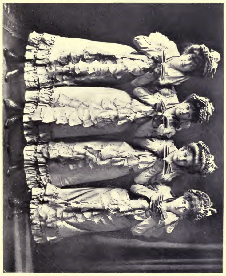
"FROM THE LAND OF THE CEREBELLUM"