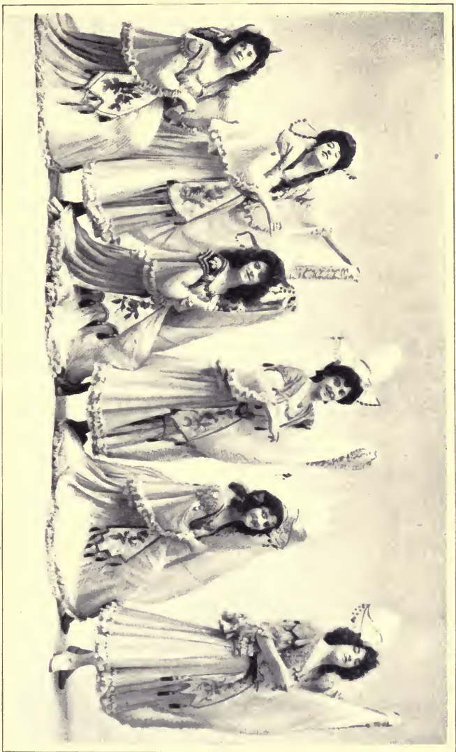
"IN EARLY MORN, AT BREAKFAST-TIME" Six of Ki-Ram's Wives