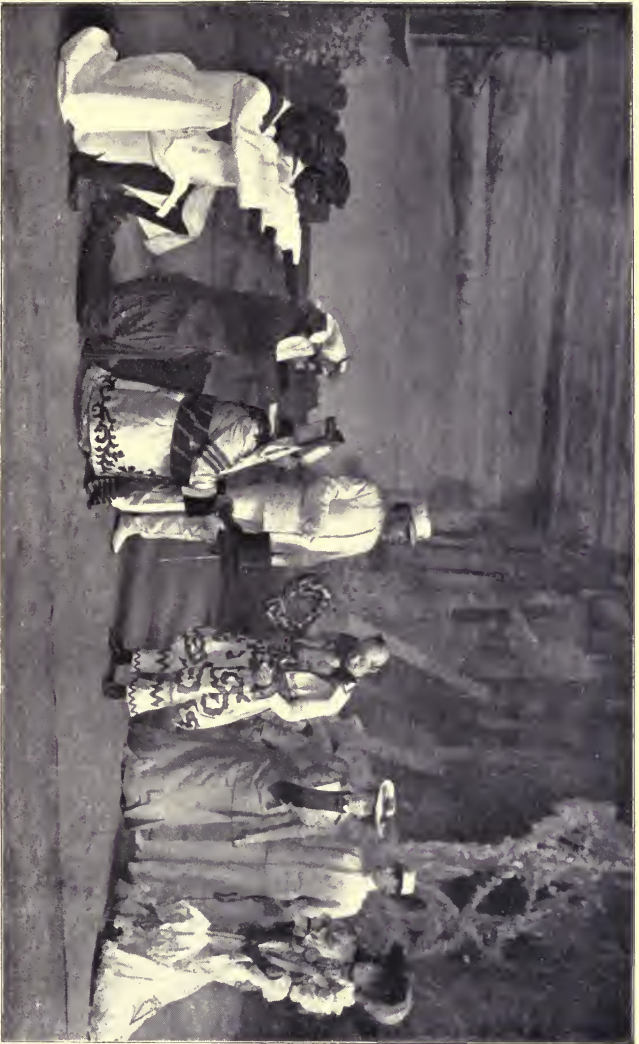
THE INAUGURATION OF KI-RAM AS GOVERNOR OF SULU