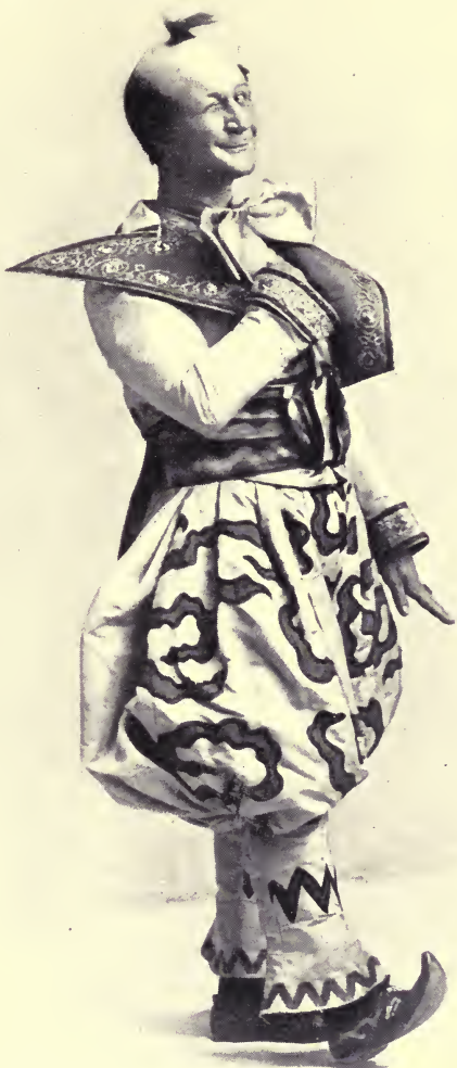
"THE CONSTITUTION AND THE COCKTAIL FOLLOW THE FLAG" Mr. Moulan as Ki-RAM