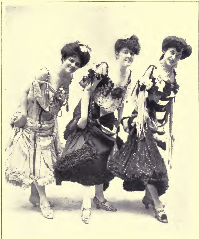
THREE OF THE "AMERICANIZED" WIVES