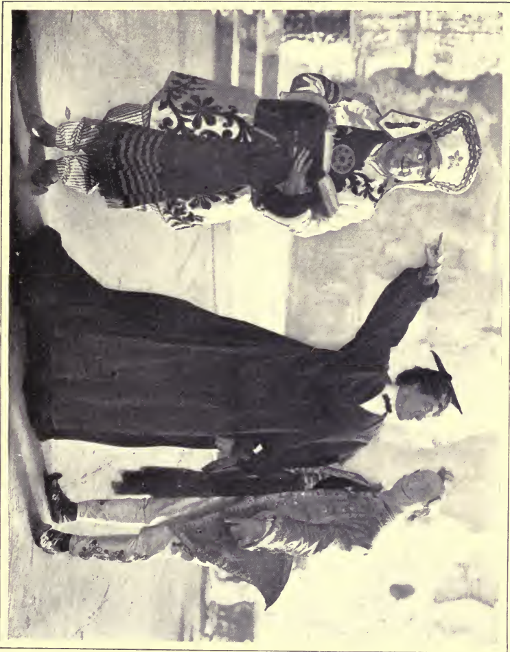
" AT FIVE O'CLOCK YOU PAY FOUR TIMES YOUR INCOME "