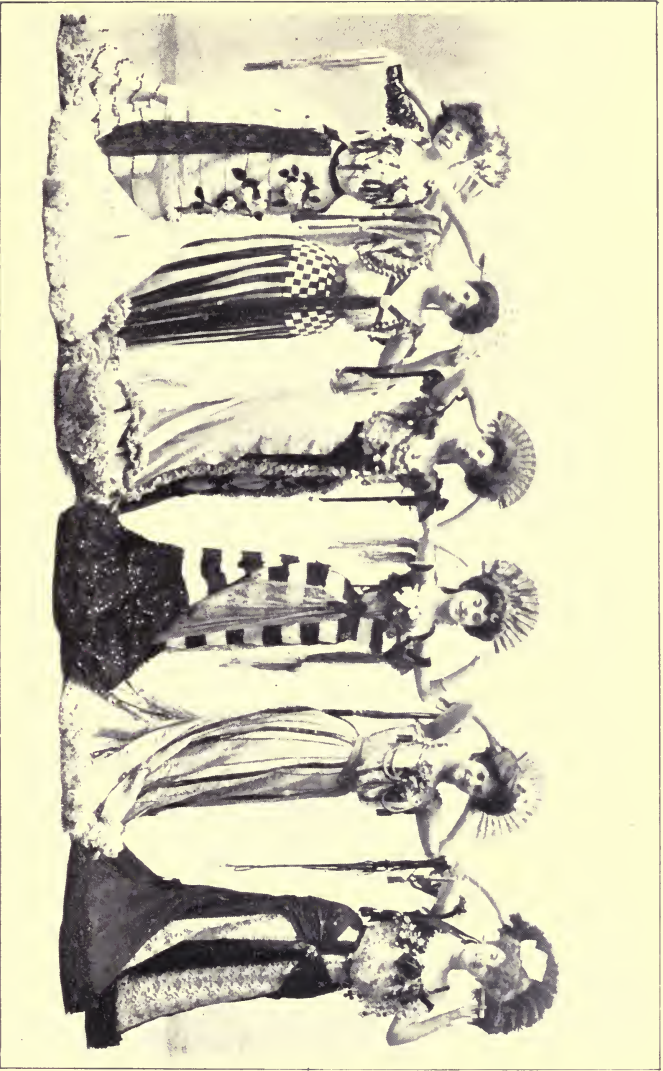
SIX OF KI-RAM'S WIVES, AFTER BEING "ASSIMILATED."