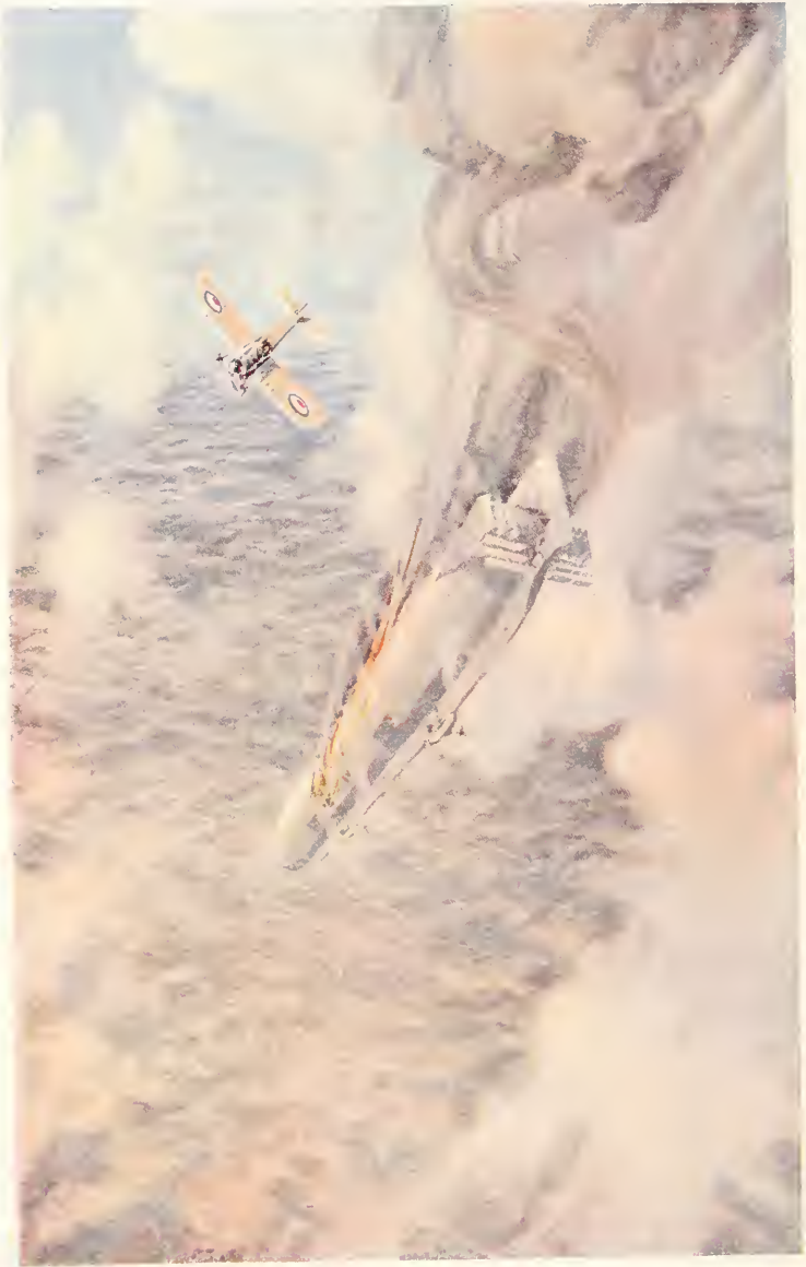
Fr. The Glorious Achievement of Lieut. Warneford, V.C.