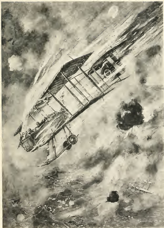
A British Aeroplane Ablaze after a Duel with a Giant Biplane