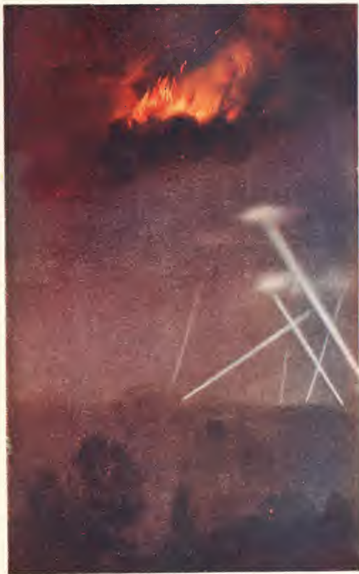
The Destruction of a Zeppelin at Cuffley by Lieut. Robinson