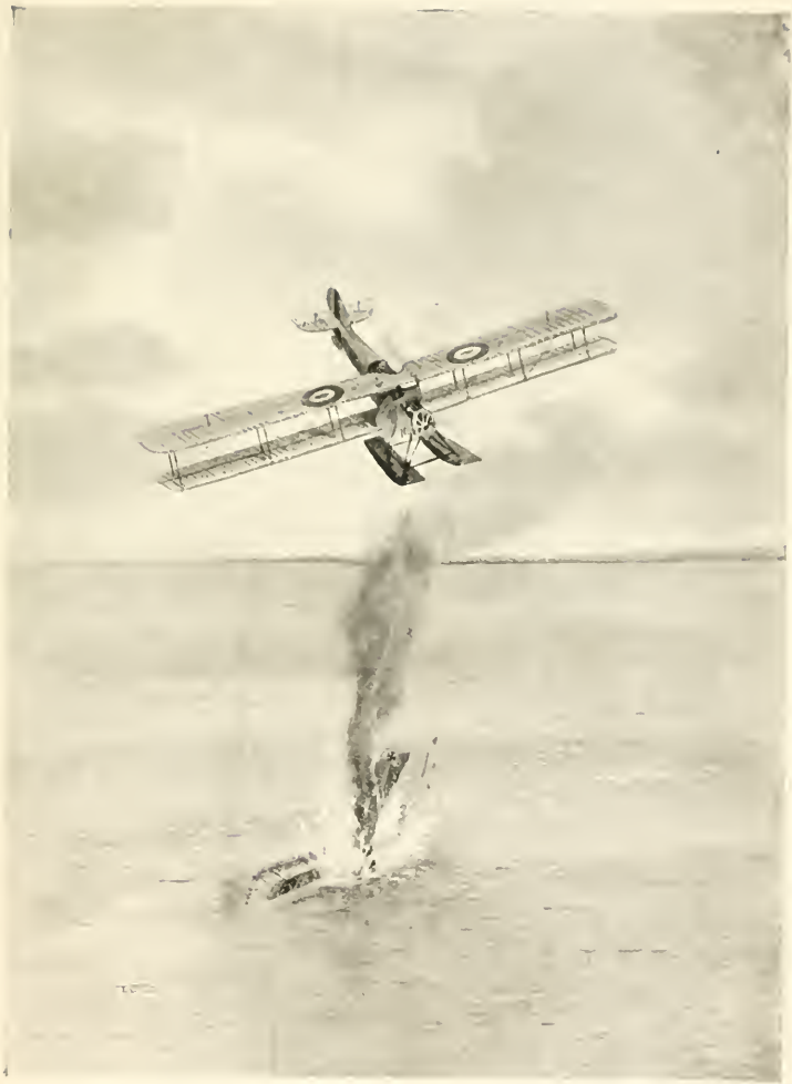
The R.N.A.S. at Work A seaplane duel off the Belgian coast