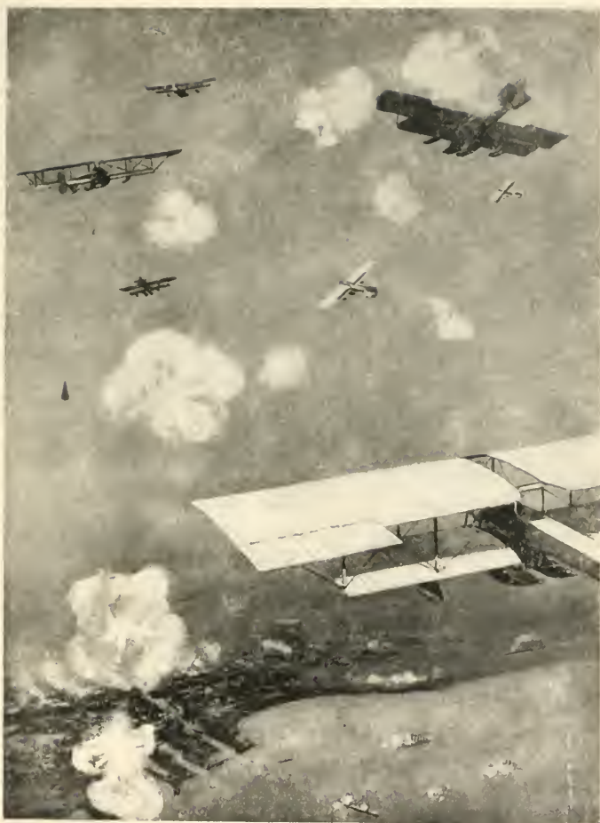
The British Air Raid on Cuxhaven, Christmas Day 1914