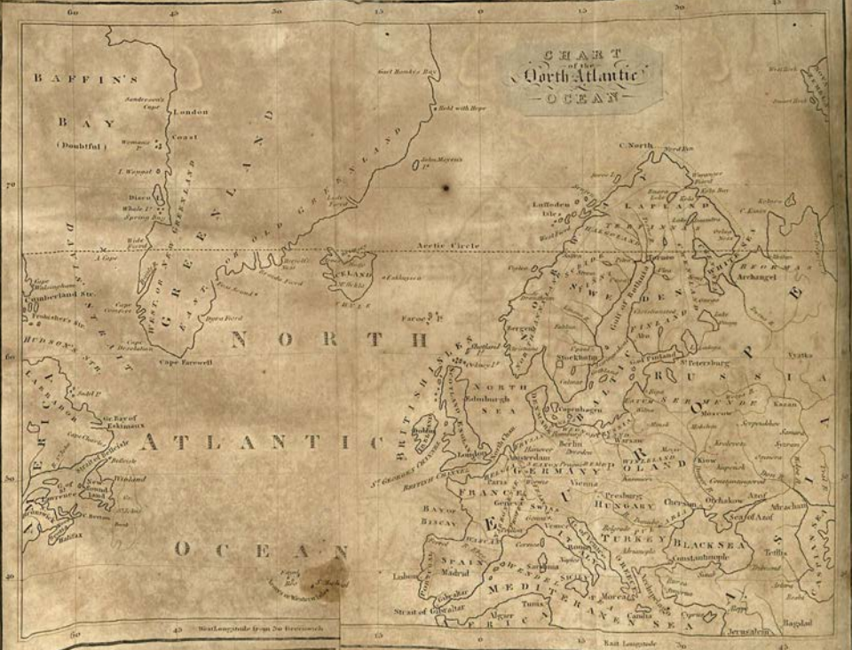
CHART of the North Atlantic - OCEAN -