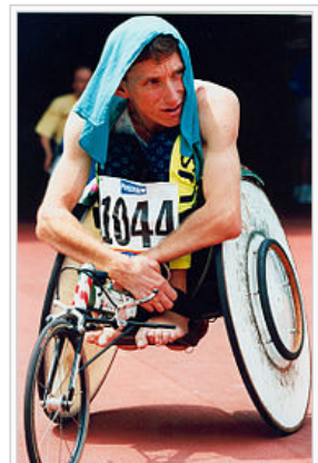
Australian T50 wheelchair athlete Fabian Blattman shades himself with a towel while he waits for his event at the 1996 Atlanta Paralympic Games ↗

You can also upload your own pictures to Commons. More information about that can be found at http://c.enwp.org/Commons:First_steps/Upload_form