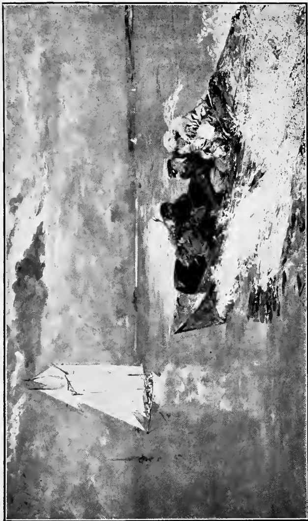
“They eloped in ‘The Geisha,’ leaving New London hurriedly at half past six”