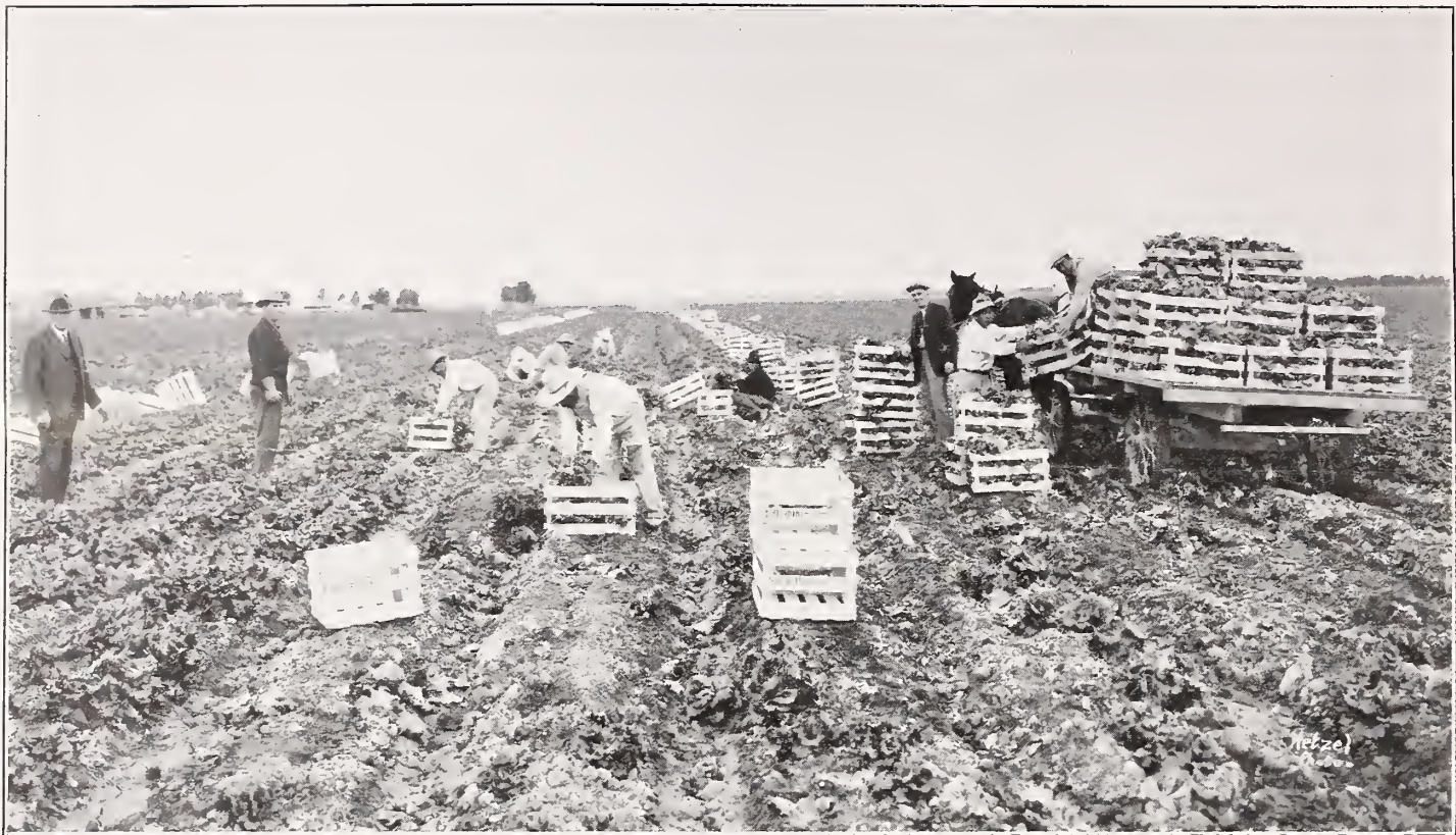
HARVESTING FOR MARKET A 400-ACRE FIELD OF PIETERS-WHEELER SELECT NEW YORK LETTUCE