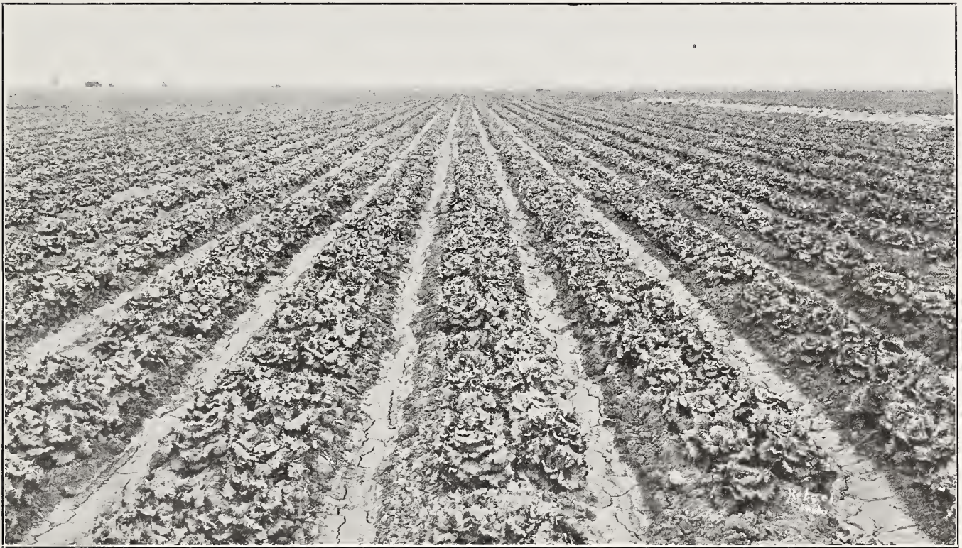
ANOTHER VIEW OF THE 400-ACRE FIELD OF PIETERS-WHEELER SELECT NEW YORK LETTUCE AS GROWN BY HUNT-HATCH & CO. IN IMPERIAL VALLEY.

All dealers should carry a good stock of New York Lettuce. If interested, write for prices on this or any variety of lettuce. We have IMPROVED STRAINS of many sorts.