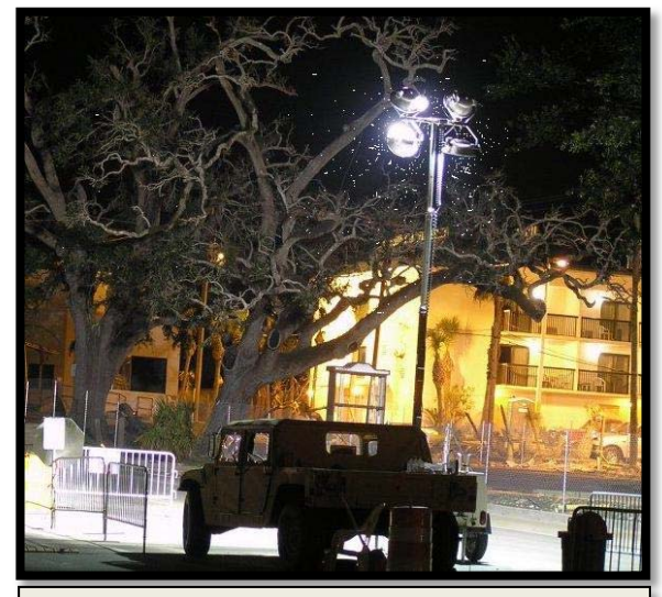
Light Sources. Adult Paederus beetles are highly attracted to bright light sources such as generatorpowered light towers near guardshacks and security checkpoints. Avoid siting or standing directly underneath these light sources to avoid coming in contact with these beetles.