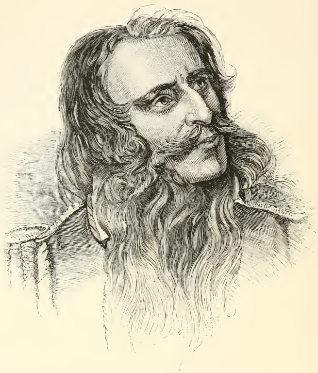
SIR CHARLES NAPIER.