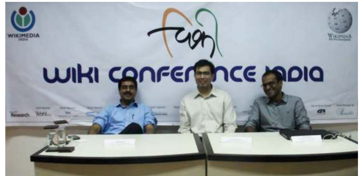
Wikipedia in Mumbai