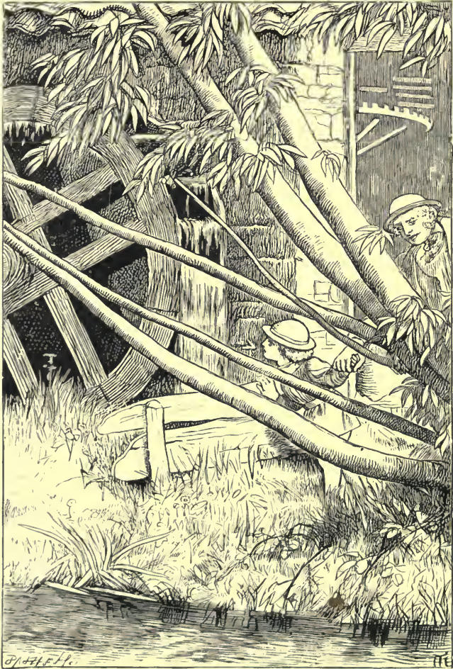
WILLIE IS TAKEN TO SEE A WATER-WHEEL..