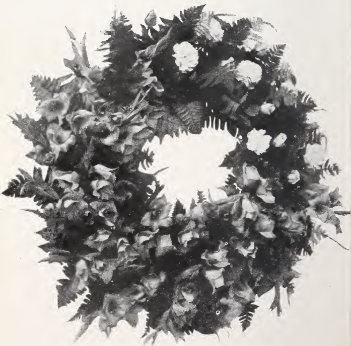
YELLOW TREASURE (A New Austin Origination)

These have stood the TEST OF TIME FOR MORE THAN TEN YEARS, and should be in every garden as worthy standards for comparison.