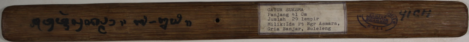
Catur Suksma Pusat Dokumentasi Dinas Kebudayaan Provinsi