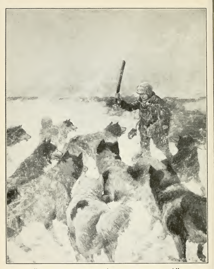
" BACK, YOU, CRACKER! BACK, YOU, SMOKE!" (See page 85)