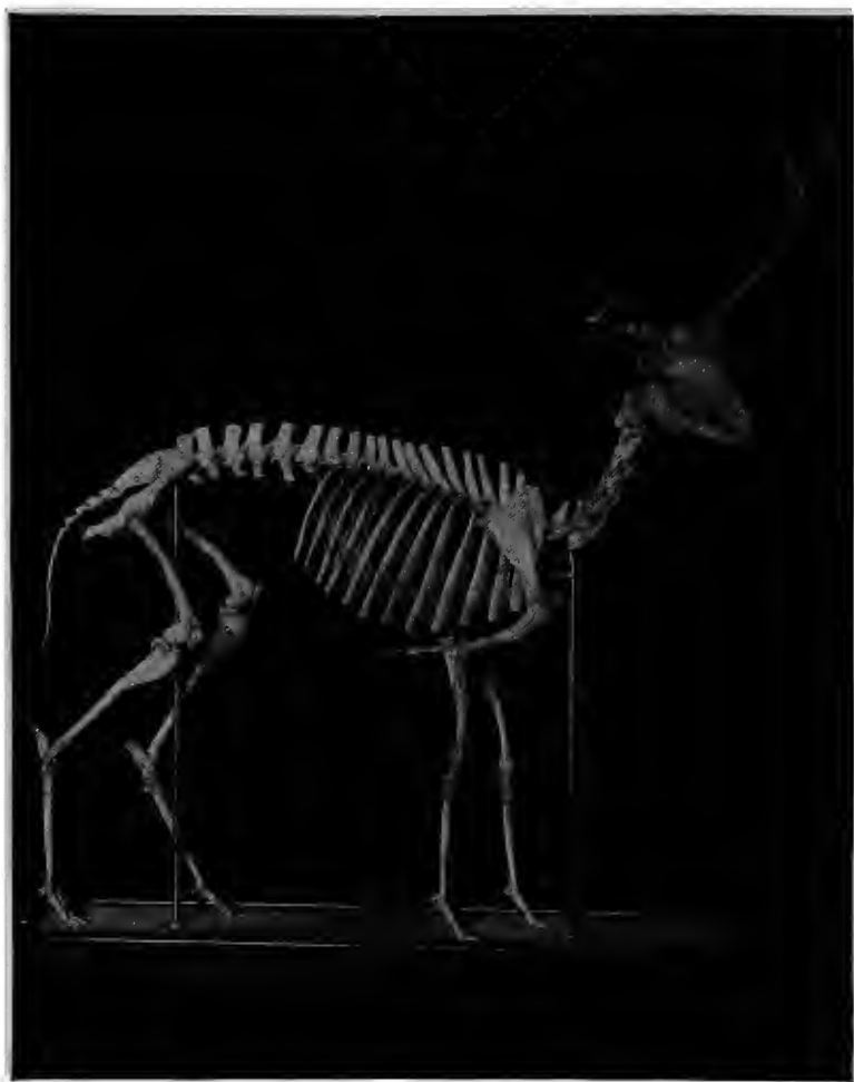
Merycodus osborni MATTHEW.