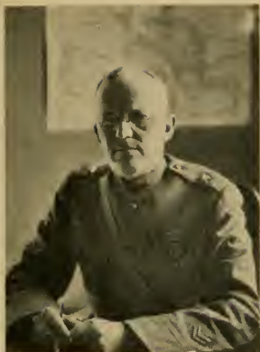
BRIG. GEN. EDGAR JADWIN