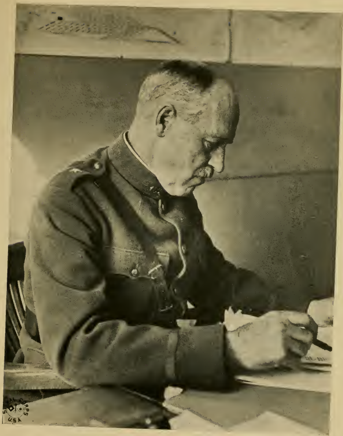
BRIGADIER GENERAL W. W. ATTERBURY Director General of Transportation, A. E. F.