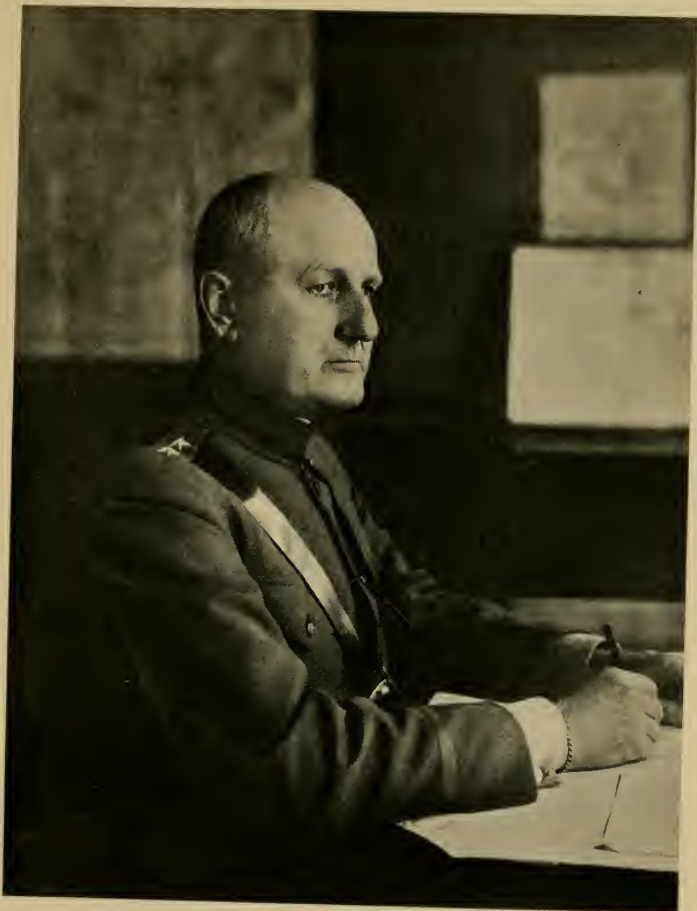
MAJOR GENERAL JAMES G. HARBORD Commanding General of the S. O. S., A. E. F.