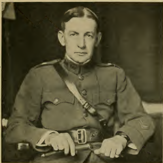
BRIGADIER GENERAL CHARLES G. DAWES General Purchasing Agent, A. E. F.