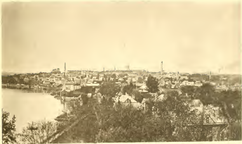
BIRD'S EYE VIEW OF THE CITY