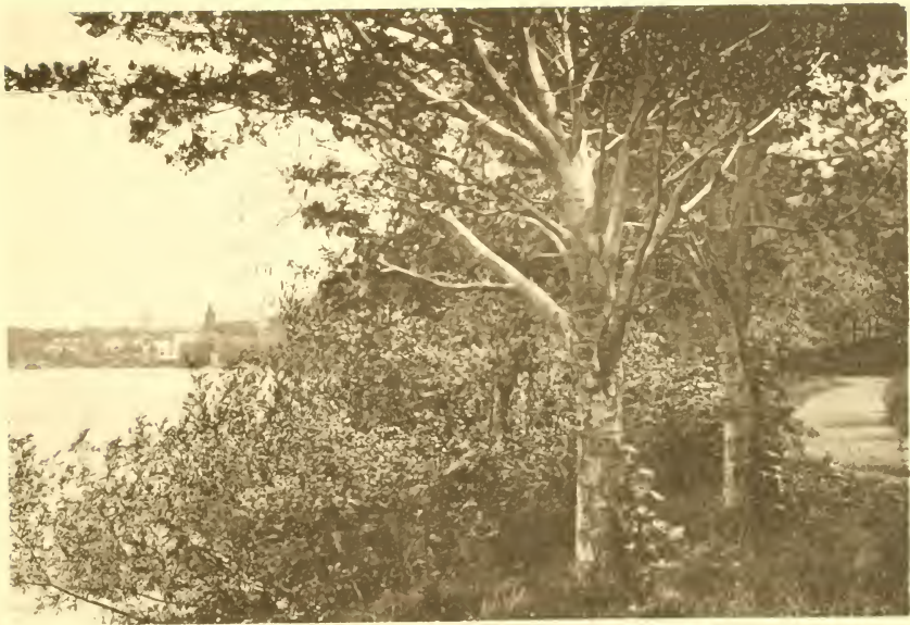
A GLIMPSE OF THE CITY AND LAKE