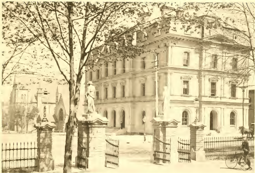
FIRST METHODIST AND BRETHREN CHURCH

TRENTON, N. J. - OCTOBER 1885 - FROM CENTRAL AVENUE