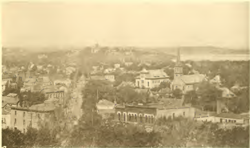
VIEW TOWARD THE UNIVERSITY AND LAKE MENAUSA FROM THE STATE HOUSE