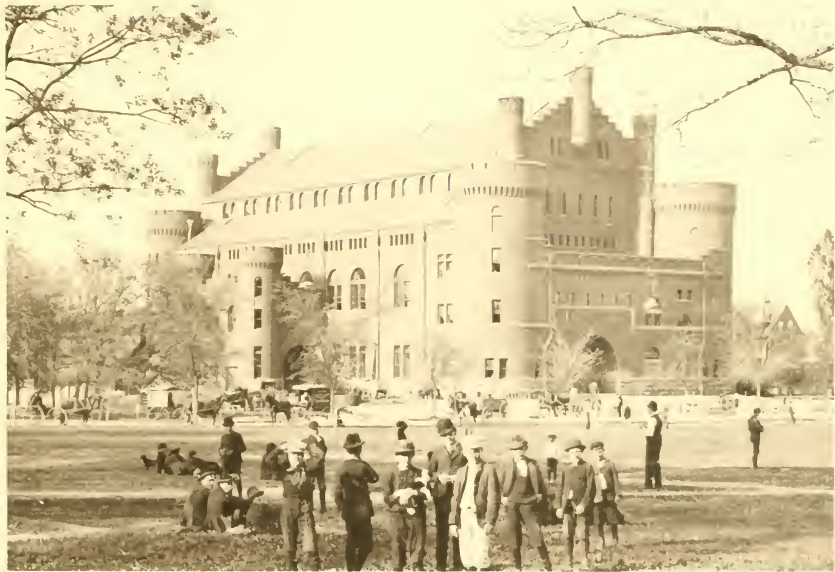
ARMORY AND GYMNASIUM.