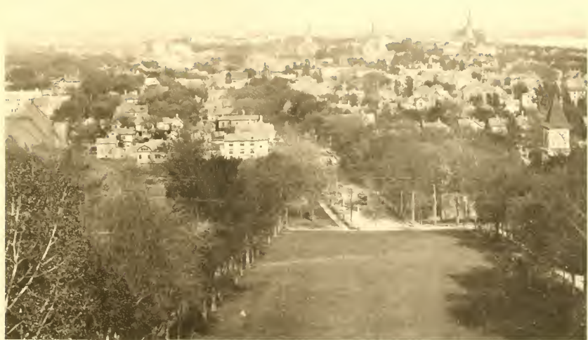
MASSACHUSETTS COLLEGE UNIVERSITY