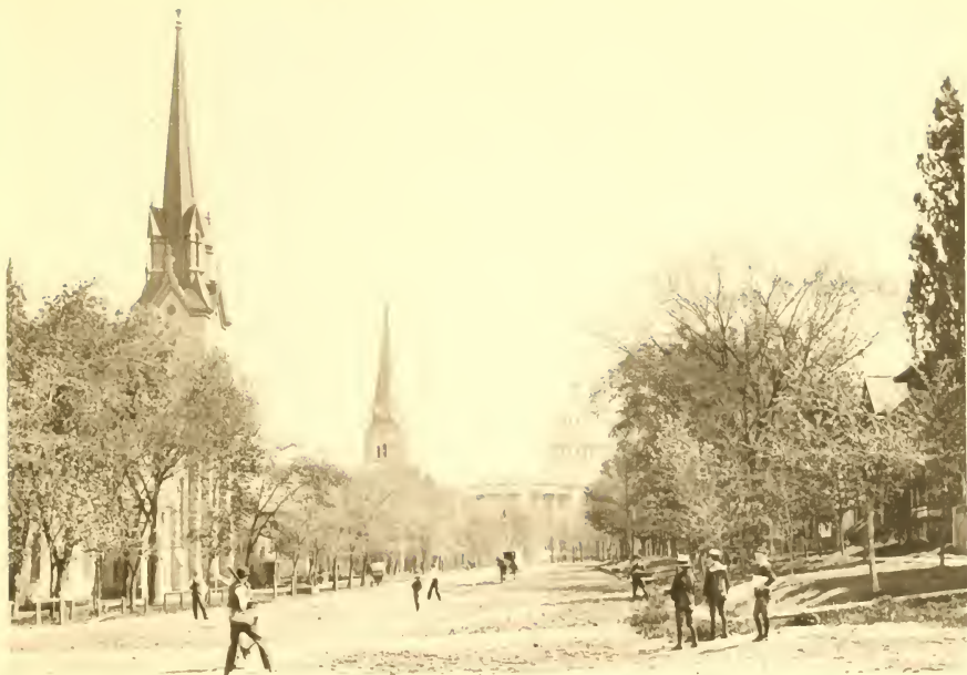
HARTFORD, CONN. AND GREAT EPISCOPAL CHURCH—WEST WASHINGTON STREET.