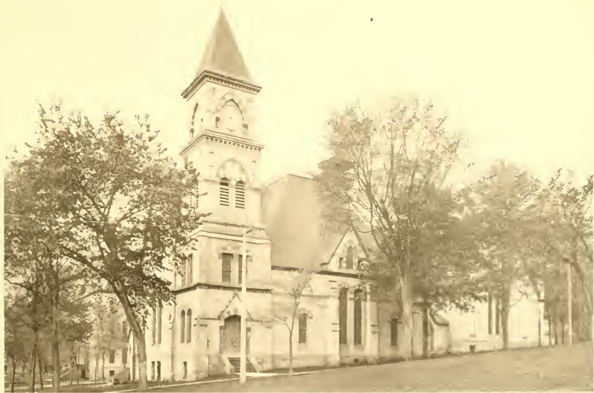
THE LIGHTING BUILDING