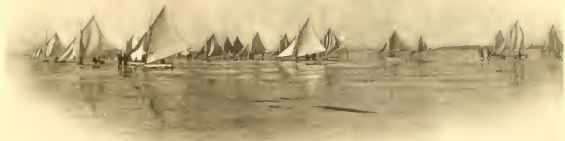
ICE BOAT REGATTA