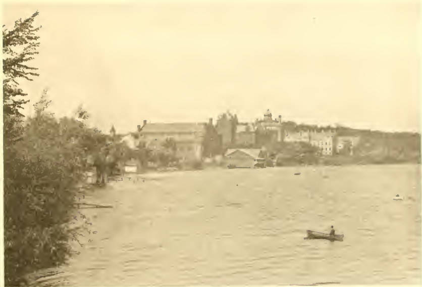
UNIVERSITY BUILDINGS FROM THE LAKE.