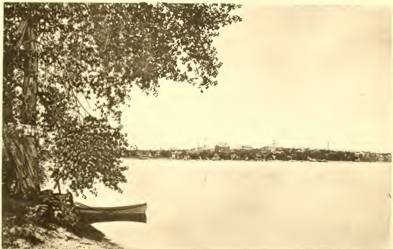
THE CITY FROM THE LAKE