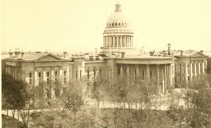
THE STATE CAPITOL