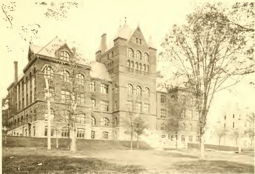
SCIENCE HALL, HARVARD UNIVERSITY