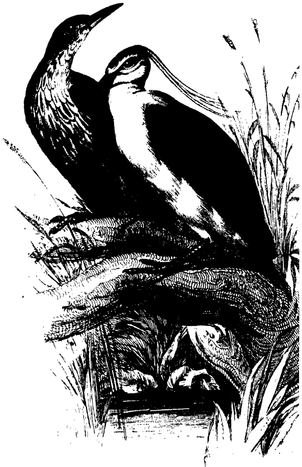
NIGHT HERON Young & Adult.