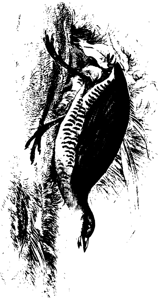
MEADOW OR CORN CRANE