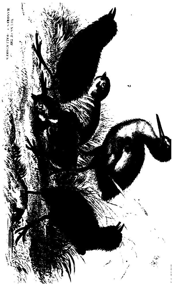
PLATE I. THE REPTILES OF THE ISLANDS OF THE ANTILLES.