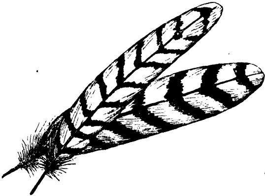
S. gallinago and major.

with white, broadly margined with pale ochreous-yellow, and undulated on their middle surface with lines of chestnut-red, the pale edges forming four lines along the back; the wings are greyish-black; secondaries tipped with white, the coverts broadly tipped with white and tinted with ochreous; the long tertials are edged with pale greyish-white, and undulated on their outer webs with pale chestnut-brown; the tail consists of twelve lanceolate feathers, and exhibits a form more wedge-shaped than most of the others, the colour is blackish-brown, edged with pale chestnut-brown; the belly and under parts pure white, on the flanks dashed with greyish-black, and tinted with brown; the axillary feathers white, clouded irregularly with blackish-grey; feet and legs greenish-grey.