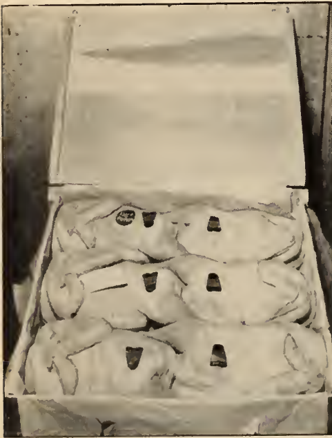
Grand Champion Commercial Box Pack, entered by Armour Creameries, Fargo, N. Dak. A fine entry in this department attracted much attention. Armour also won Champion Hen Pack and Cudahy Packing Co., Fairmont, N. Dak., Champion Tom Pack.

Thirteen states and 3 Canadian provinces defied Emperor Hirohito and all-out war to help stage a great 1942 All-American, pronounced an outstanding exhibition measuring well up with the many great shows of the past 19 years. It was the first wartime All-American and the management was prepared for almost anything to happen, all of it bad, as this great turkey classic faced up to try and stage its 1942 show.