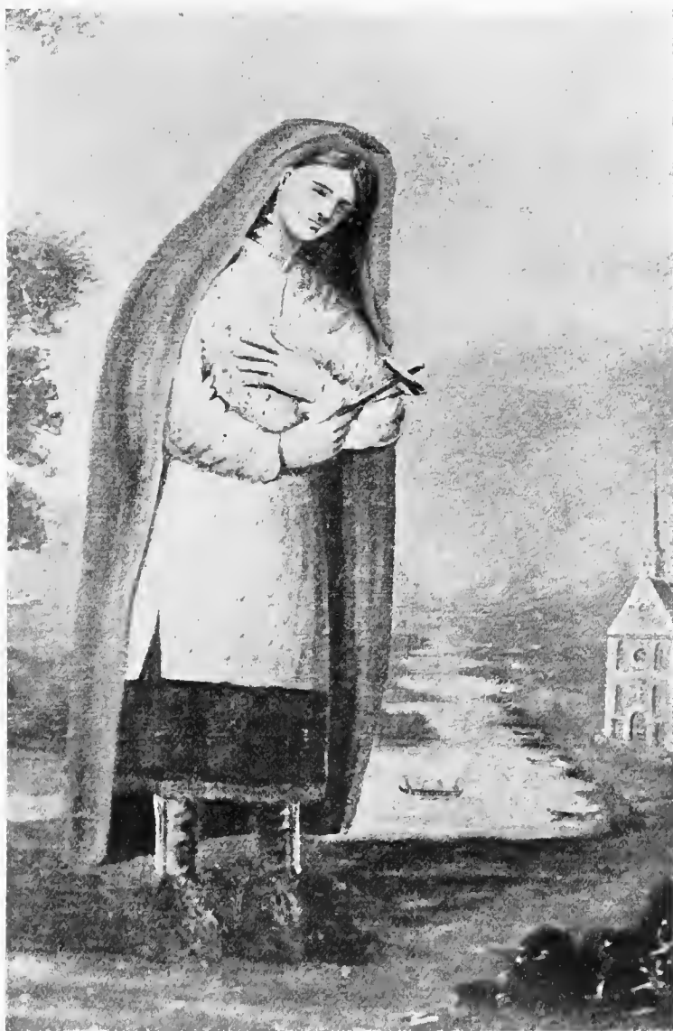
CATHERINE TEGAKWITA, THE LILY OF THE MOHAWKS.