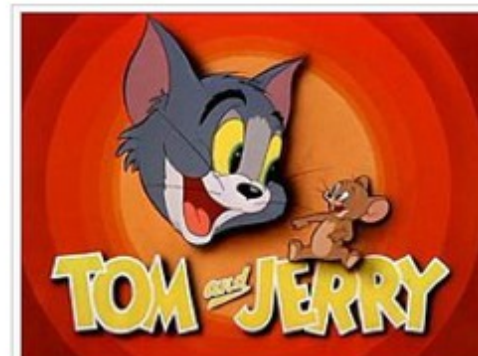
The Tom and Jerry title card used from 1947 to 1952.

Today, Time Warner (via its Turner Entertainment division) owns the rights to Tom and Jerry (with Warner Bros. handling distribution). Since the merger, Turner has produced the series Tom and Jerry Tales for The CW's Saturday morning "The CW4Kids" lineup, and a string of Tom and Jerry direct-to-video films—all in collaboration with Warner Bros. Animation .