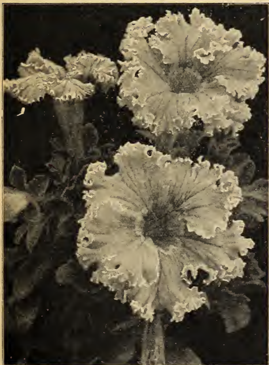
Ruffled Single Petunia