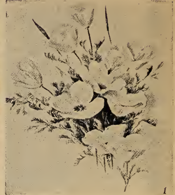
Eschscholtzia (Dainty Queen)

H. A. is for ANNUALS . Bloom the first year from seed and are all easily grown.