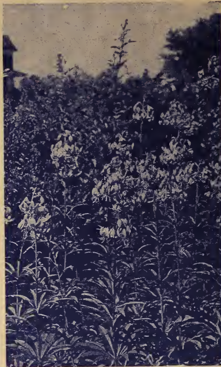
Hybrid Martagon Lilies "A GARDEN OF LILIES A spirit in them sings, A light about them beams."