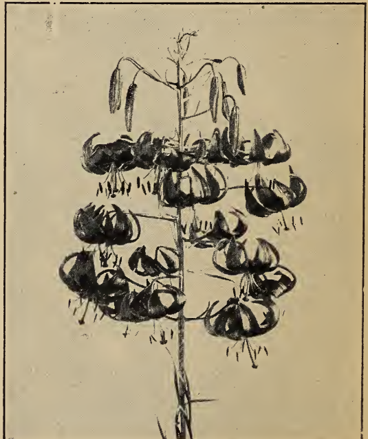
Tenuifolium, the Coral Lily

Parryii. 3-4 ft. Large trumpet flowers bright citron yellow, deliciously fragrant. Plant in warm, well-drained situation 10 inches deep. Each, 75c.; 3, $2.00; 12, $7.50.