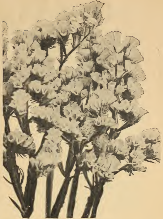
STATICE SINUATA "Rosea Superba"

For each of these we offer you 12 SELECT packets, adding 3 CHOICE NOVELTIES for $1.50. The cost is SMALL. Your surprise and JOY will be GREAT.