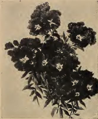
Godetia (Satin Flowers)

H. P. is for HARDY PERENNIALS . Grown easily from seed, and continue flowering annually for many years. Some varieties flower the first season if planted early.