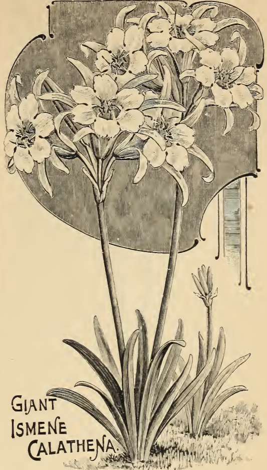
GIANT ISMENE CALATHEA

Scarlet, White, Crimson, Yellow, Salmon and Mixed. Each, 30c.; 12 for $3.00.