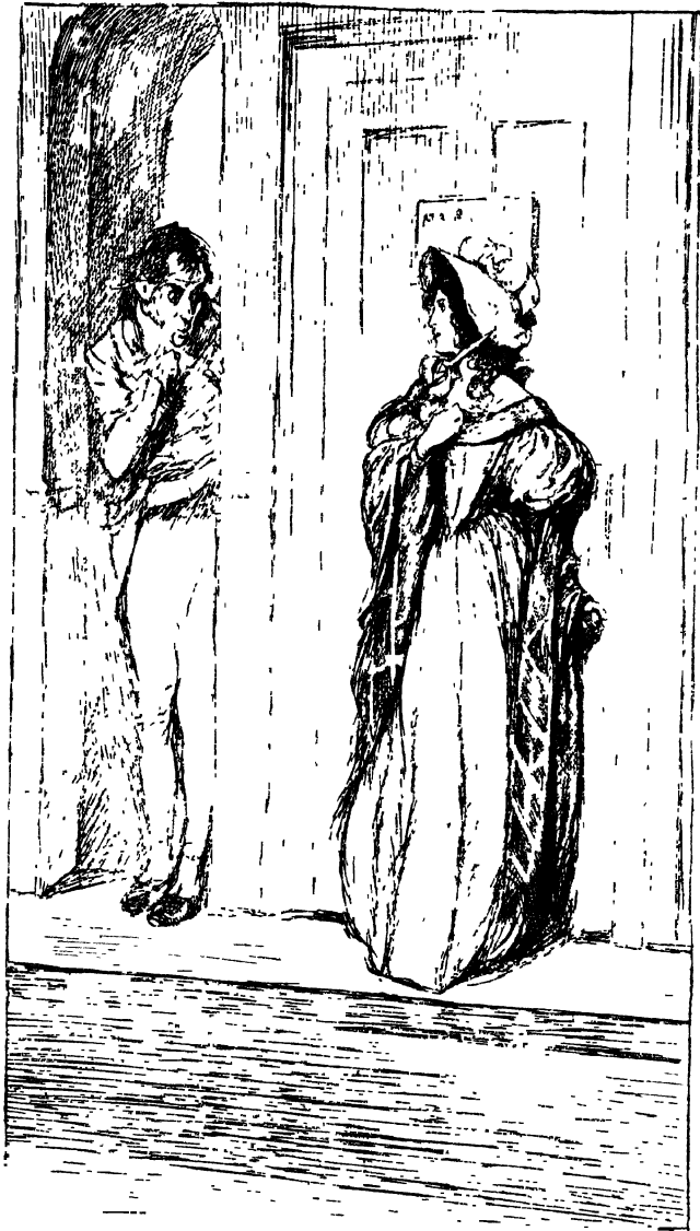
Newman Noggs surprises Kate Nickleby