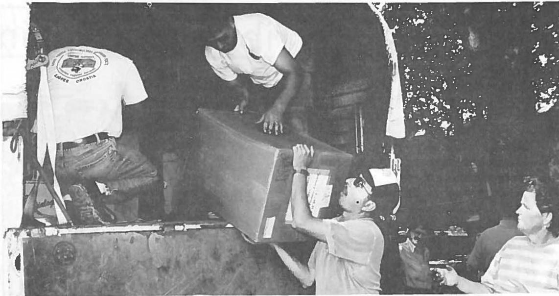
Members of the Fleet Hospital Zagreb unload our boxes.

In July Chaplain Diaz put out the call for us to donate clothes, shoes, and toys to be sent to Bosnia/Groatia. Members of the Fleet Hospital at Zagreb wanted to help the refugees in that area who had lost all of their possessions. The Chaplain's Office at Zagreb contacted Chaplain Diaz who put out the word to NHO staff. As a result of Chaplain Diaz's request, 2 bundles of shoes, 16 bundles of clothes, 1 bundle of sugar, and 8 bundles of toys were shipped. For the staff of the Fleet Hospital, 216 cards and letters were also sent.