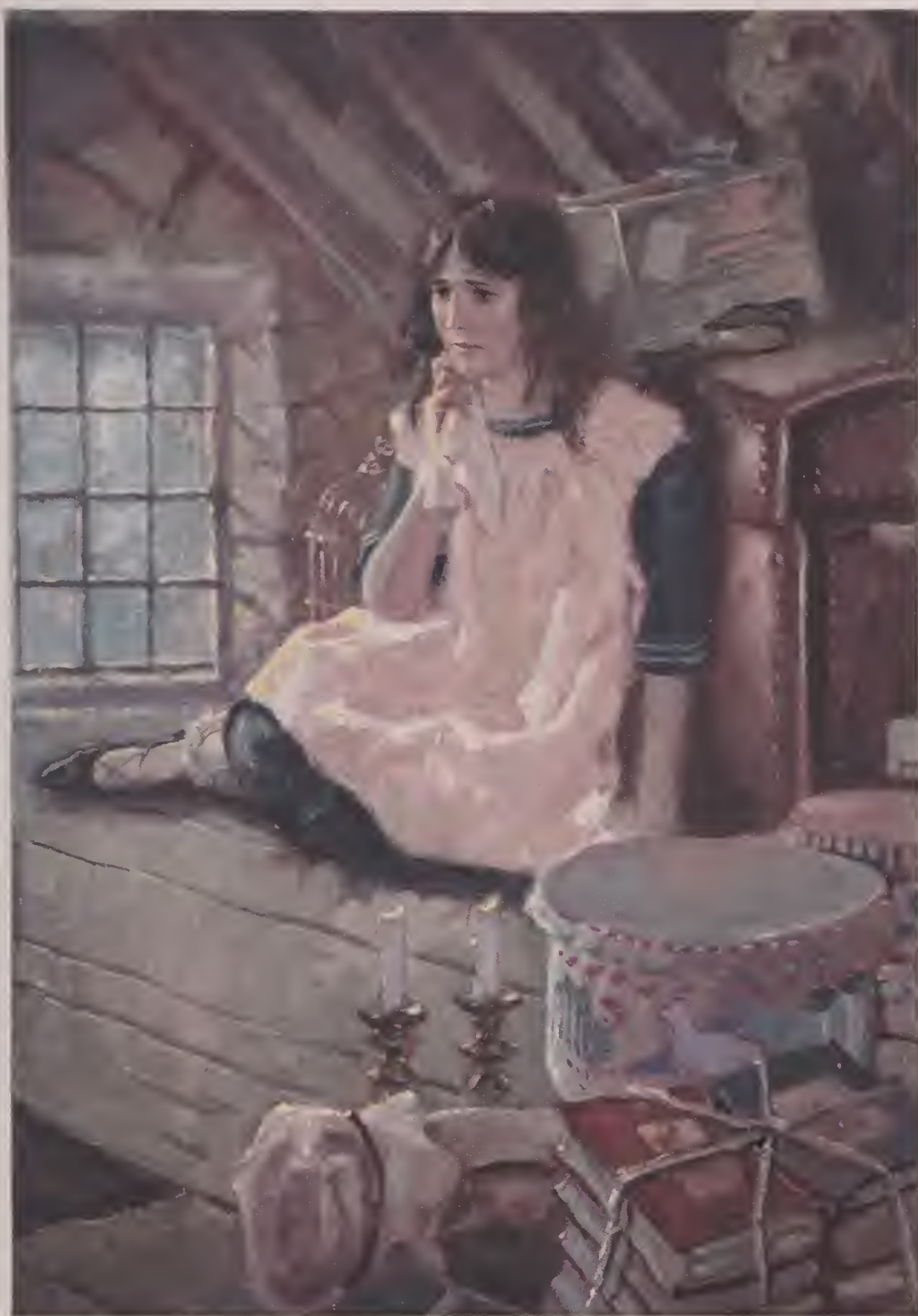
Katy rushed off to "weep a little weep," all by herself. Page 139.