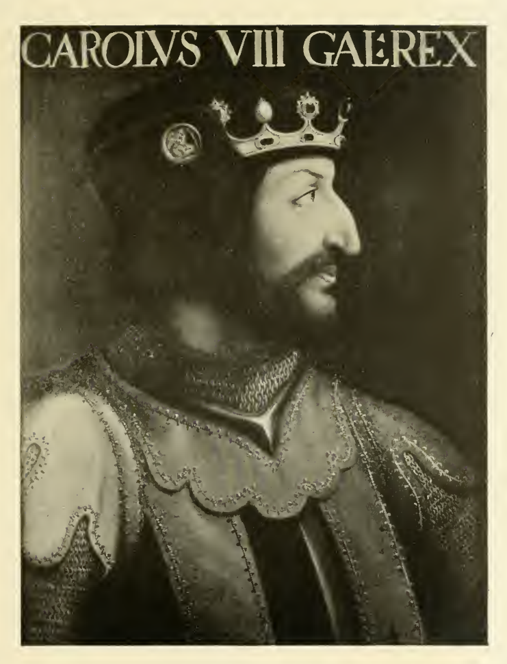
CHARLES VIII OF FRANCE In the Uffizi, Florence, Painter unknown