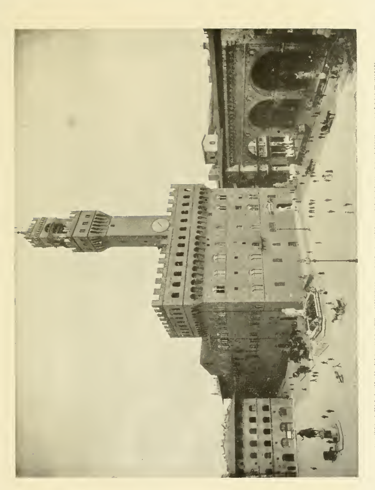
PIAZZA BELLA MGNORIA, PALAZZO VFCCHIO, AND LOGGIA DEL LANZI, FLORENGE, PRESENT TIME