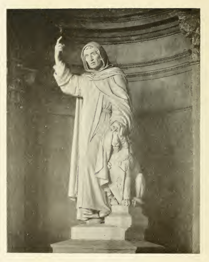
SAVONAROLA Statue by Pazzi in the Palazzo Vecchie, Florence