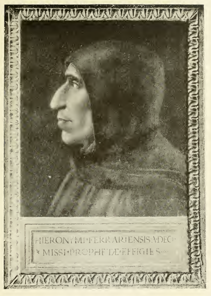
SAVONAROLA, BY FRA BARTOLOMMEO In the Museum of S. Marco, Florence