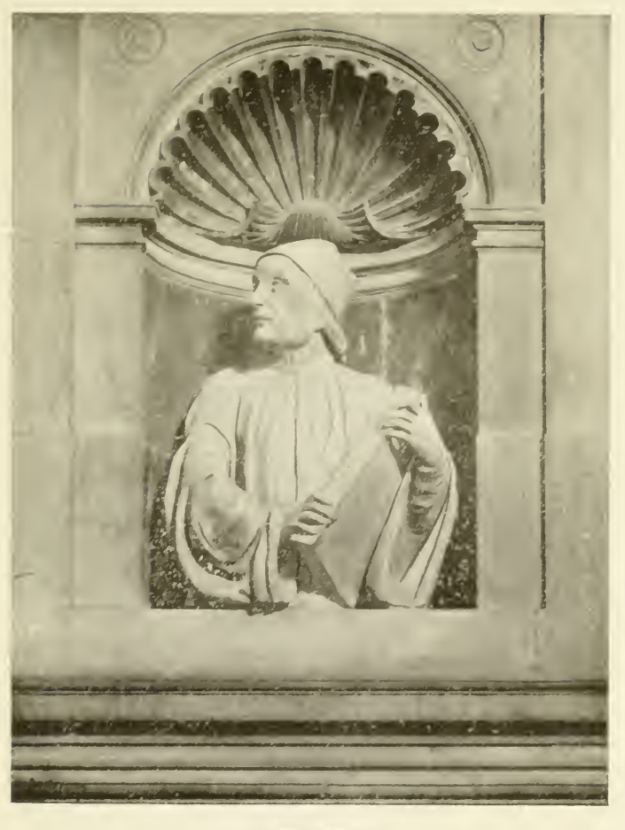
In tell one horans