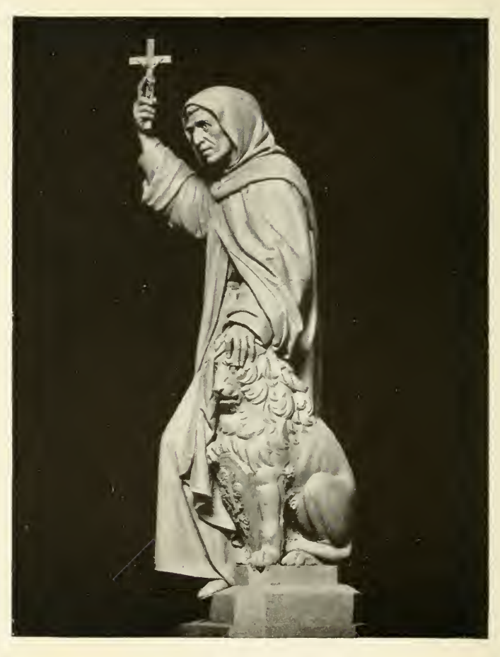
SAVONAROLA—PROFILE Statue by Pazzi in the Palazzo Verchio, Florence