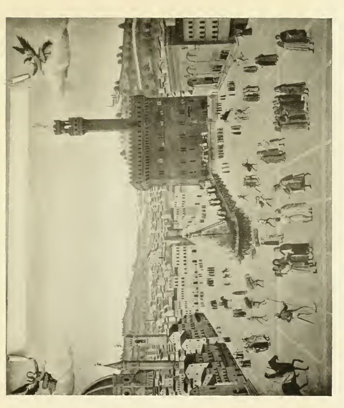
THE PIAZZA SIGNORIA, SHOWING THE ENECUTION OF SAVONAROLA. Painter highway. ALT Cento y.