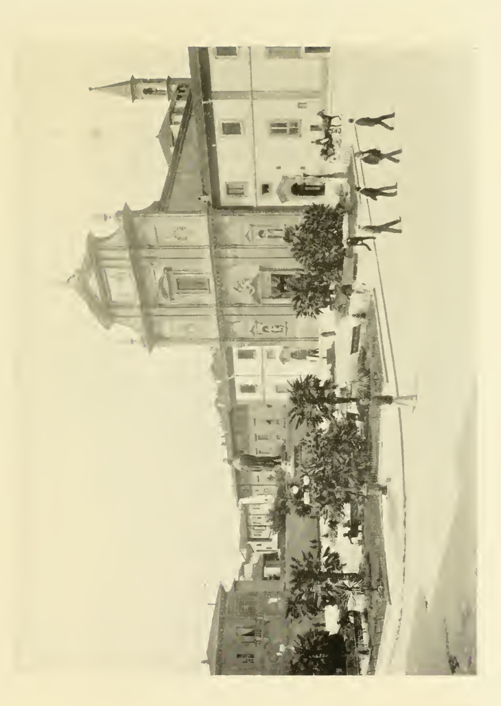
CONVENT OF S. MARCO, FLORENCE, THE PIAZZA AND THE CHURCH