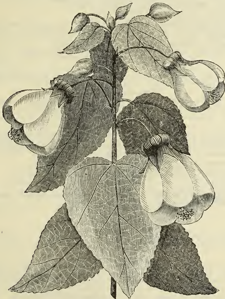
ABUTILON BOULE DE NIEGE.

This variety is a great improvement on the old white, being compact in habit, smaller in foliage, and an abundant bloomer; well adapted for culture in the parlor or greenhouse, flowering freely all winter, and admirable for cutting for bouquets. Price, 30c. each; $3.00 per dozen.