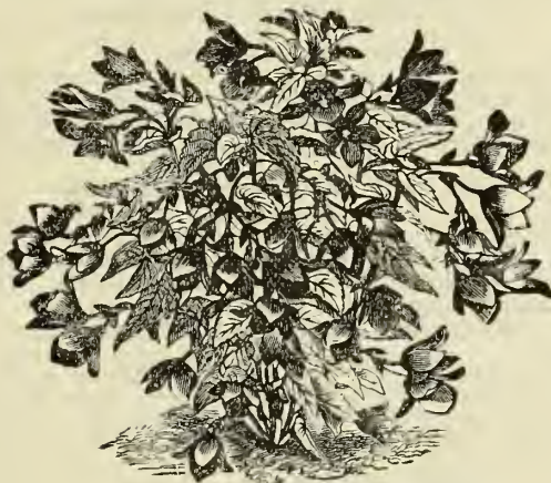
NEW TUBEROUS-ROOTED BEGONIA.