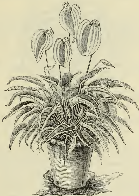
ANTHURIUM SCHERZERIANUM. (See page 16.)