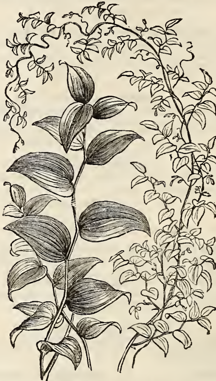
MYRSIPHYLLUM, OR SMILAX.

Price, 20c. each; $2.00 per dozen; $8.00 per 100.