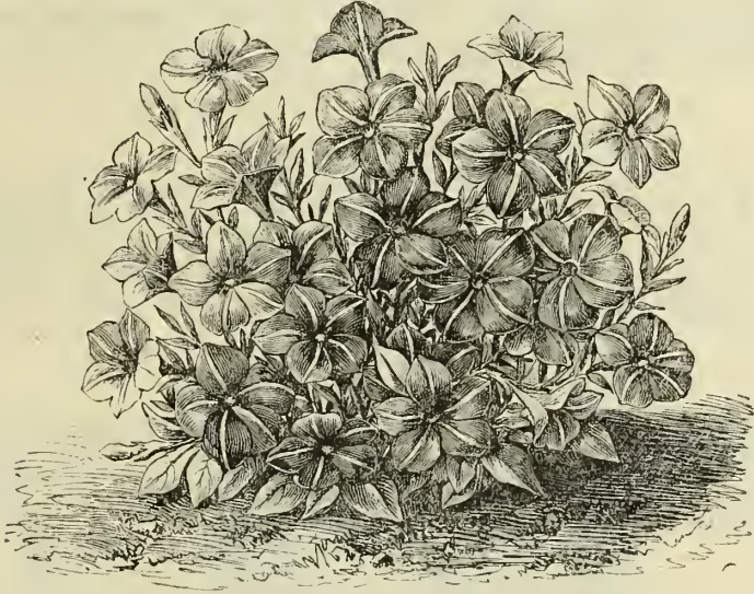
PETUNIA HYBRIDA NANA COMPACTA MULTIFLORA.

Seeds, 50c. per packet. Price of plants, 30c. each.