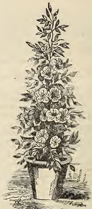
AZALEA. (See page 61.)

Price, $1.00 each; $6.00 to $9.00 per doz. Large plants, $12.00, $18.00, and $24.00 per dozen.