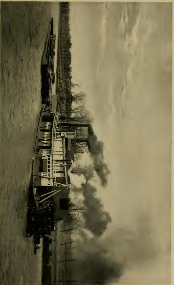
MARKETING RAILWAY TIES