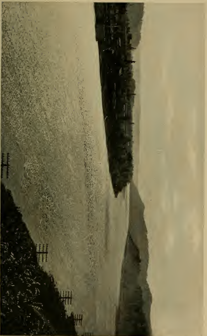
THE RIVER TROUGH