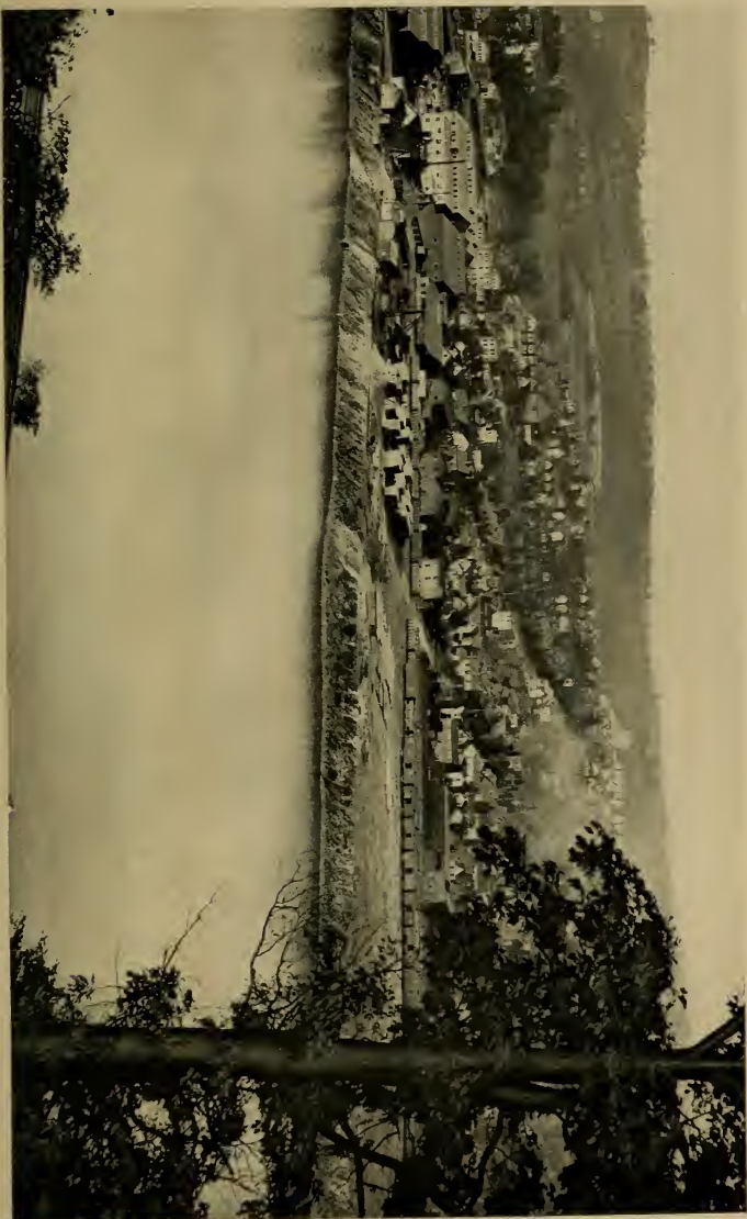
THE MONONGAHELA AT BRADDOCK