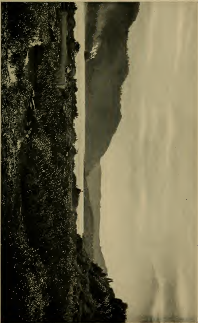
“THE CONTOUR OF THE RUGGED HILLS”