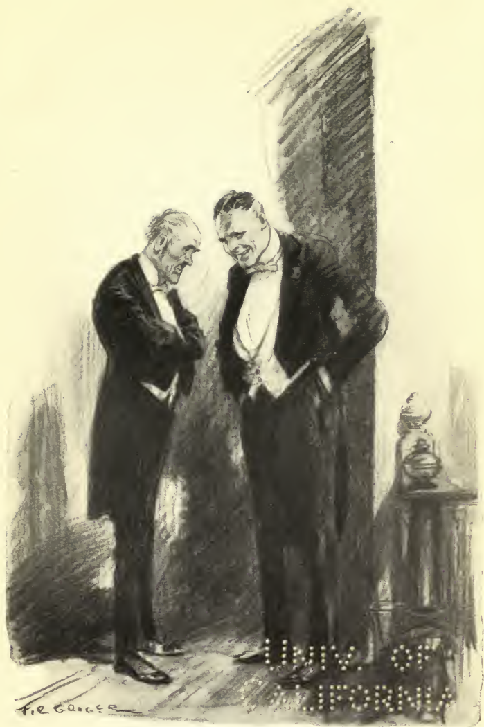
THEY DID NOT SPEAK UNTIL THEY REACHED A DESERTED CORNER OF THE HOTEL LOBBY