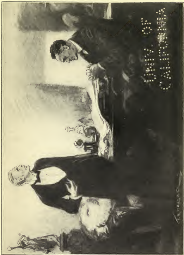
CARSTAIRS SPRANG TO HIS FEET. FOR AN INSTANT A FLASH OF JOY TRANSFIGURED HIS FACE