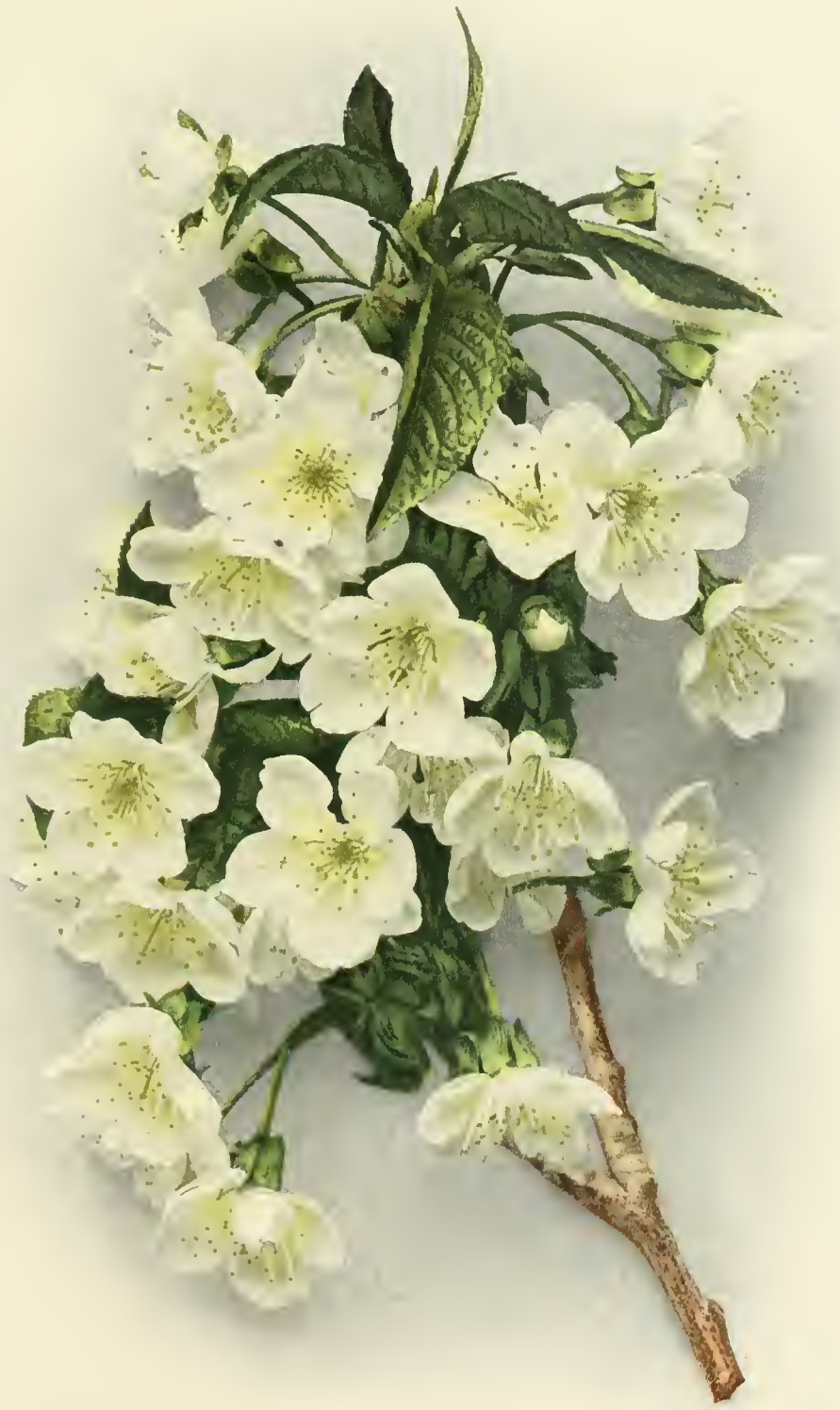
PRUNUS AVIUM X PRUNUS CERASUS (REINE HORTENSE)