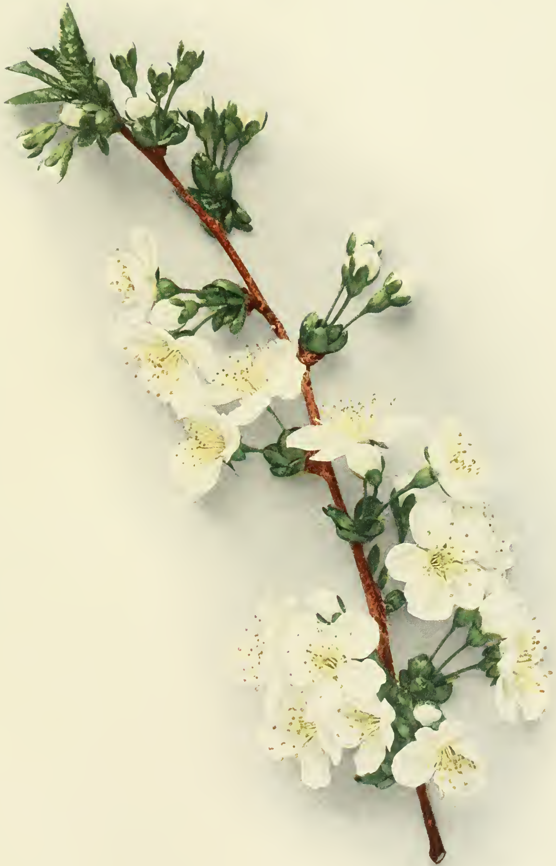
PRUNUS CERASUS (MORELLO GROUP)