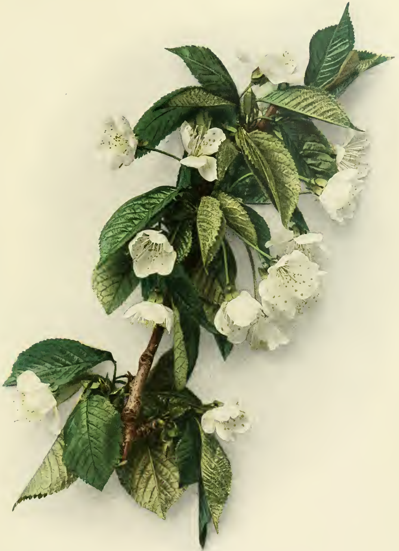
PRUNUS AVIUM (MAZZARD)