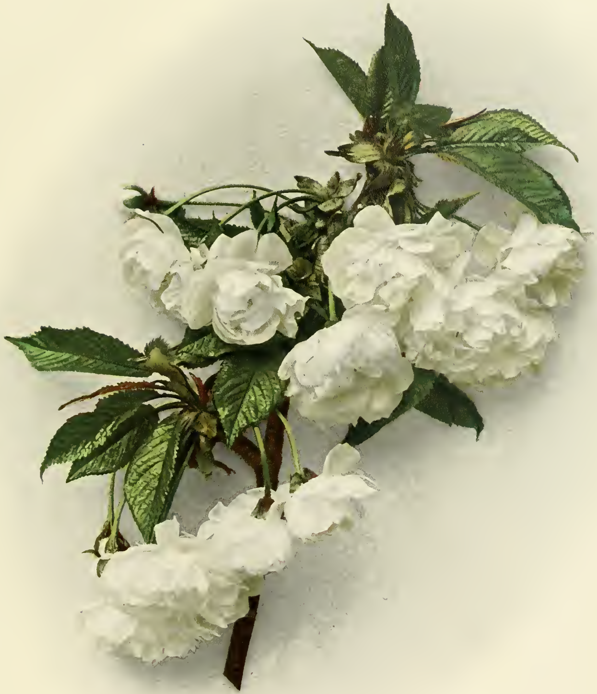
PRUNUS ALIUM (DOUBLE FLOWERING)