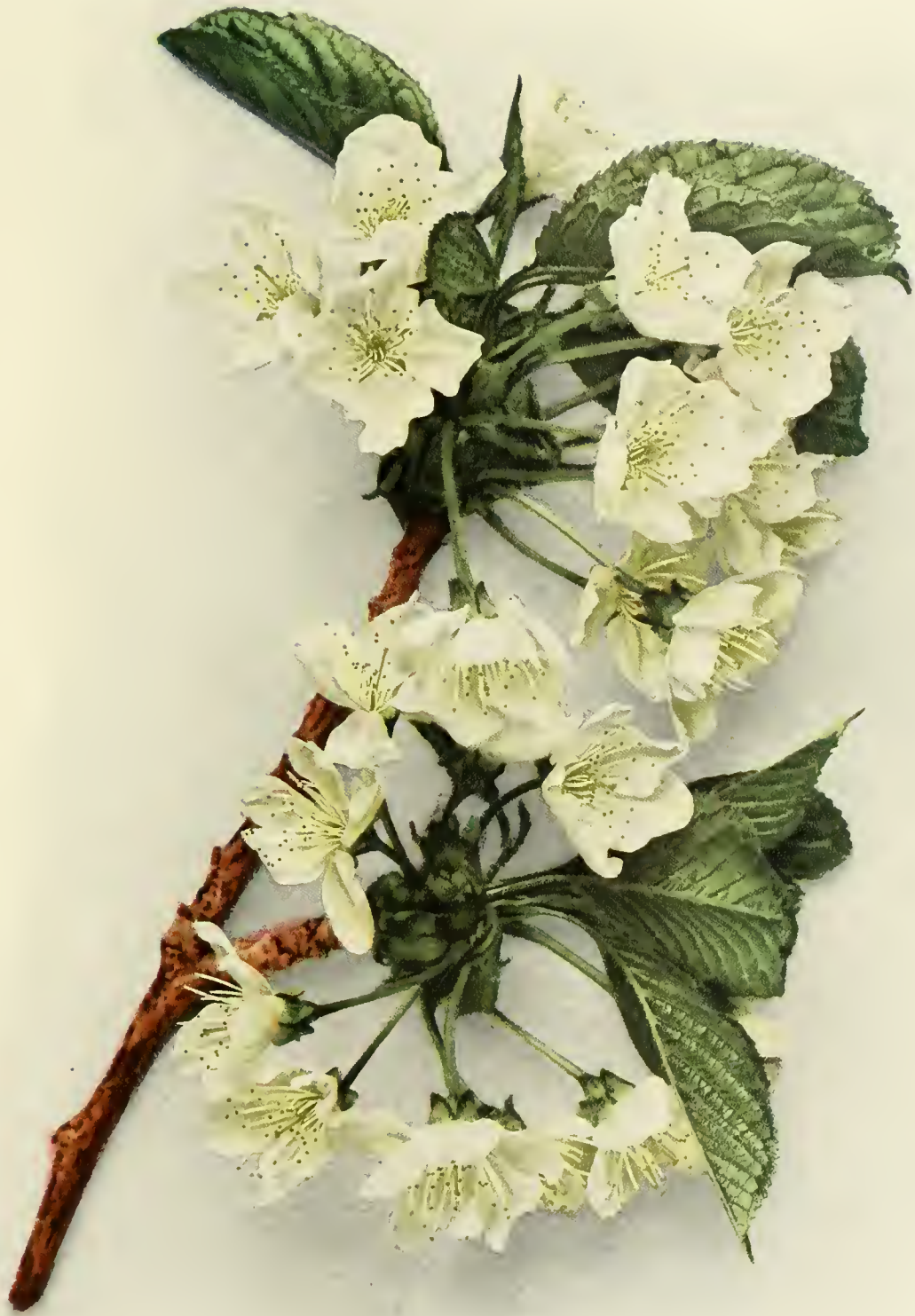
PRUNUS AVIUM (YELLOW SPANISH)