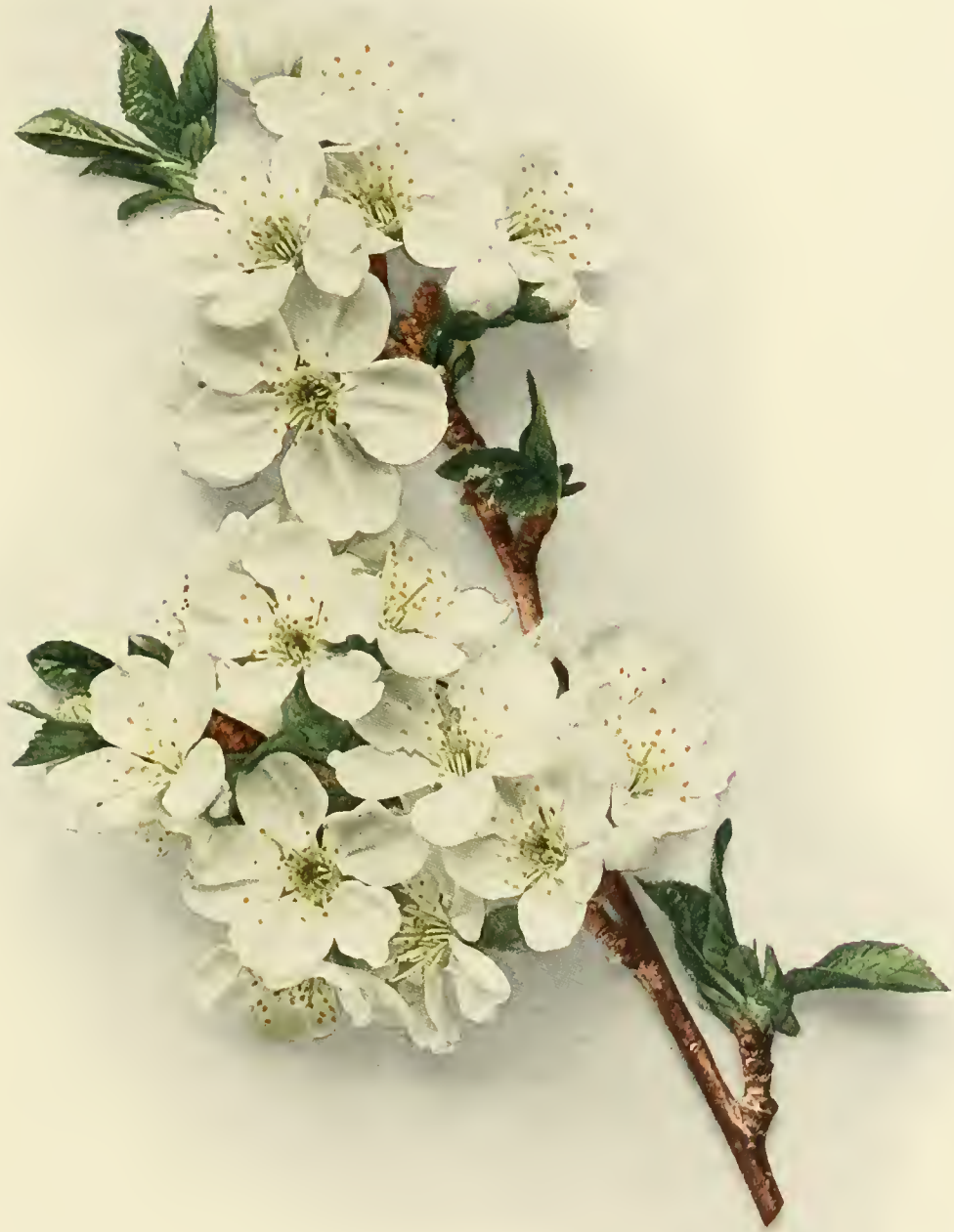
PRUNUS CERASUS (AMARELLE GROUP)