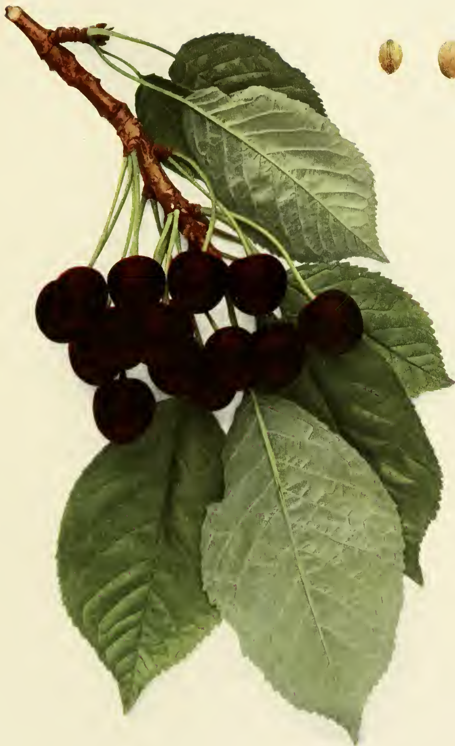
PRUNUS AVIUM (MAZZARD)