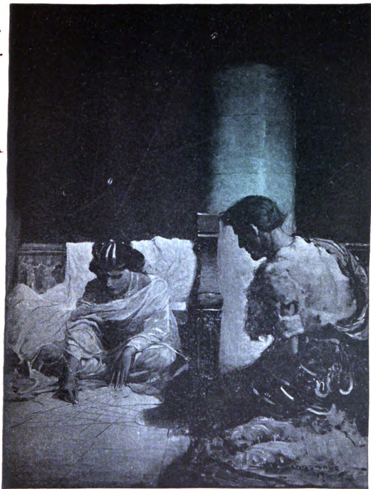
SHE DREW UPON THE MARBLE FLOOR THE FIRST MAP OF THE BARSOOMIAN TERRITORY I HAD EVER SEEN. Page 178