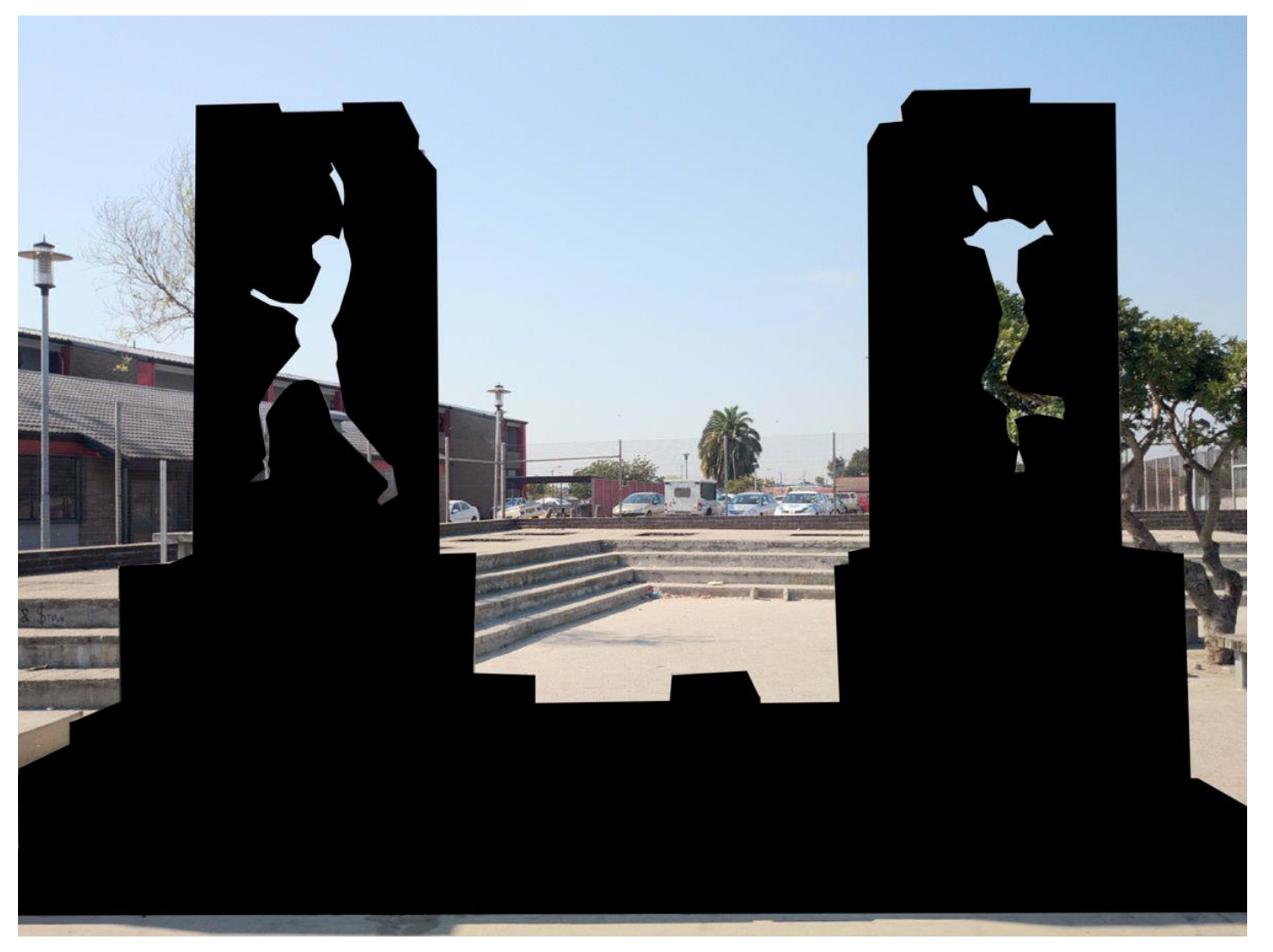
"Two Statues Gugulethu Seven Memorial" by Nkansahrexford (CC-BY-SA) - https://commons.wikimedia.org/wiki/File:Two_Statues_Gugulethu_Seven_Memorial.jpg