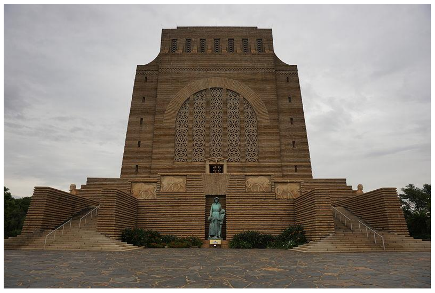
"The Voortrekker Monument main entrance" by Byrontaylor86 (CC-BY-SA) - https://commons.wikimedia.org/wiki/File:The_Voortrekker_Monument_main_entrance.JPG