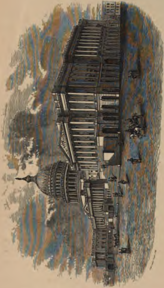
NEW CAPITOL, WASHINGTON.