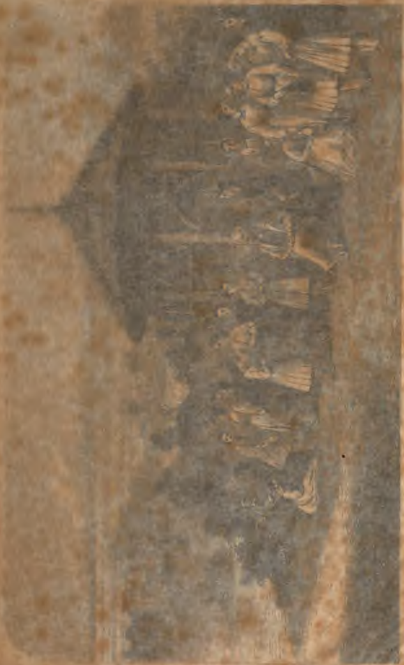
OTHER COMMUNITIES - BROTHER AND FAMILY