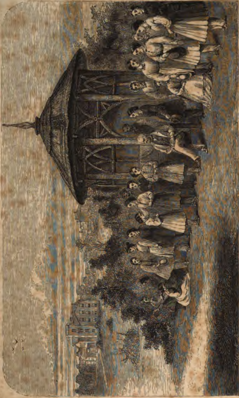
BIBLE COMMUNISTS — PROPHECY AND FAMILY.