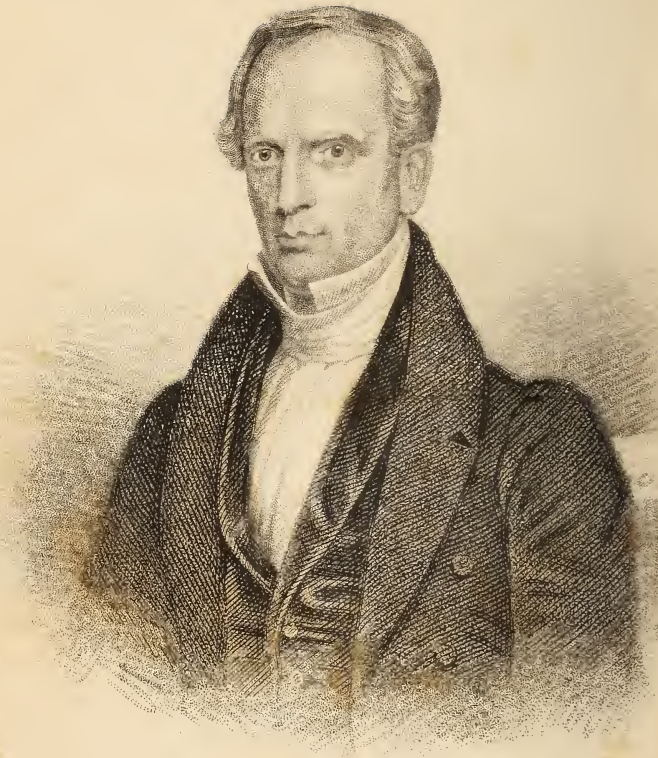
REV. CHARLES G. FINNEY.