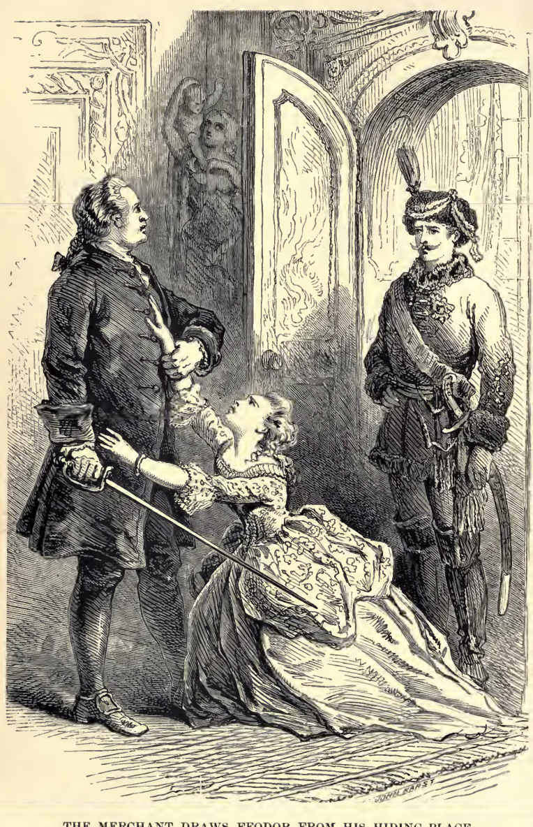
THE MERCHANT DRAWS FEODOR FROM HIS HIDING-PLACE.