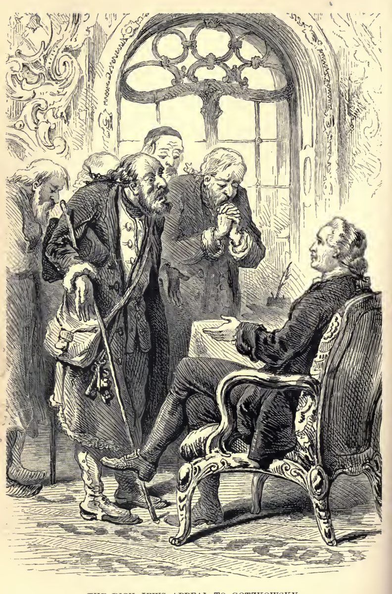
THE RICH JEWS APPEAL TO GOTZKOWSKY.