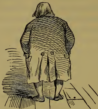
Geoffrey Crayon. Del.

that he had nearly lost the use of his legs for a few years past. His dwelling was a cottage, looking out upon the Avon and its bordering meadows; and was a picture of