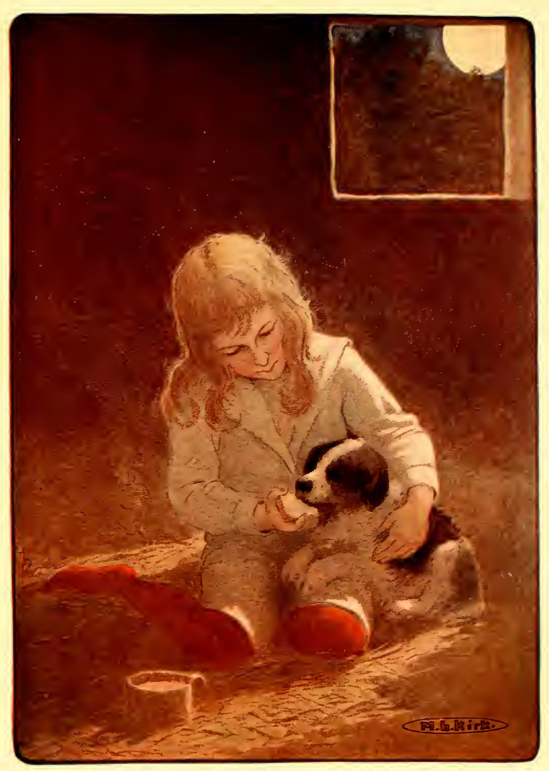
HE SHARED IT WILLINGLY