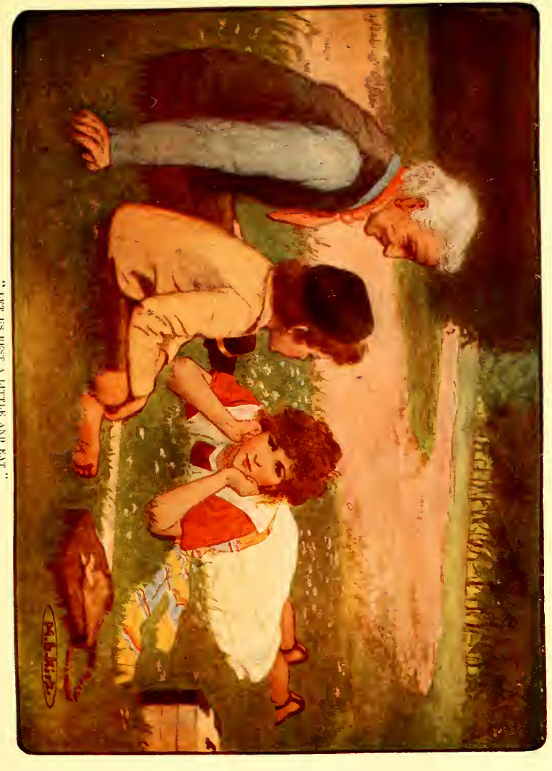
" LET US REST A LITTLE AND EAT"