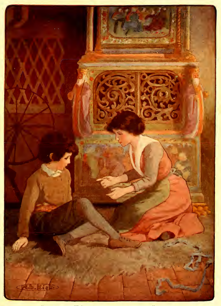
"IT IS A SIN, IT IS A THEFT, IT IS AN INFAMY." HE SAID