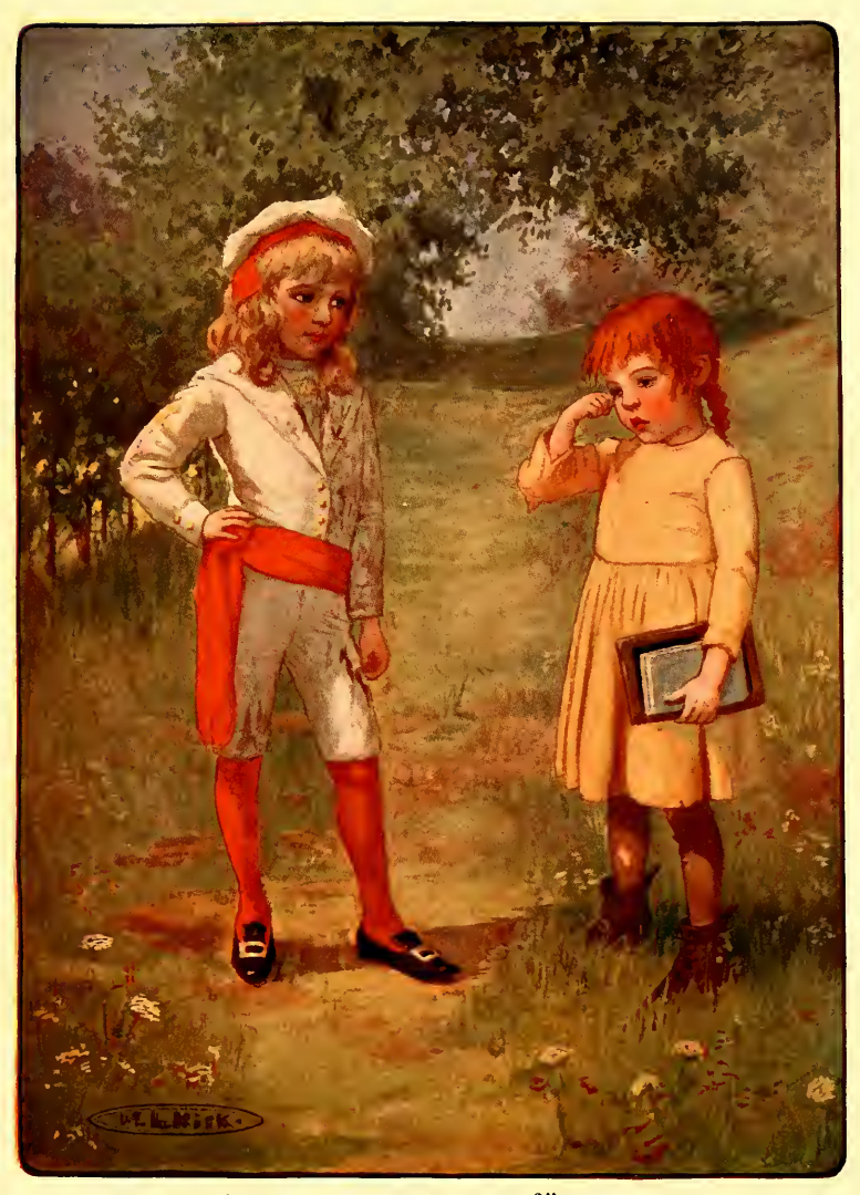
"LITTLE GIRL, WHY DO YOU CRY?" HE SAID