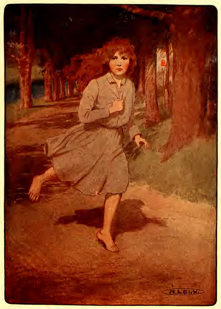
SHE ONLY RAN ON, STUMBLING OFTEN, AND FEELING FOR THE MATCHES IN THE BOSOM OF HER UGLY GRAY COTTON FROCK