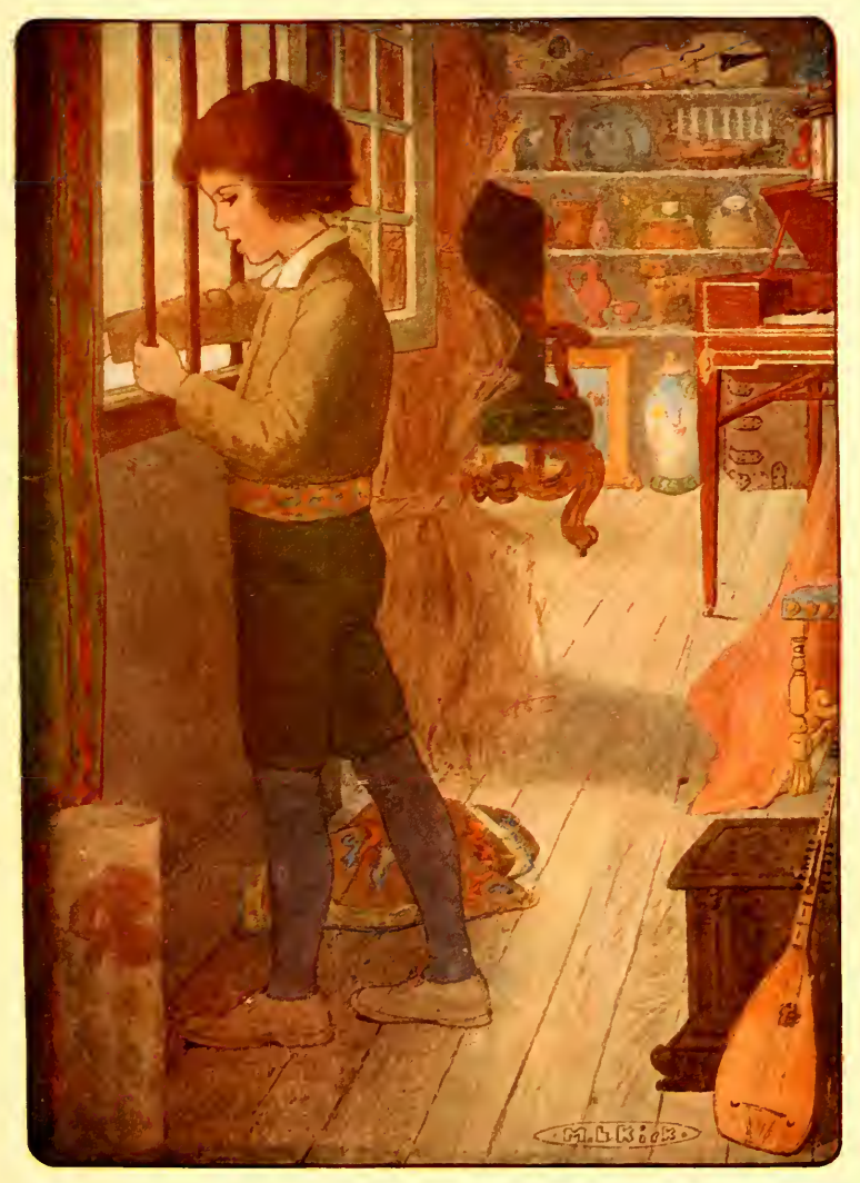
AUGUST OPENED THE WINDOW, CRAMMED THE SNOW INTO HIS MOUTH AGAIN AND AGAIN