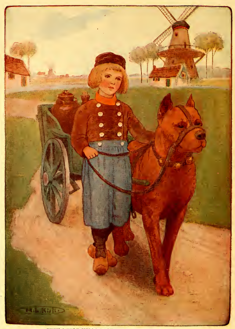
THEN LITTLE NELLO TOOK HIS PLACE BESIDE THE CART