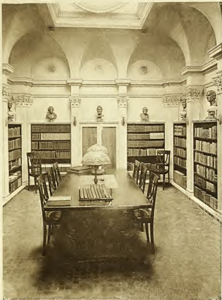
The Eastman Reference Library