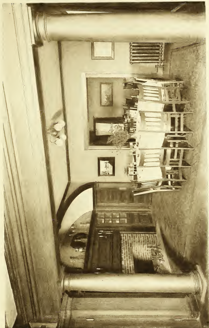
The Dining Room at Beaulieu, France