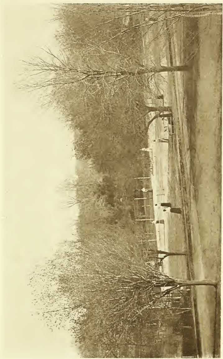
The Tennis Courts