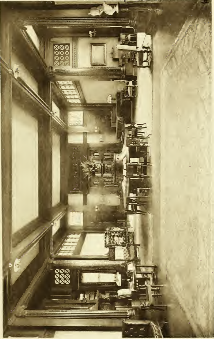
The Library Room