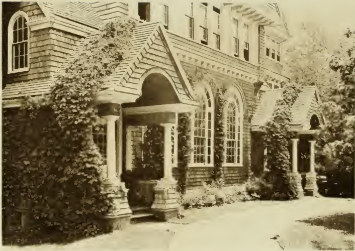
The School Building