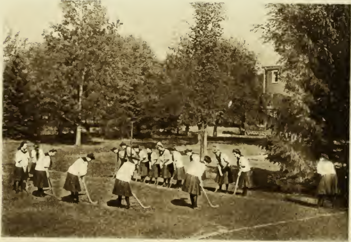
A Game of Hockey

The Graduate Department of Dana Hall was opened in the autumn of 1911 in the interest of our own graduates who were not anticipating a College Course. The steady growth and development of