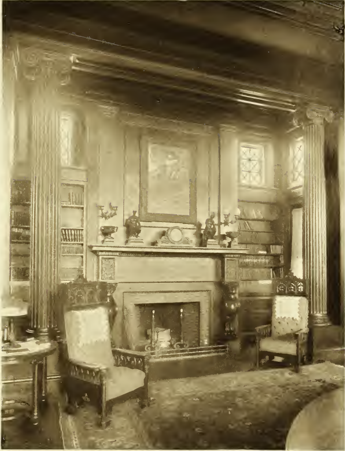
Fire place in the Living Room