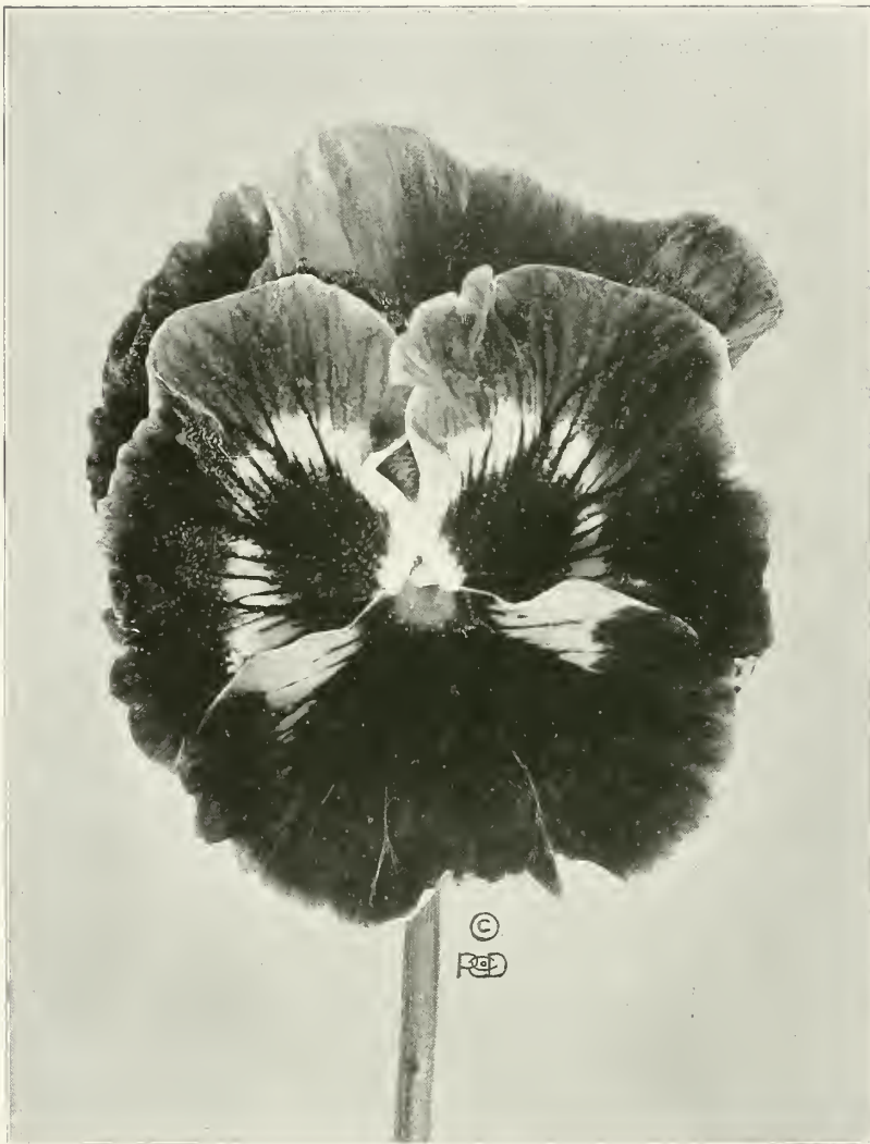
PANSY "DIENER'S GIGANTEUM"