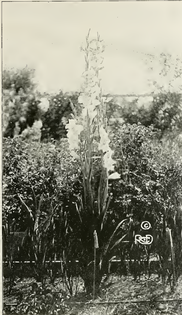
No. 165—“DR. FREDERICK T. V. SCIFF” The plant in the middle foreground is the growth from one bulb. There were three main shoots, each carrying two side shoots, which produced 127 perfect six-inch flowers.