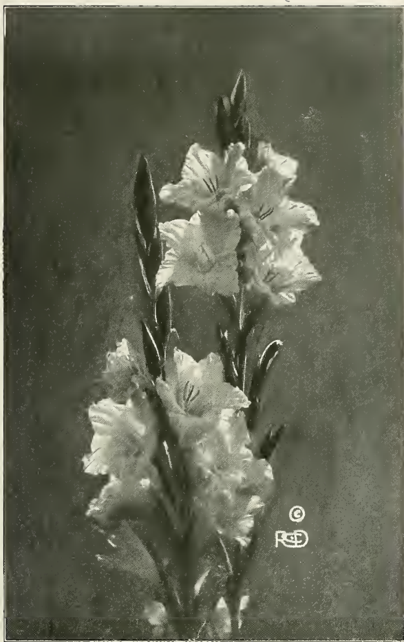
No. 136—"ADALINE KENT"