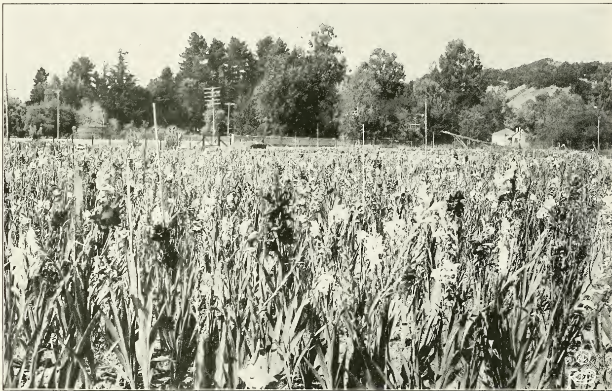
Gladiolus — Over Fifty Thousand 1916 Seedlings