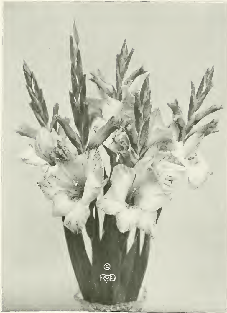
No. 1—"MRS. WILLIAM KENT" The flowers here shown are produced from corms or bulblets, five months after planting.