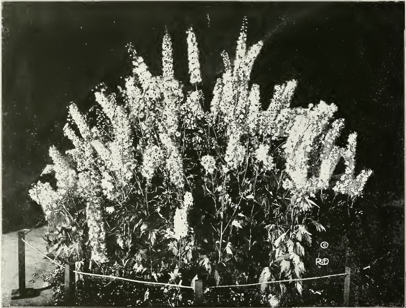
Delphinium — Vanderbilt's Hybrids