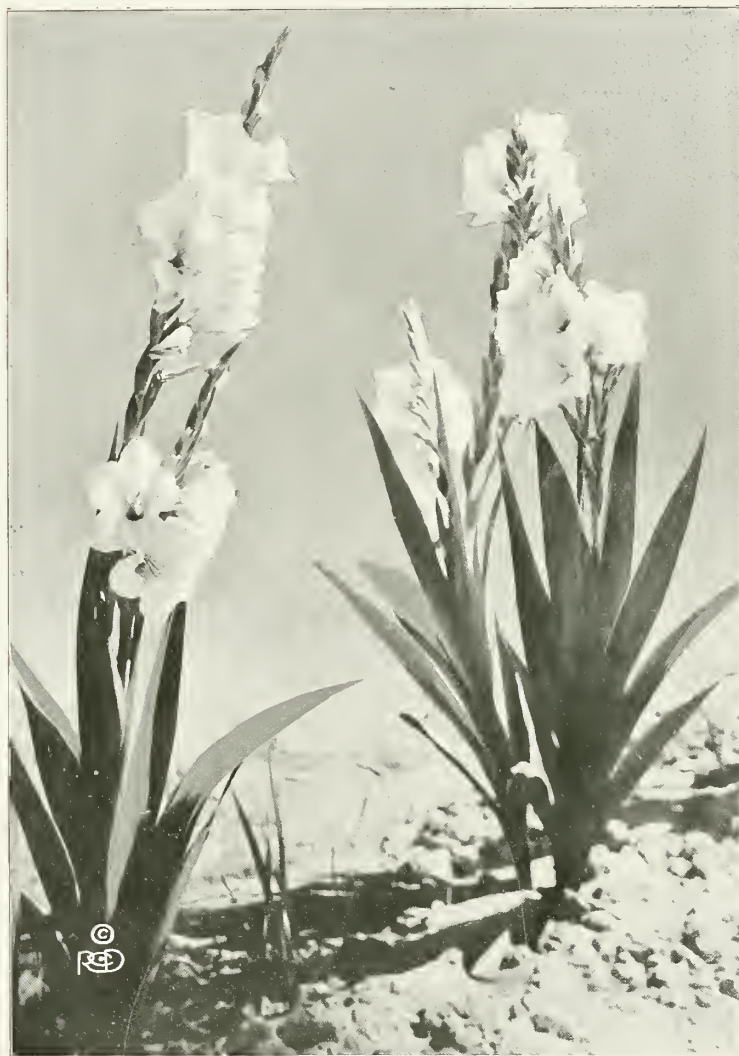
No. 206—"WILLIAM KENT"

The flowers above are on side shoots only, the main shoots having been used for exhibition purposes before the picture was taken.