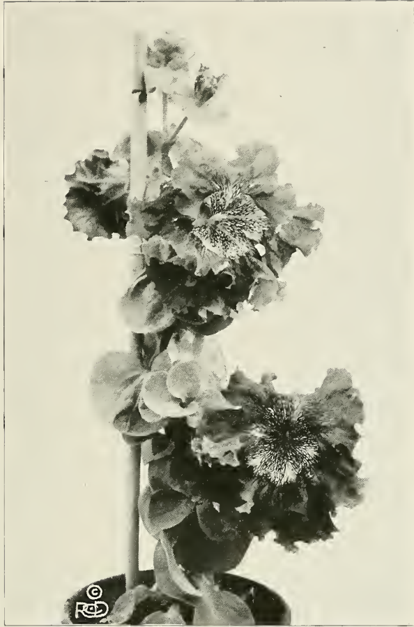
PETUNIAS "DIENER'S RUFFLED MONSTERS"