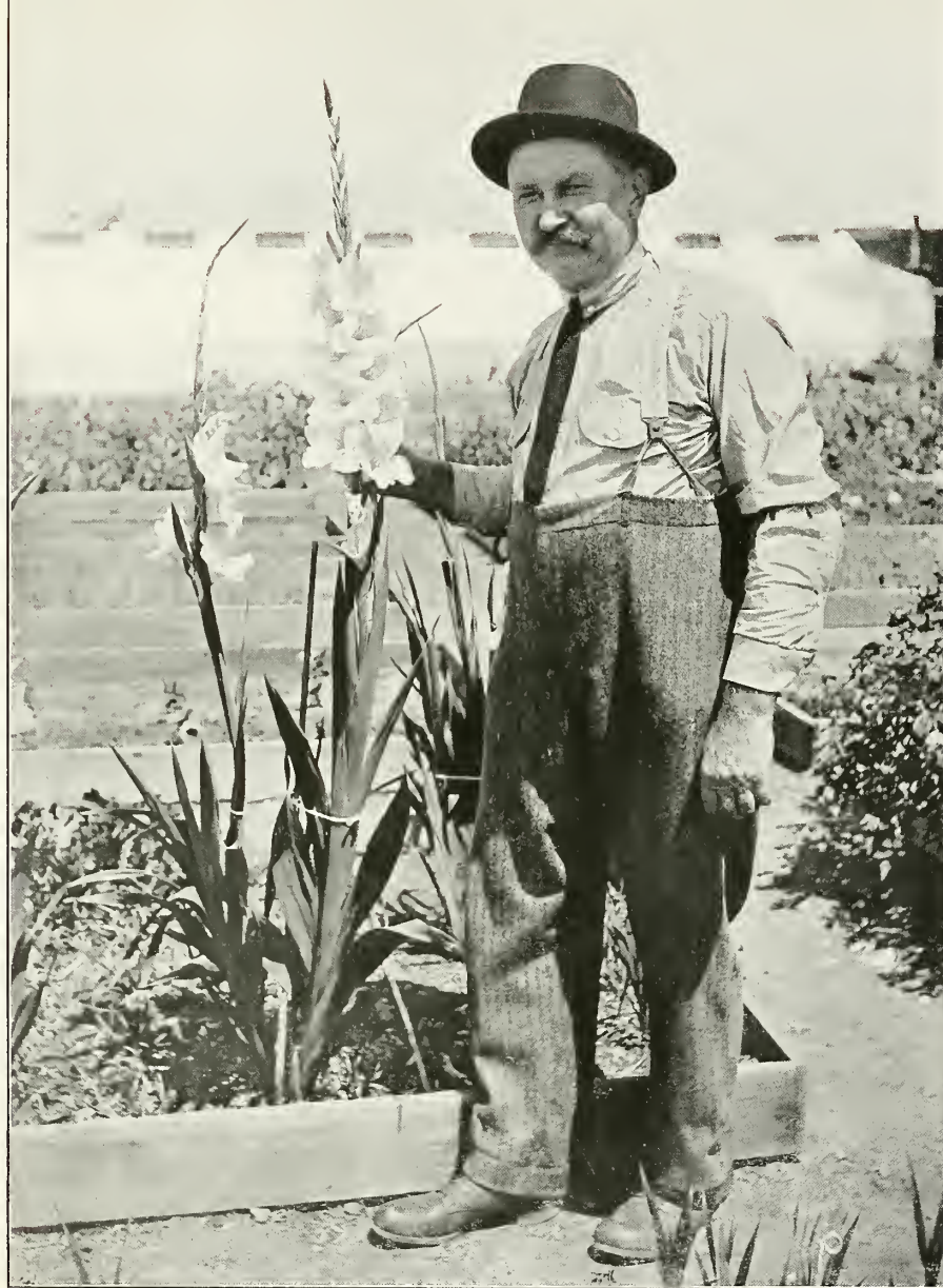
No. 166—"DIENER'S WHITE"