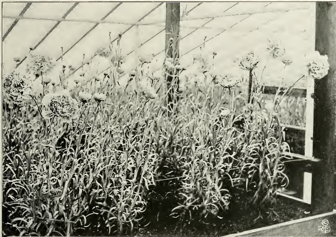
CARNATION “RICHARD DIENER” Showing habit of growth on the bench.

We Guarantee safe shipment of these Carnations all over the United States and Canada.