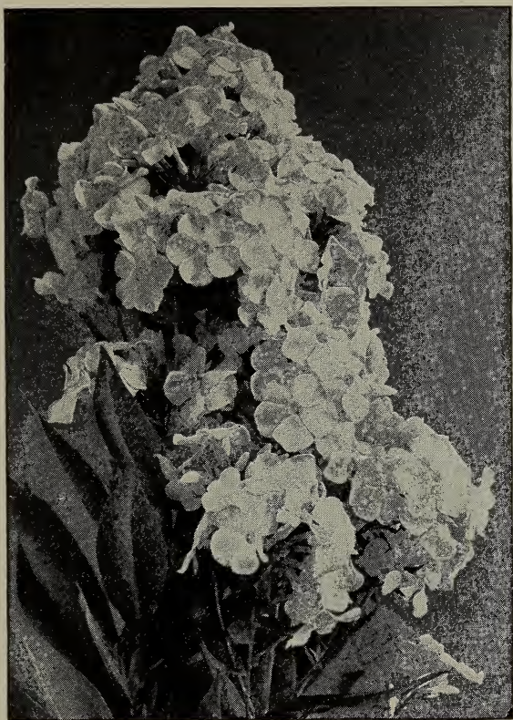
Phlox decussata , Mrs. Jenkins

Our Plant-Tubs, Window-Boxes and Garden Furniture are made with two aims in view—to last longer and to be more shapely than any others. In order to accomplish this, we use only heart cypress wood, which is close-grained, does not warp, shrink, twist or swell, and being naturally oily, can be painted without a “filler” or covered to imitate sandstone.