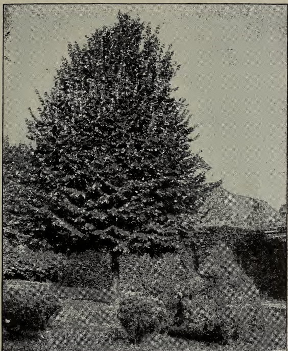
Tilia argentea (see page 10)