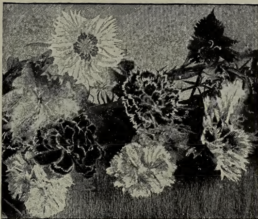
Flowers of Hardy Pinks