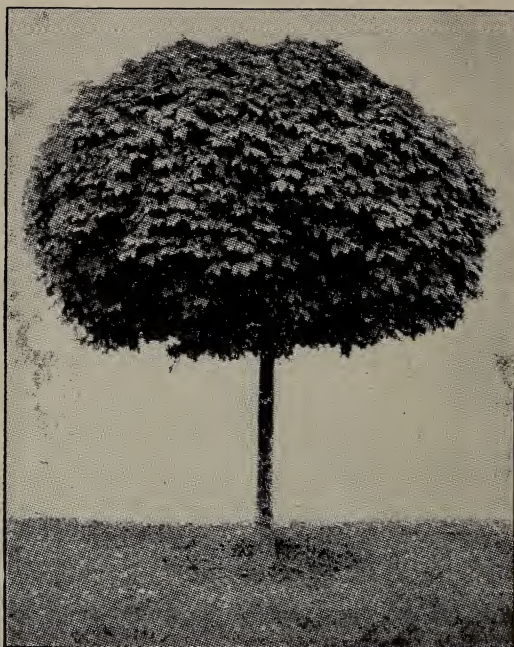
Acer platanoides globosum . 10-year head