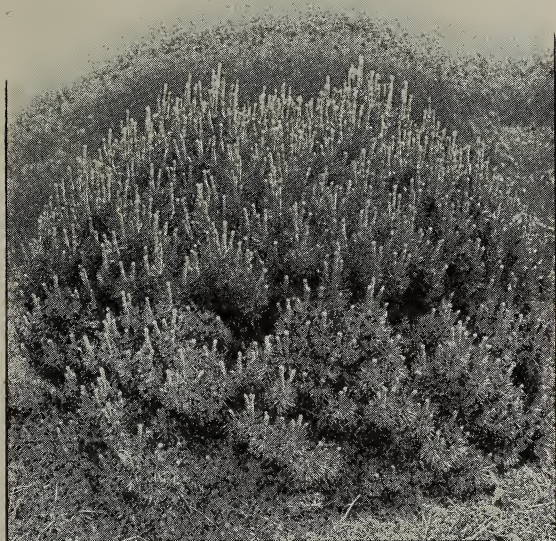
Pinus montana Mughus