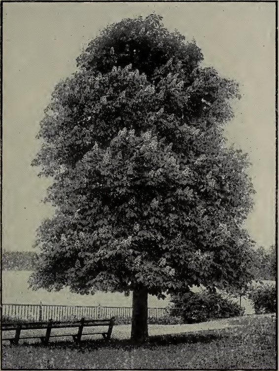
Æsculus Hippocastanum (see page 10)