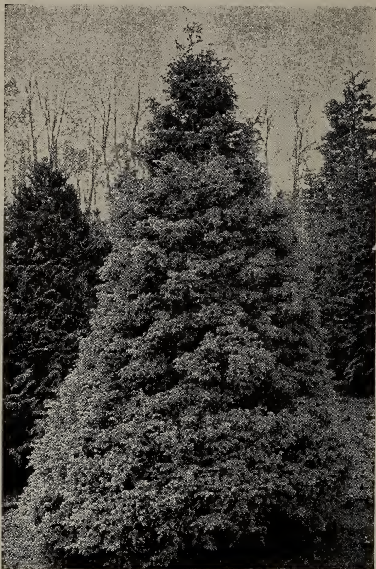
Retinospora squarrosa Veitchii (see page 6)