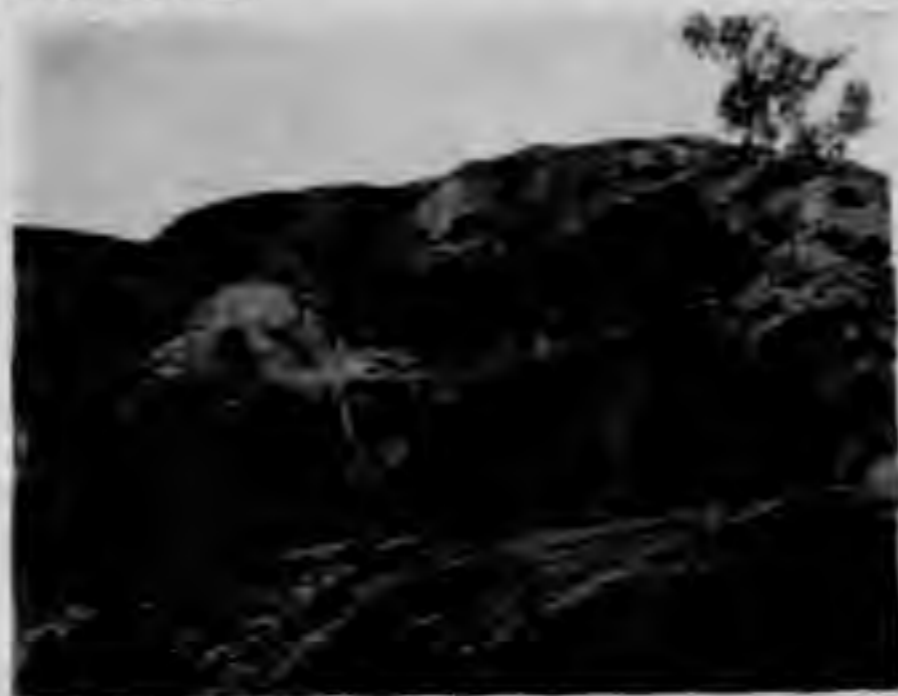
二四九 石佛庵石佛 (二)

This temple, originally called Chuang-hua Shen-yuan, was built in the Yung-lo period (1403-1424). It possesses over ten Buddha caves, which look almost like those in Chi-hsia Shan.