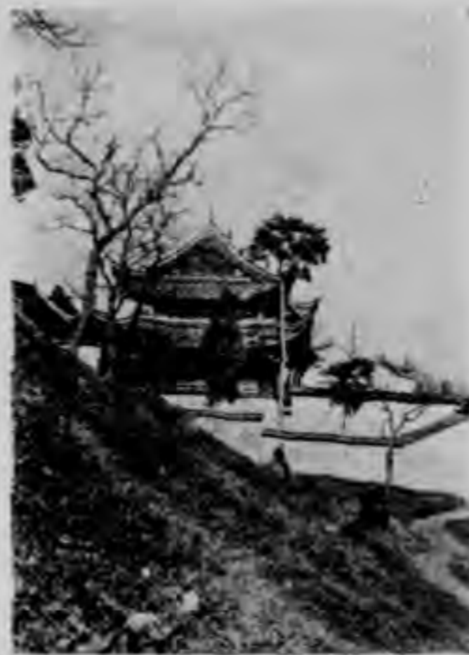
二七八 采石磯太白樓 (三)