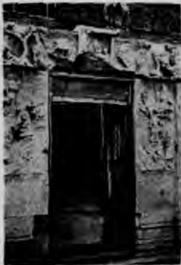
一五四 宋聚村明代之浮雕 (二)

Between the Sheng-hang Ching and the Chen-hua Ching is a small village, called Song-ssu Ching, which has three villas, each of which has gates with marble reliefs on them, either of chi-lings, the dragon, the phoenix, or else of scenes depicting Taoist life.