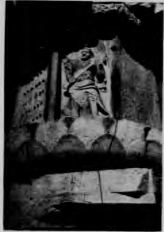
二二九 四天王 (二)

228. One of the Four Celestial Kings (1). See above (227).