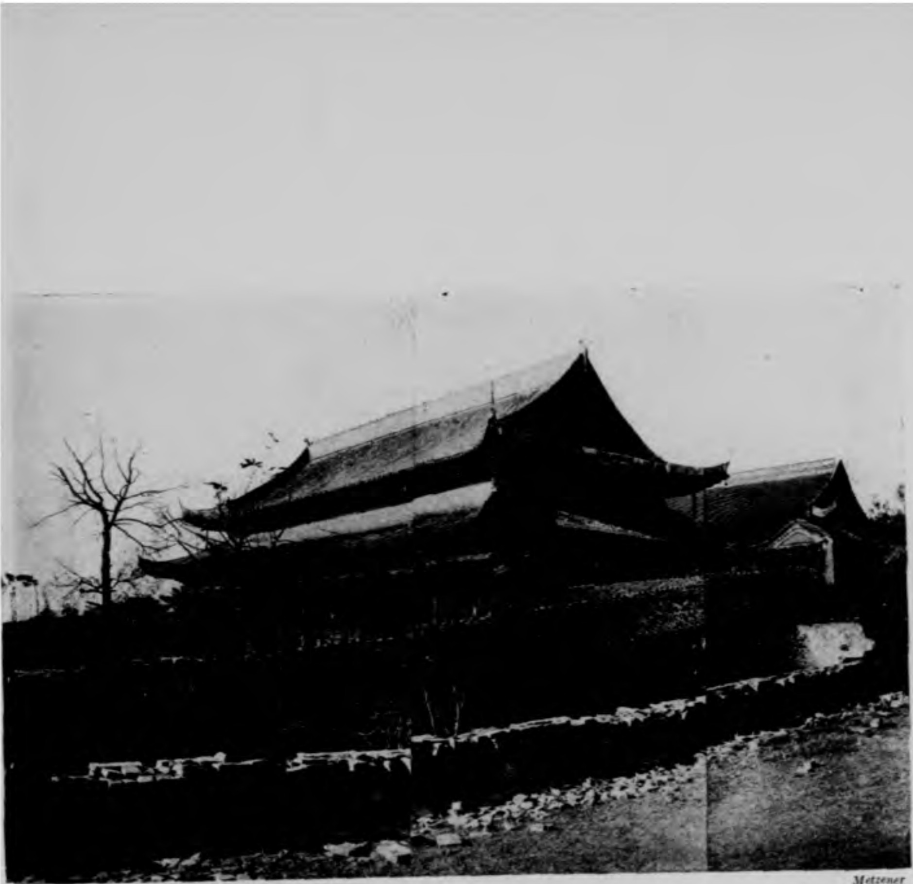
一二七 朝天宮全景 (二)