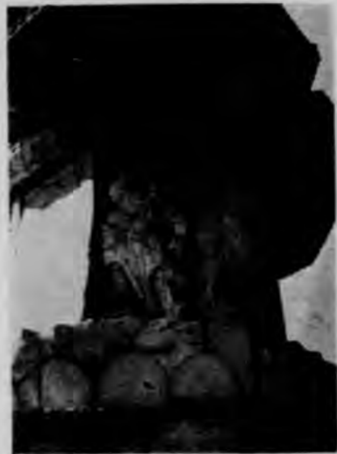
二三一 四天王 (四)

230. One of the Four Celestial Kings (3). See above (227).