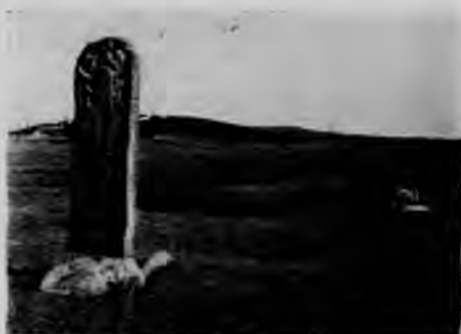
一〇五 明景泰副都御史 宋公墓全景

Chou Hsüen was minister of Justice in the Cheng-tung period (1426-1449). His tomb is situated in Hsü-chia Yu-fang, outside the South Gate. It is typical of tombs during the fifteenth century.