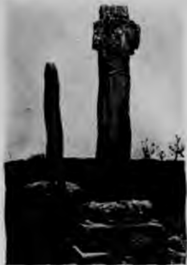
一七 梁安成康王蕭秀墓闕及碑 碑見前。墓闕石壁，雕刻作二飛龍(有翼)狀，頗為精美。