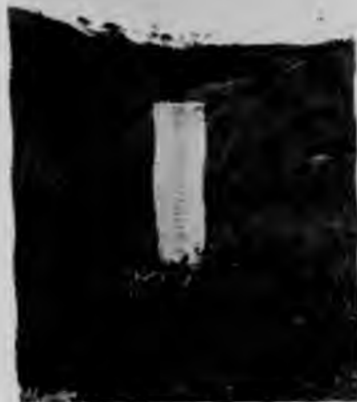
二〇 晉溫嶠墓 墓在壽府山西，相傳為溫嶠墓，實則溫嶠葬於金陵，惟墓有古碑，係六朝時墓無疑。

This unknown tomb is situated in the village Chang-chia Ku, northwestern of Chi-hsin Shan. One observes the wide distance between the two animals, which are half sunk in the earth.