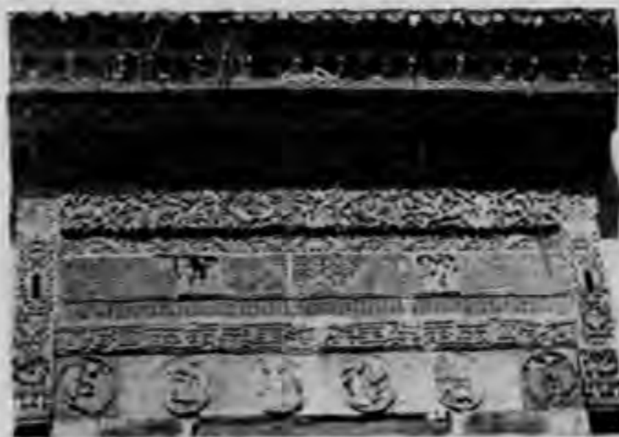
一五五 宋聚村明代之浮雕 (三)