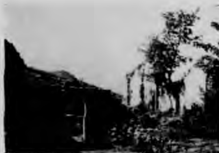
二五一 巖山靜明寺故址 寺在山西坡上，頗多古林，景至幽邃，固有明兩 家侯毛元墓(圖一一〇)。

Yen Shan is a group of rocky hills, situated to the east of Niu-tou Shan. In its southern valley is the lonely Lung-chien Sze, which was built at the beginning of the Ming Dynasty.