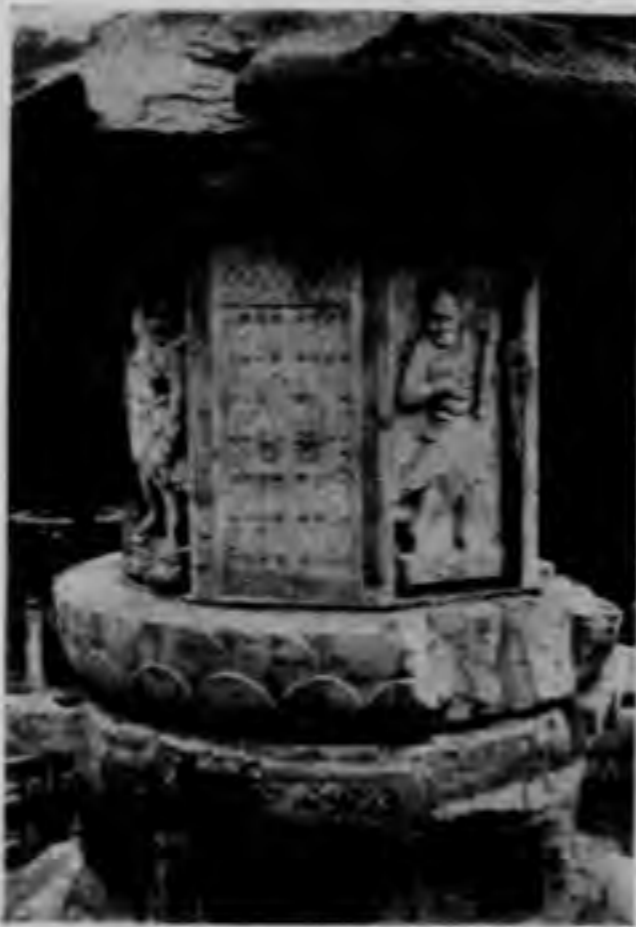
二三〇 四天王 (三)

229. One of the Four Celestial Kings (2). See above (227).