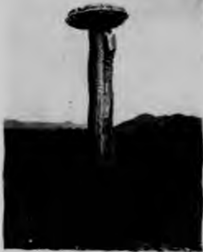
一三 淳化鎮宋墅後村 失名之墓闕