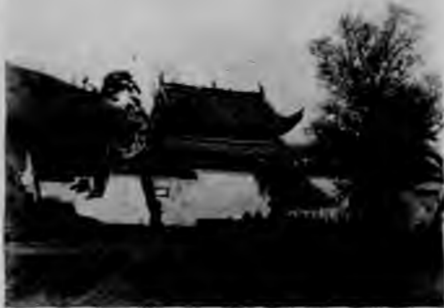
二七七 采石磯太白樓 (二)