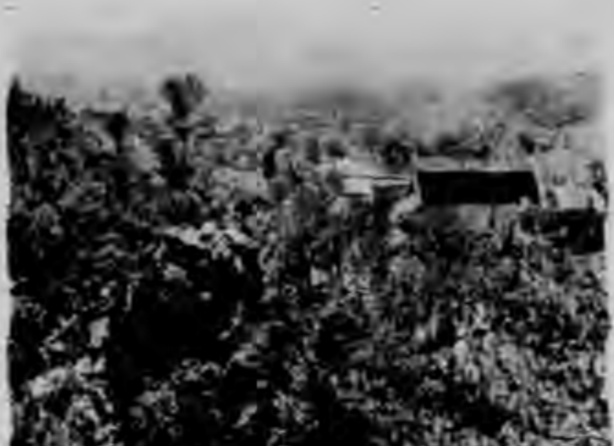
二一七 棲霞寺鳥瞰 (二)