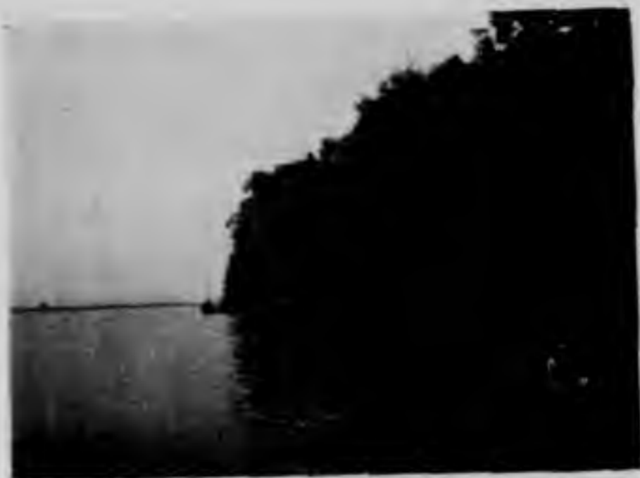
二三四 燕子磯 (一)

This cliff is situated to the west of the Chi-hsia Temple, and is composed of two rugged, perpendicular rocks.