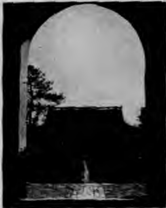
二六八 從天王殿望 無量殿

This temple is situated some 1.5 km. from the other, almost on the top of the mountain. The path leads through a thick bamboo grove; one can go on for several hours without meeting anybody.