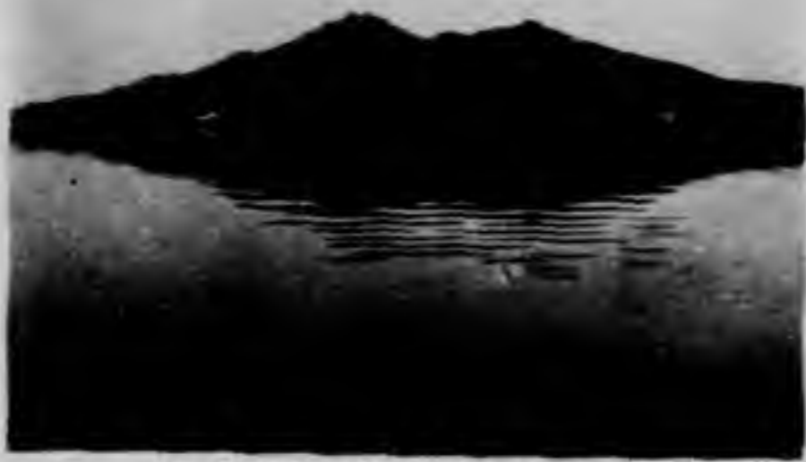
二〇四 水上鍾山 (一)

鍾山一名蔣山,又名紫金山,爲金陵鉅鎮,高達四六八.八公尺,左近諸山,除寶華山差可與之比肩外,無有及者。東連青龍山,西接青溪,南有鍾浦,下入秦淮;北接雞亭山,諸葛武侯所謂鍾山龍蟠者也。圖爲從玄武湖所攝,青山映碧,湖光滌滌,風光淨絕。