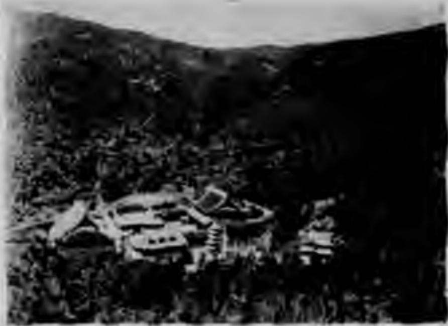
二一六 棲霞寺鳥瞰 (一)

歐西兩漢川會平改前， 曹於魏王應選太甲名 明令文安樓寺宋新佛 士新三始像於寺元子 遍加高王石帝同寺寺 年，每仲宣造文藝院院 七，功，文，家，前，後，樓，樓，到 明，仲，其，陵，等，顯，其，為，飛，相 永，子，二，竟，後，佛，南，乃，今，北 齊，之，并，王，田，千，寺，向，寺，南 山，福，佛，顯，有，成，應，諸，穴，窟，前 滿，野，宮，文，姬，汪，功，故，使，石 名，建，景，章，帝，師，尊，寺，鐘，鐘，廟 一，種，無，像，王，榮，改，聖，文，雲 山，茂，道，子，鳳，加，祖，善，寺，與 區，建，魏，太，江，復，高，麗，羅，疏，與 樓，為，聖，泰，宋，王，濟，中，崇，善 在，宅，石，文，及，金，塔，國，因，轉 寺，寺，寺，寺，寺，寺，寺，寺，寺，寺，寺