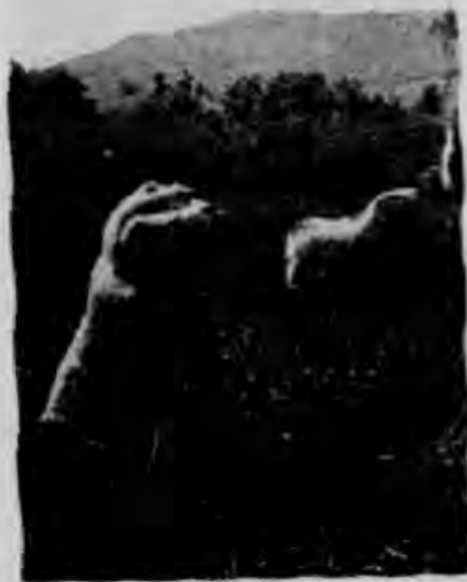
二八 幕府山失名 之古墓(二)

The tomb is situated in Chuang-tang, on the southern slope of Mo-fu Shan. It has two stone figures, (for the first time figures appeared at tomb), two stone sheep and two stone tigers. Its style seems to be typical of the Southern Tang or the Sung period.