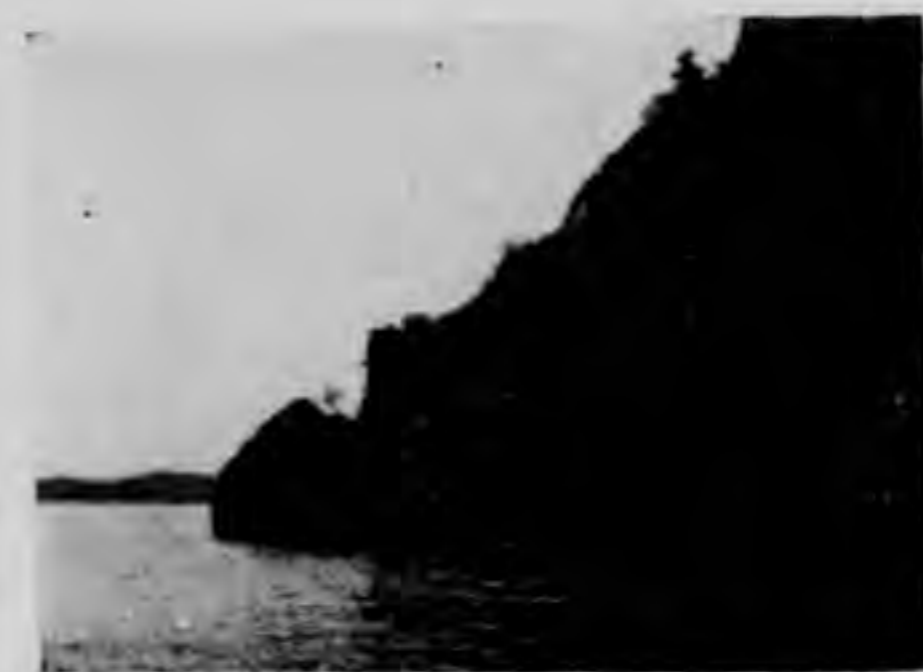
二三五 燕子磯 (二)

This rock is situated outside Kuan-ing Men (now abandoned) immediately on the Yangtze River. Because of its resemblance to a swallow rushing to the river, it has been called the Swallow Rock. In 1842, during the Opium War, the British marines landed here and marched thence on to Nanking.