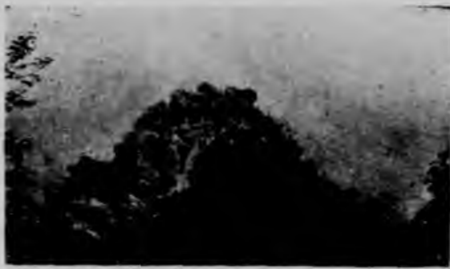
二三六 燕子磯 (三)