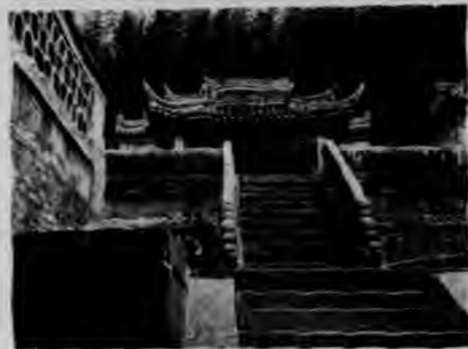
二八三 隆昌寺銅殿 (一)