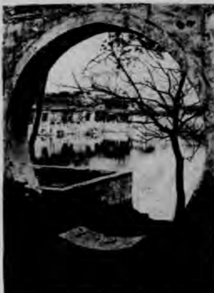
三一二 由「柳岸波光」望 清遠堂及水石居