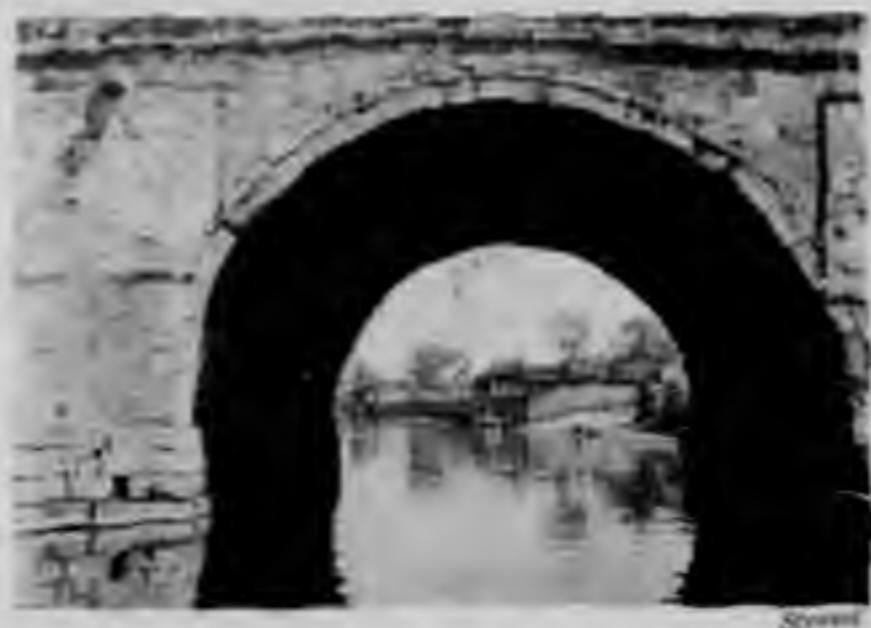
四五 西華門外之玄津橋 (一)

This was the inner west gate of the Imperial City. The outer west gate, called by the Chinese, Hsi-hua Men, is situated some five hundred m. westwards. The former has three arched doors upon which once stood a mighty tower.