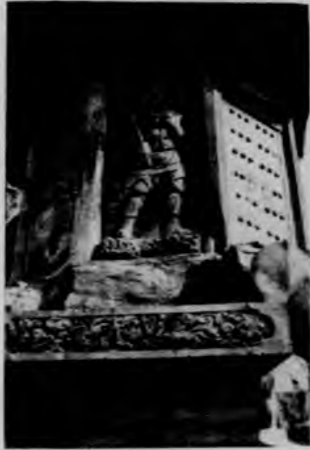
二二八 四天王 (一)