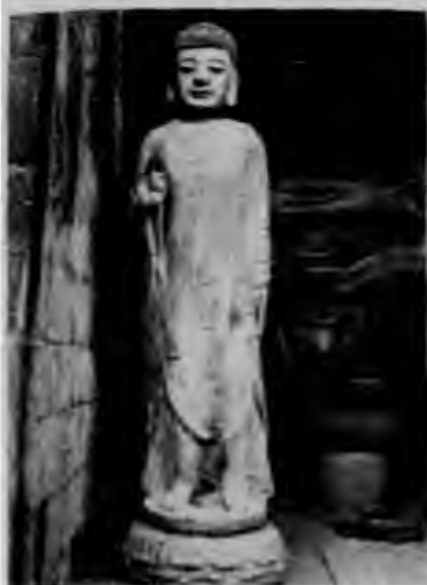
二二四 棲霞山三聖殿 右石佛