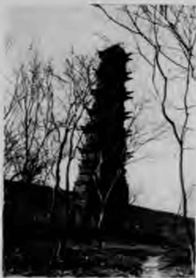
二七一 方山上定林寺 (一)