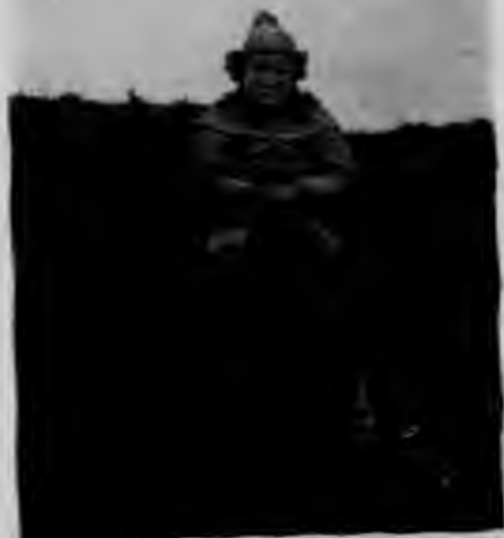
八四 明開平王常遇春墓 在天保城之東，去太平門東北約一里，墓前有 石羊、石馬、石將、石吏，最後明墓在焉。