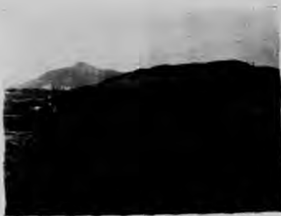
一八 棲霞山西北張家庫 失名之古墓 墓不知為何許人，有二辟邪，高可丈餘。

Cheng Wu-ti, the founder of the Cheng Dynasty and conqueror of the southern power, reigned from 557 to 559. His tomb is situated in the region of Shih-ma Chong, near Yang-fang Cheng. The picture shows the right one of the two stone animals, the only remains of the tomb of the once mighty emperor.