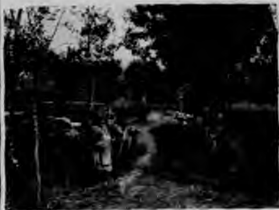
八二 明岐陽王李文忠墓全景 在太平門東北四里餘，有帝倫親神道碑，立於 左。再進道旁，石一已具輪廓，左為石馬，右道旁者 有石羊、石虎、石將、石吏，最後明墓在焉。