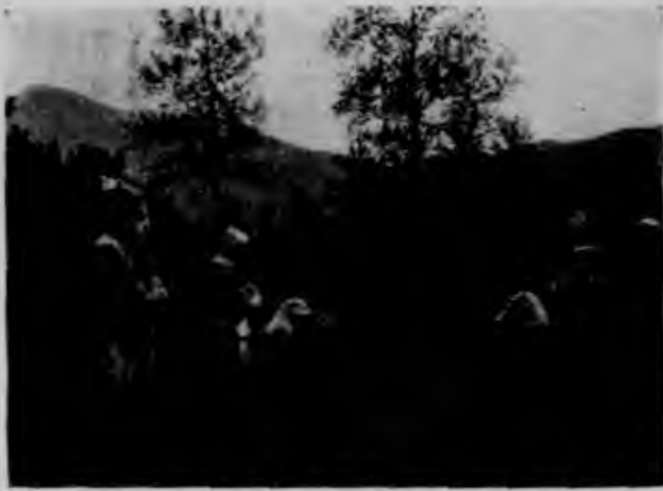
七八 明中山王徐達墓全景 (二)