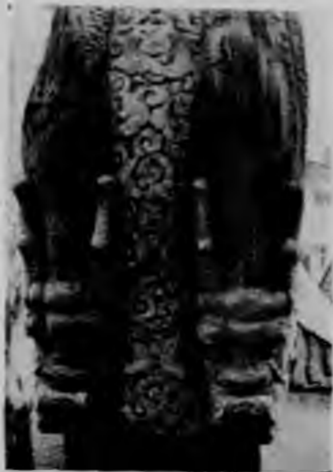
— 二 — 明永樂天妃宮碑額側面 現見前。

121. The Top of the Monument of Tien-fei Kuang (2). See under (120).