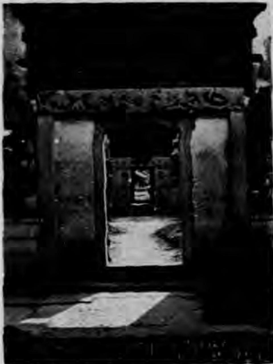
一五三 宋聚村明代之浮雕 (一)

Hu-shu, a small town situated on the upper course of the Chin-huai River, was a strategic point at the time of the Six Dynasties. It still possesses the ruins of a terrace dating from the Liang Dynasty, where, it is told, the crownprince of Liang Wu-ti had studied.