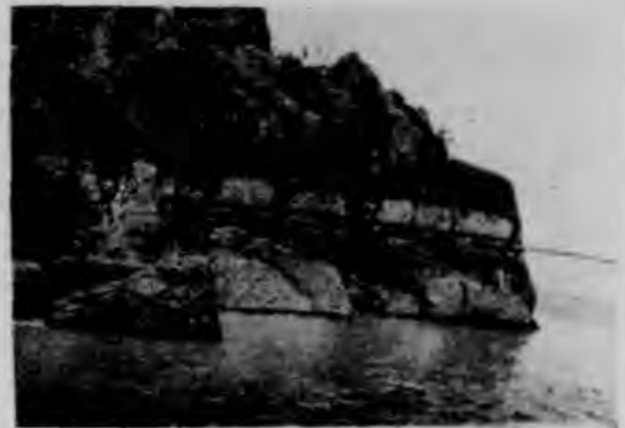
二三七 燕子磯 (四)