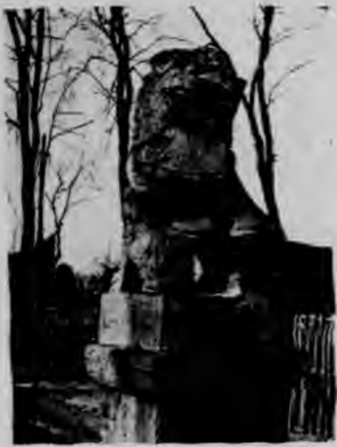
五一 明故宮石獅 (三)