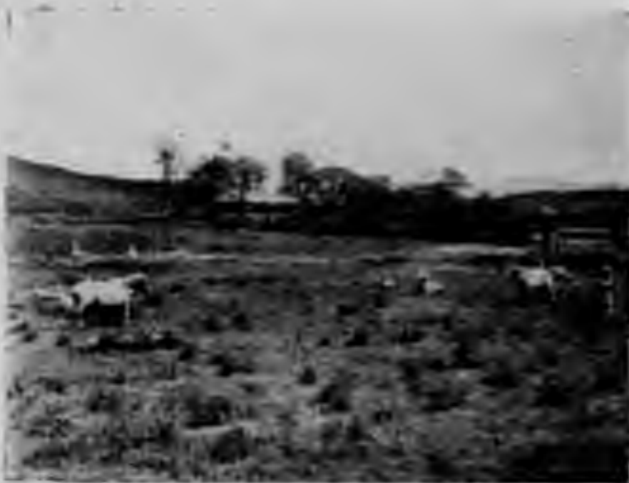
一〇四 明（正統）南京刑部尚書 贈太子少保周瑄墓

This unknown Ming tomb is situated to the southeast of Ten-lung See, outside the South Gate. The monument was destroyed; all that remains are two stone horses, two stone sheep and two stone figures.