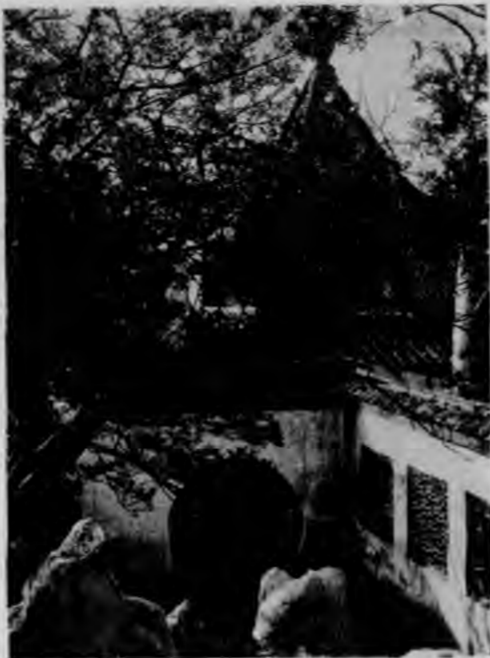
三一三 蔡園 (一)