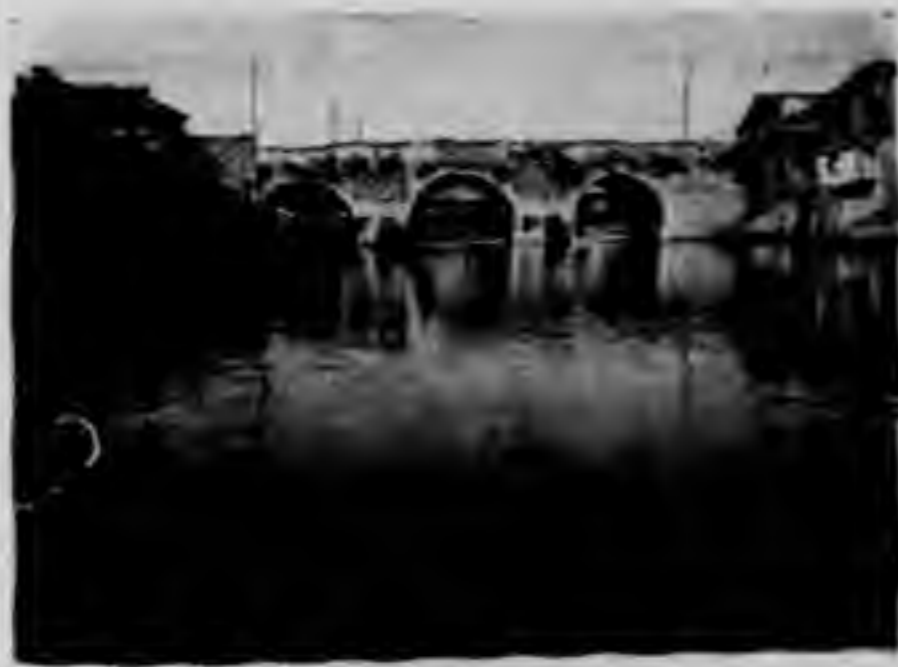
五三 西華門外之玄津橋 (二)