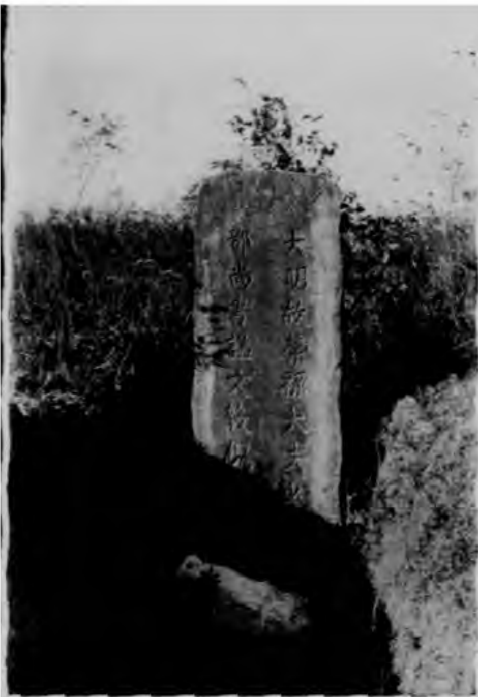
一一三 明吏部尚書倪岳墓碑 說見前。