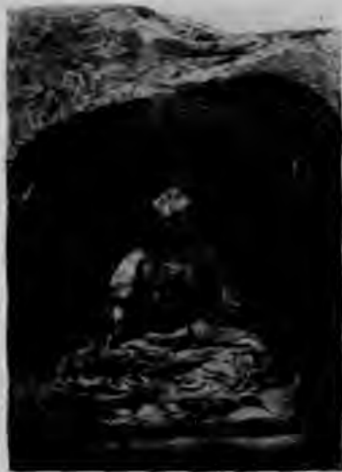
二四八 石佛庵石佛 (一)

在院中有千六山呼 石佛年有石 山佛庵按石佛 之洞有建佛 北就碑康十子 二山二志餘廟 十里一引驛或 古佛水邊傳此 爲像樂古唐然 括數一蹟武 花十爲編后 禪略天武造