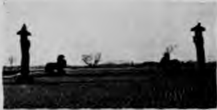
一五 梁南康簡王 蕭績墓全景

This tomb is situated in the village Sung-sze, in the neighborhood of Chen-hua Cheng. The column, which is the only support of this tomb, has inscribed a tablet, but because of decomposition through many centuries it is impossible to determine the person, to whom the tomb belonged.