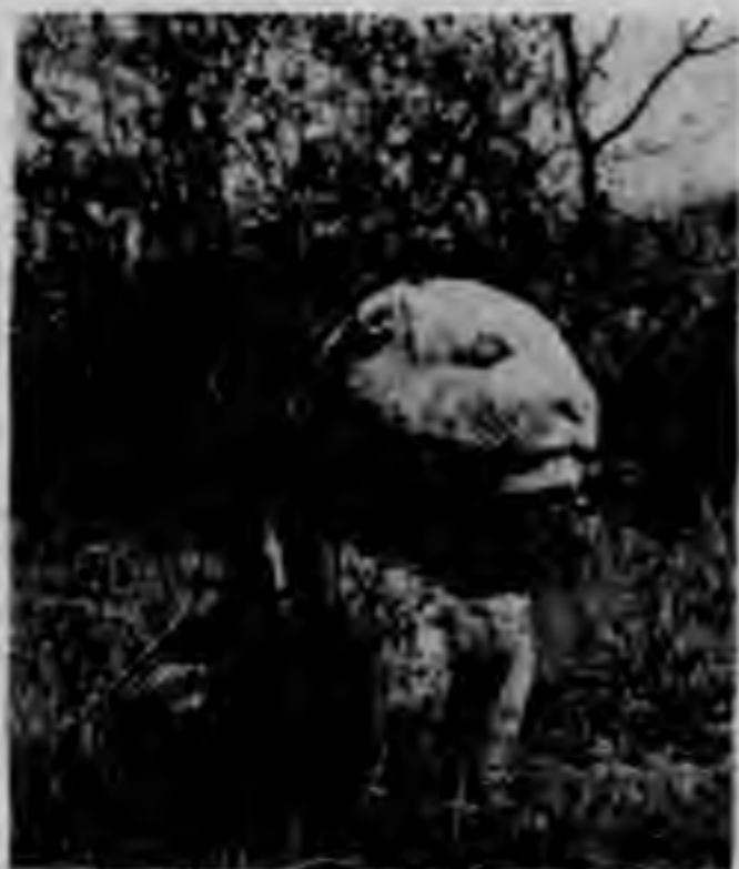
八六 明海國公吳楨墓 石虎