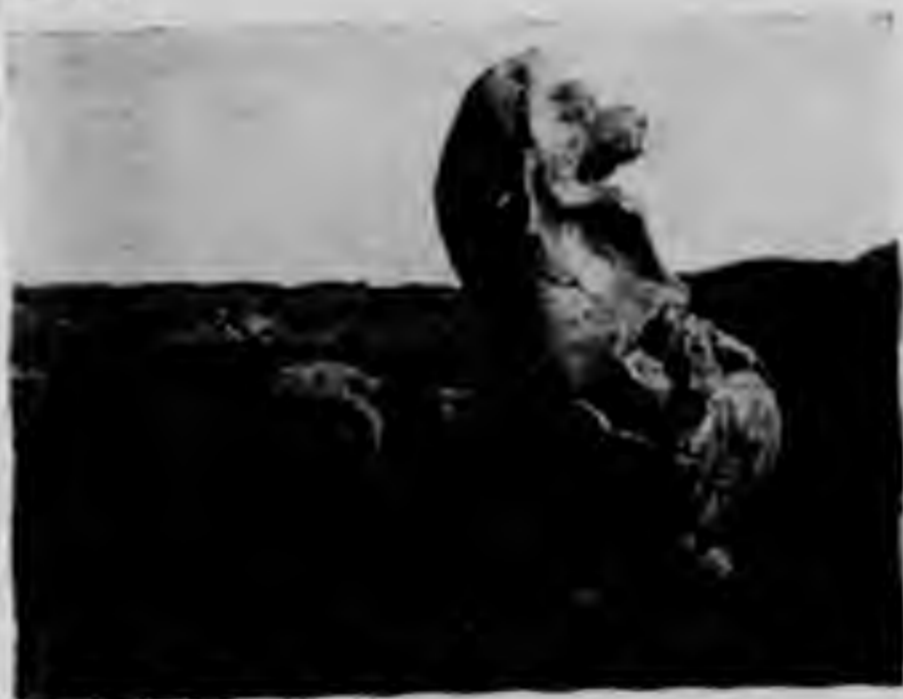
一九 陳武帝萬安陵麒麟 陵在高橋門外上方鑿石馬甬，存二麒麟，作風與宋陵頗有不同。

Here one sees the interesting base of the column, which shows the sculpture of two winged dragons. Some writers hold that they are lizards, while still others believe them to be two frogs. As regards the history of Hsiao Hsiu, see Index (19).