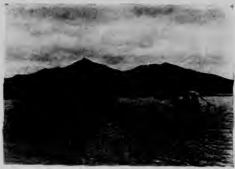
二〇五 水上鍾山 (二)

The Purple Mountain, in Chinese, Tse-ching Shan, originally called Ching Shan, is 468.8 m. high. It is the highest mountain in the district of Nanking. This picture was taken from the Hsuan-wu Lake and shows us a fine reflection of the mountain.