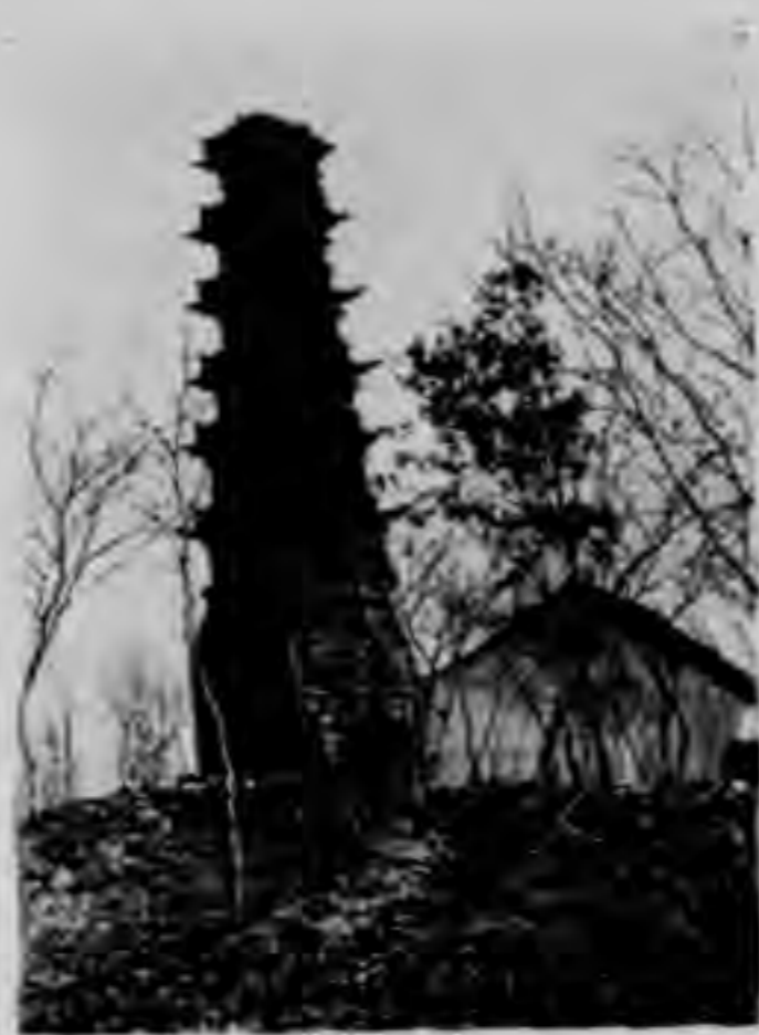
二七二 方山上定林寺 (二)

This is one of the oldest Taoist temples in Nanking. It was built as early as 247 by Da-ti, the founder of the Wu Dynasty (222-279). It has a garden full of rare plants.