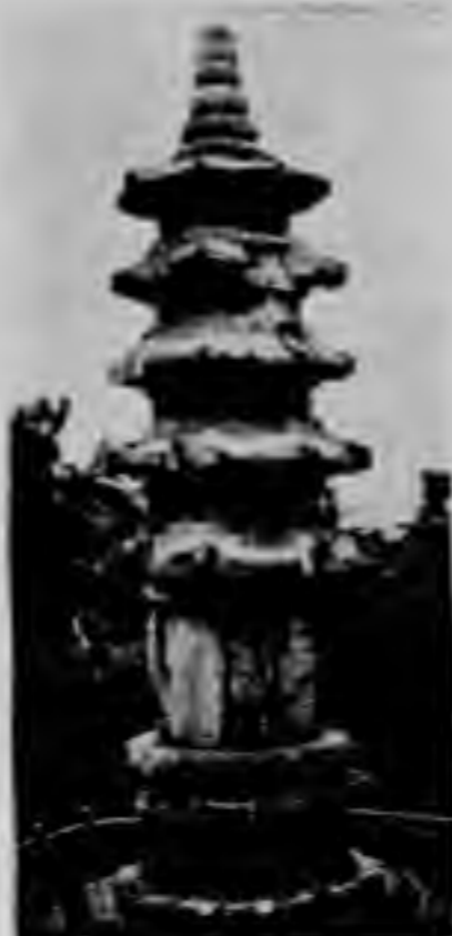
二二五 棲霞寺 舍利塔全景

此塔係隋文帝仁壽五年(595)所建，唐高祖武德元年(618)重修，唐高宗永徽元年(650)再修，唐高宗永徽元年(650)再修，唐高宗永徽元年(650)再修。