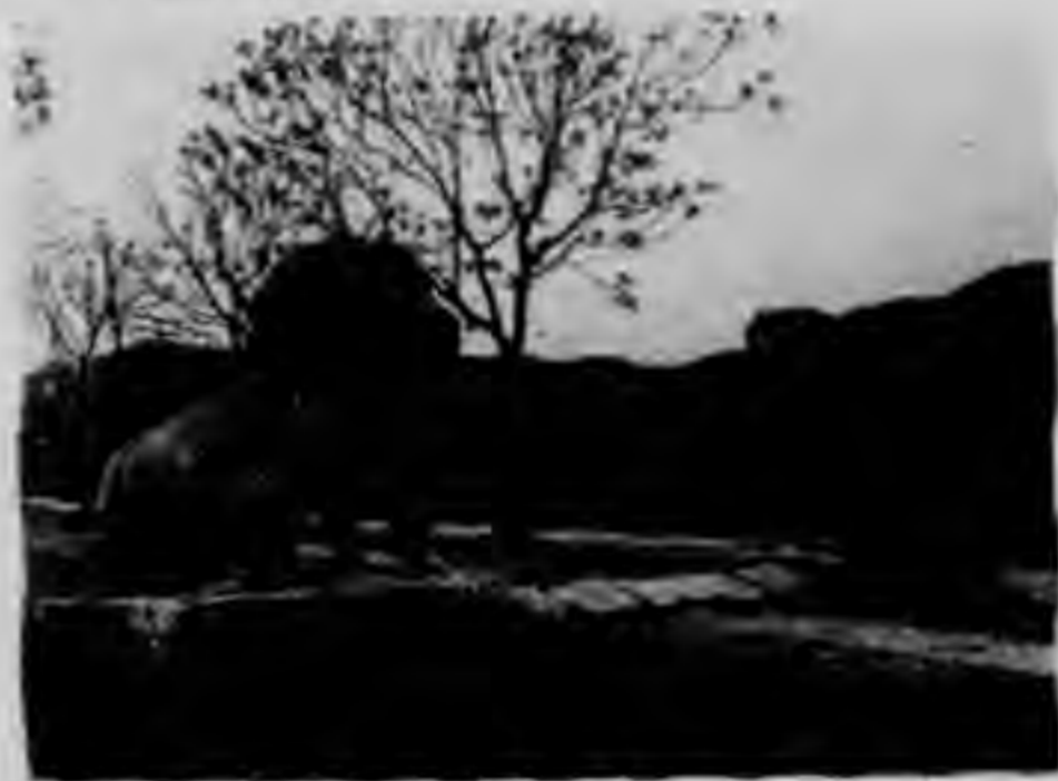
59. Ruins Beside the Quadratic City-wall. See under (56).

大金門四方城間，石欄龍首，殘蹟猶多，想當年制度，當更爲嚴謹，未必盡如現存之建築也。