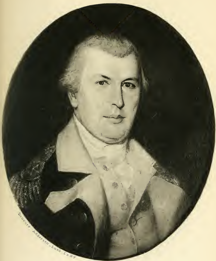
Engraving - Addersen - Lamb - L. N. Y.