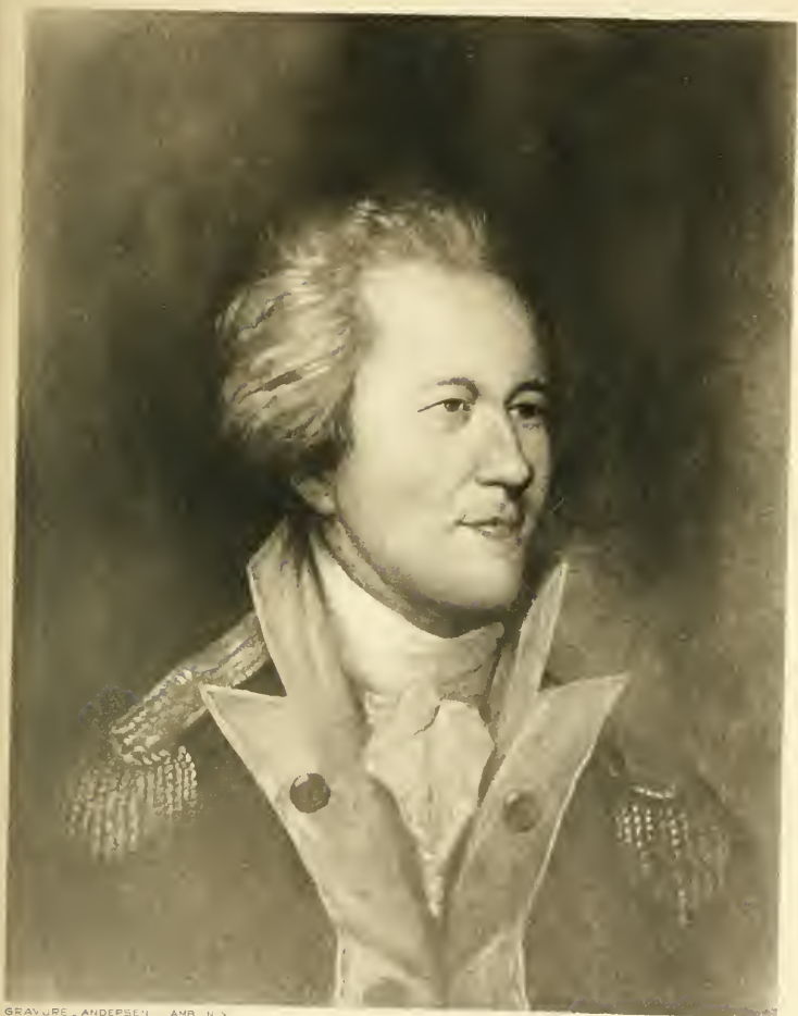
GRAVURE. ANDERSEN. AMB. N. Y.