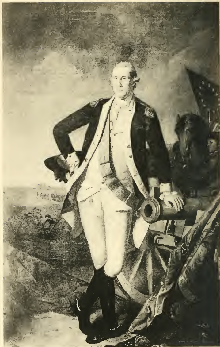
Engraving.