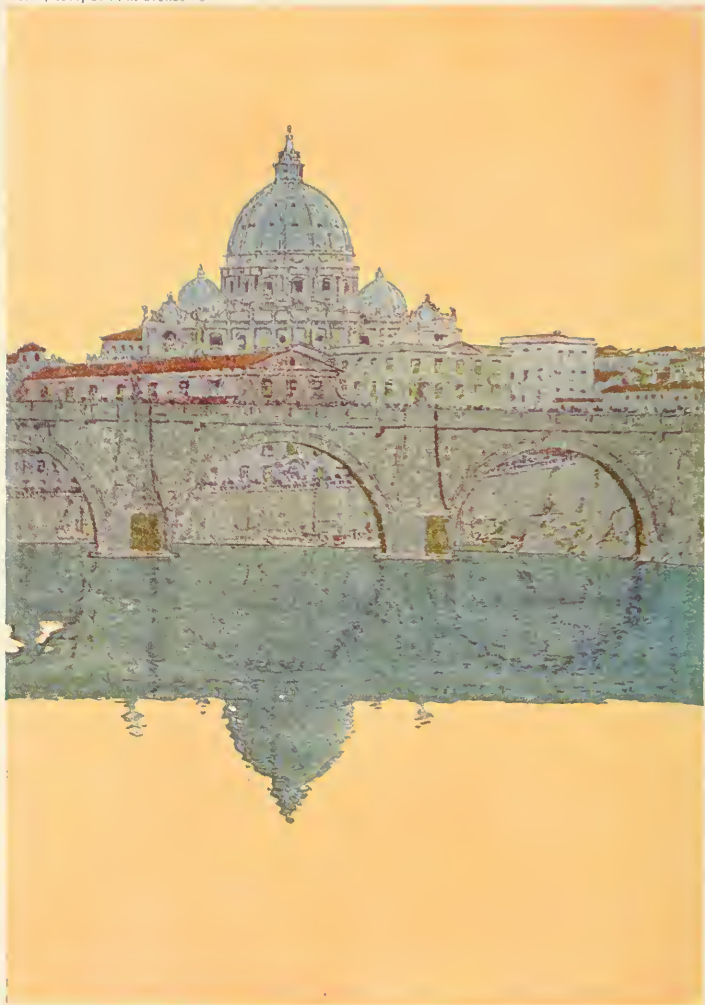
"THE ETERNAL CITY" (From the Painting by Jules Guérin)