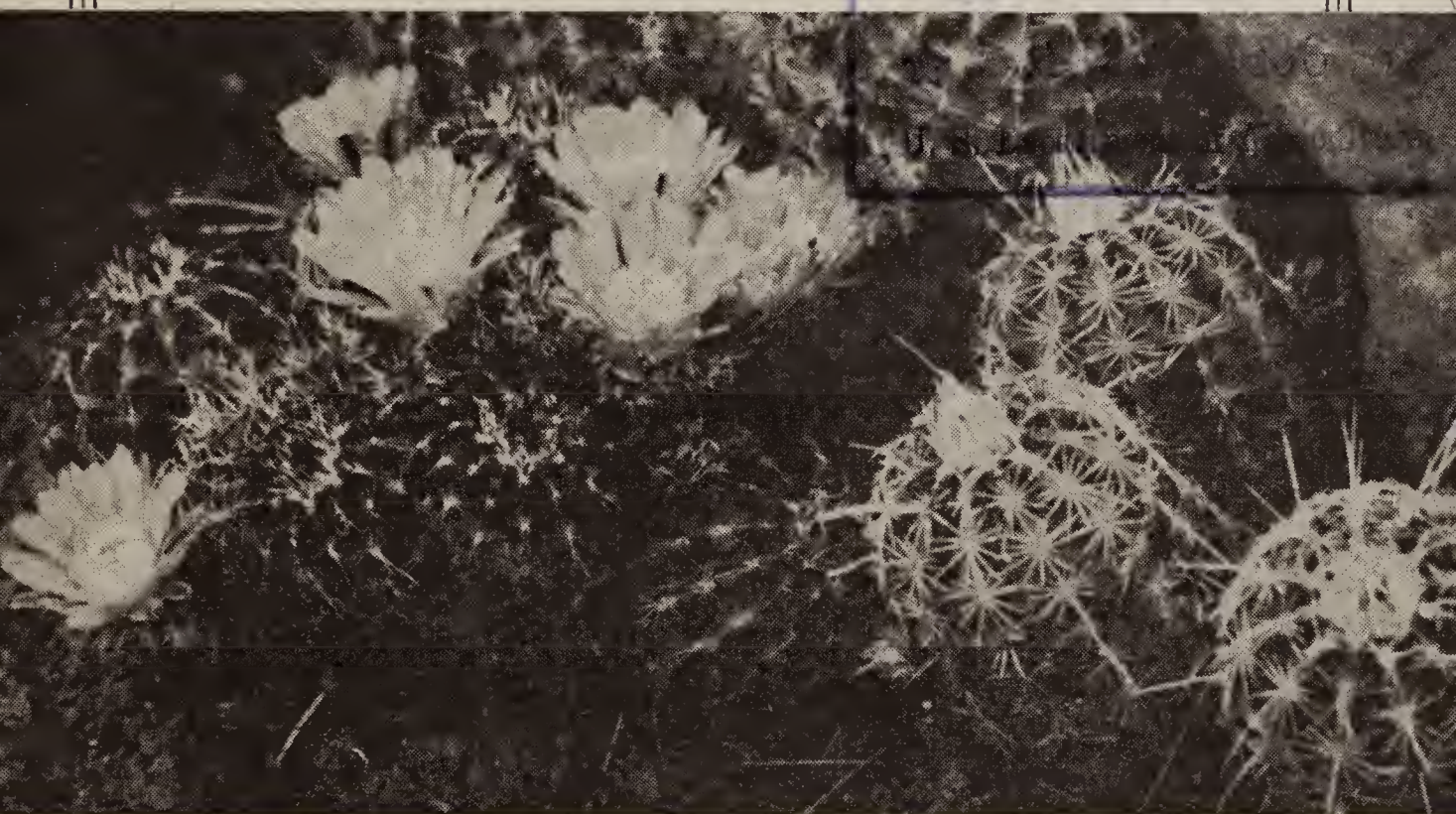
Echinocereus Viridiflorus in the Rock Garden